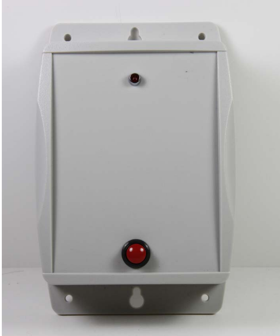
EXHIBIT: RQA-152 front view with no label (front panel label included as separate exhibit) FCC ID: AIERIT32-152