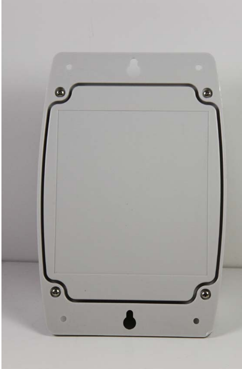
EXHIBIT: RQA-152 and RQT-152 back view FCC ID: AIERIT32-152