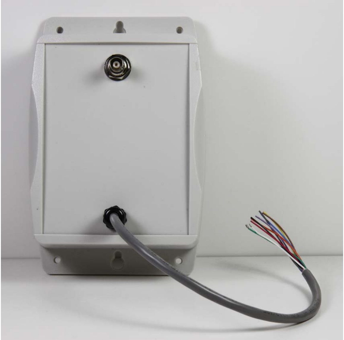
EXHIBIT: RQT-152 front view with no label (front panel label included as separate exhibit)