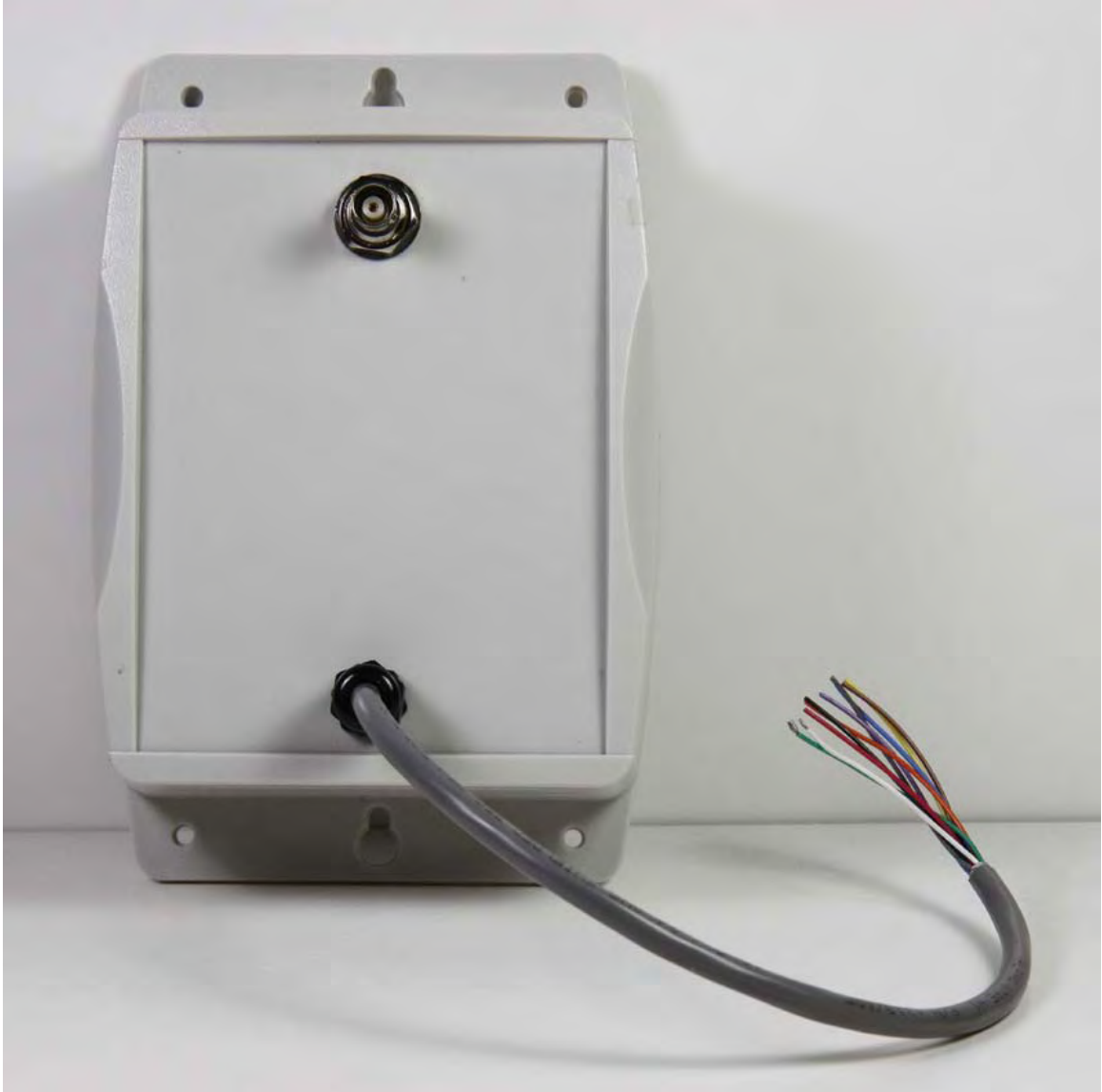
EXHIBIT: RQT-151M front view with no label (front panel label included as separate exhibit)