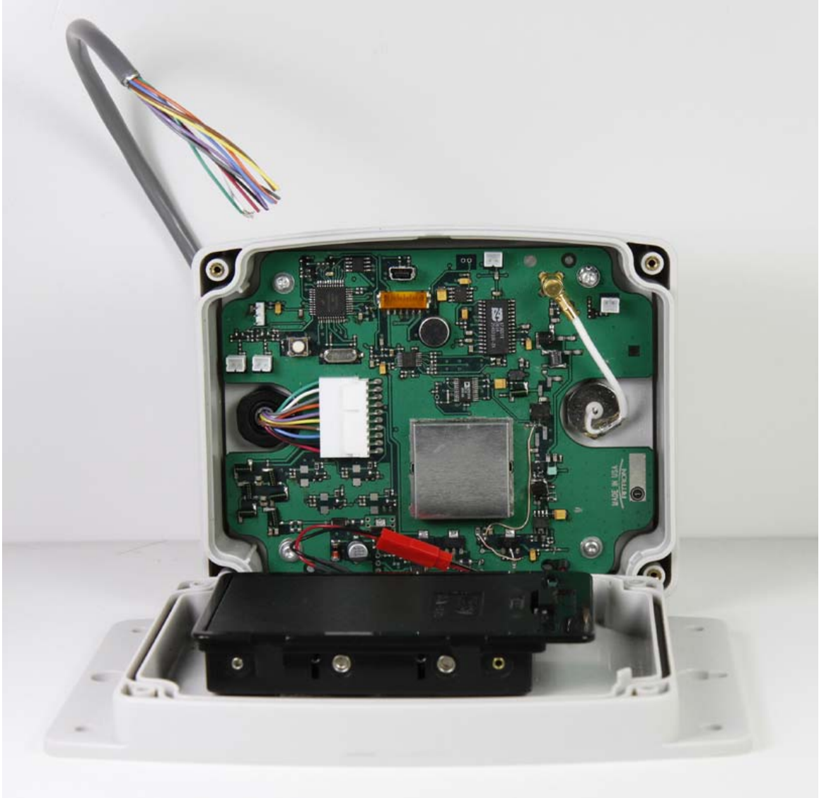
EXHIBIT: RQT-151 with case open to show printed circuit board installation FCC ID: AIERIT32-151