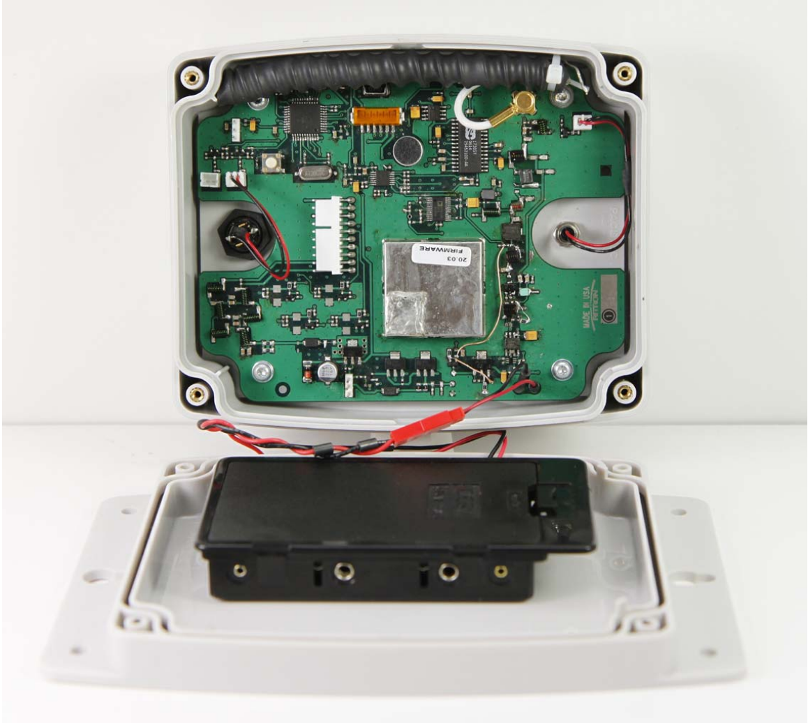
EXHIBIT: RQA-151 with case open to show printed circuit board installation FCC ID: AIERIT32-151