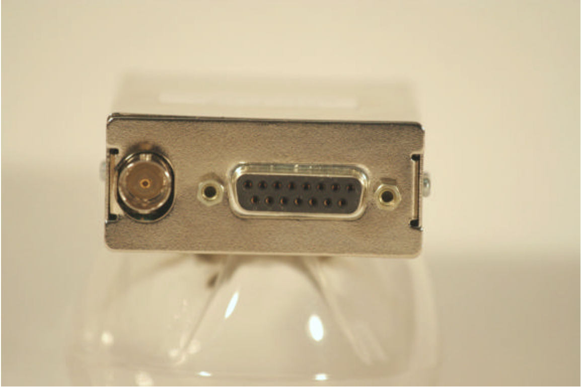
Front of Unit