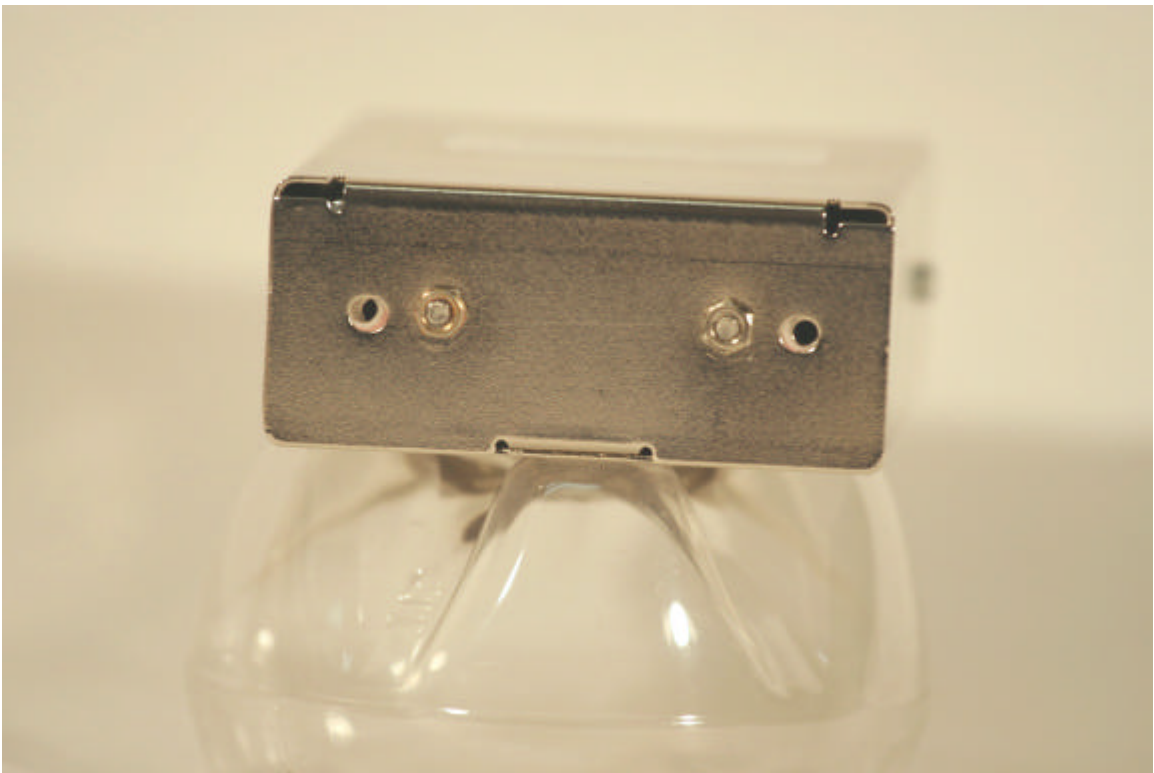
Rear of Unit