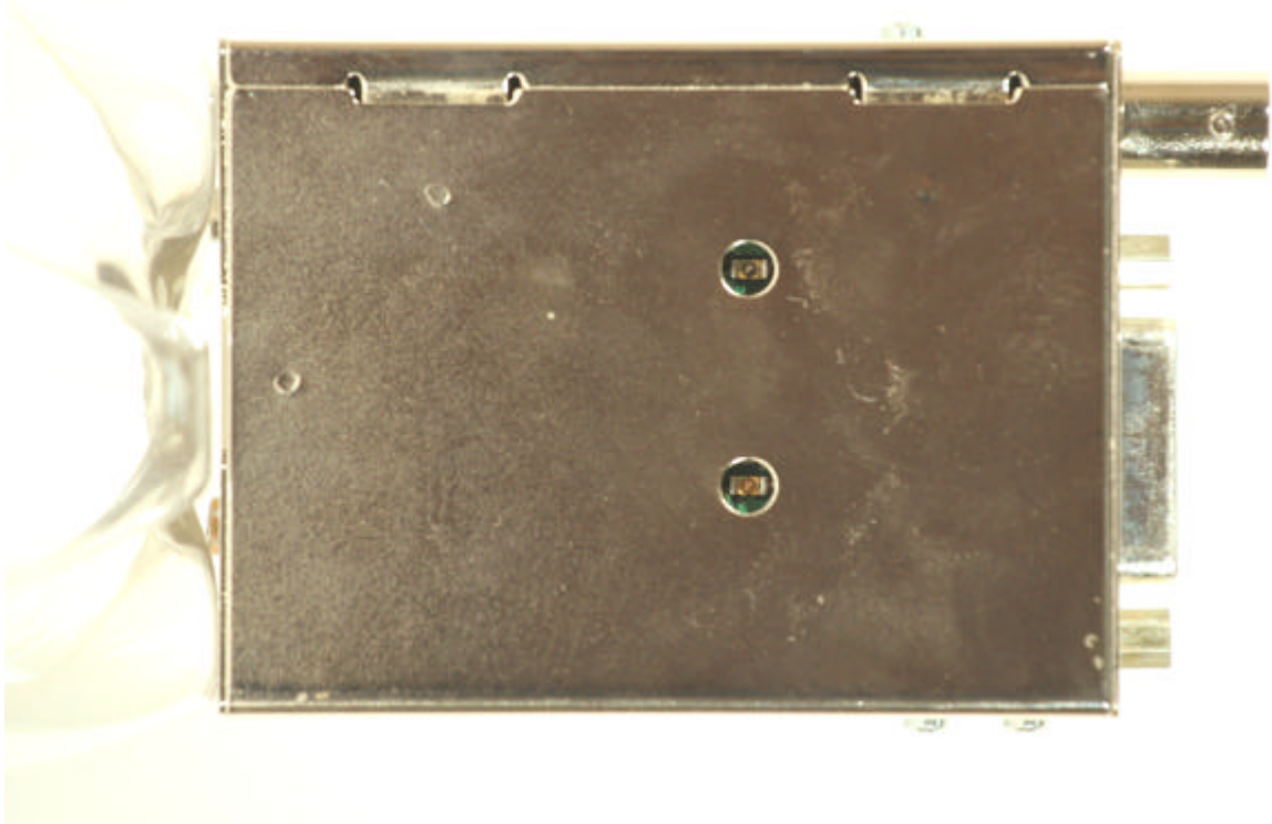
Bottom of Unit