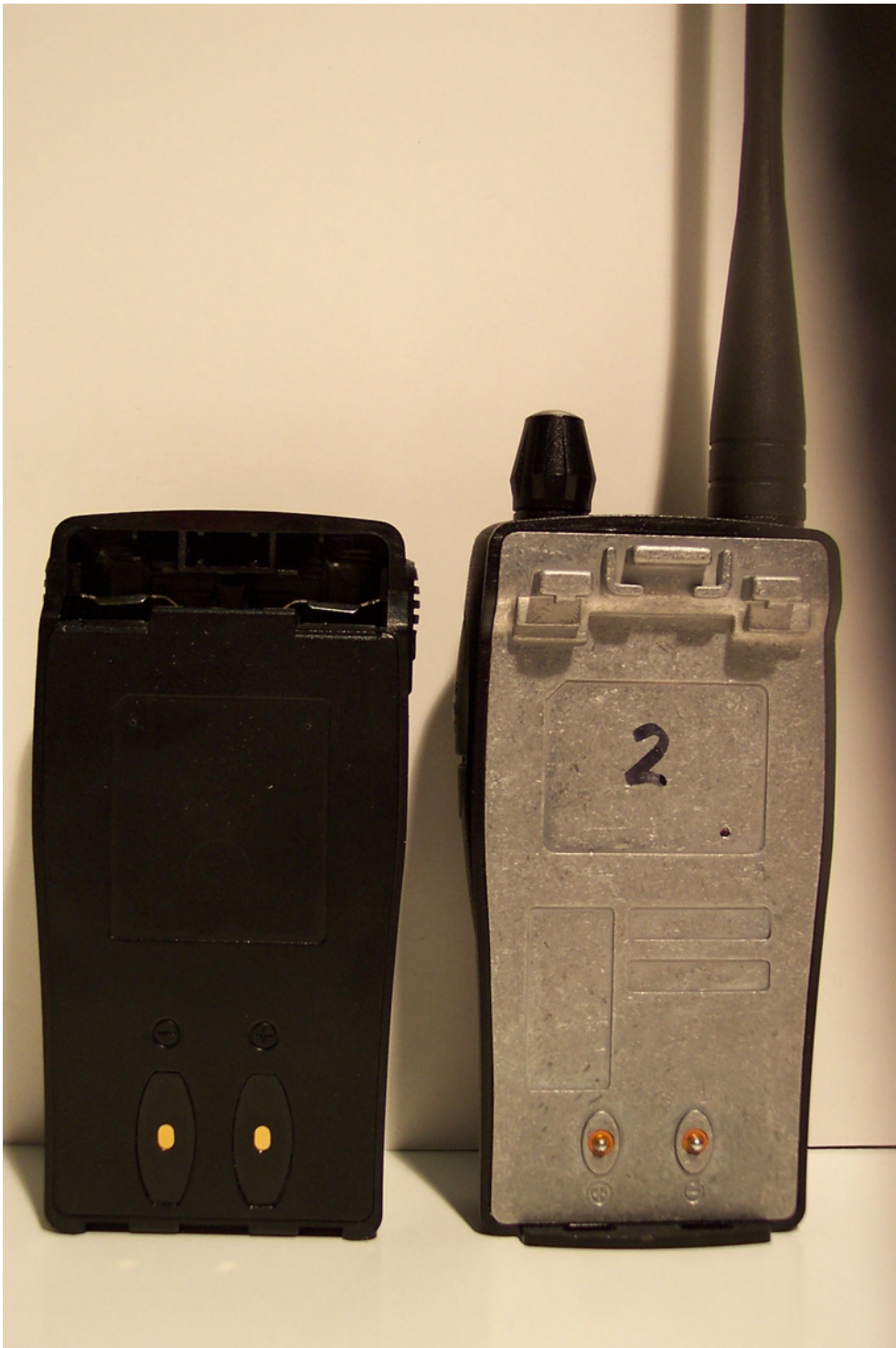
EXHIBIT: SPX-400 RF and Control PCB assembly installed in front case, battery removed FCC ID: AIERIT19-450 IC: 1084A-RIT19450