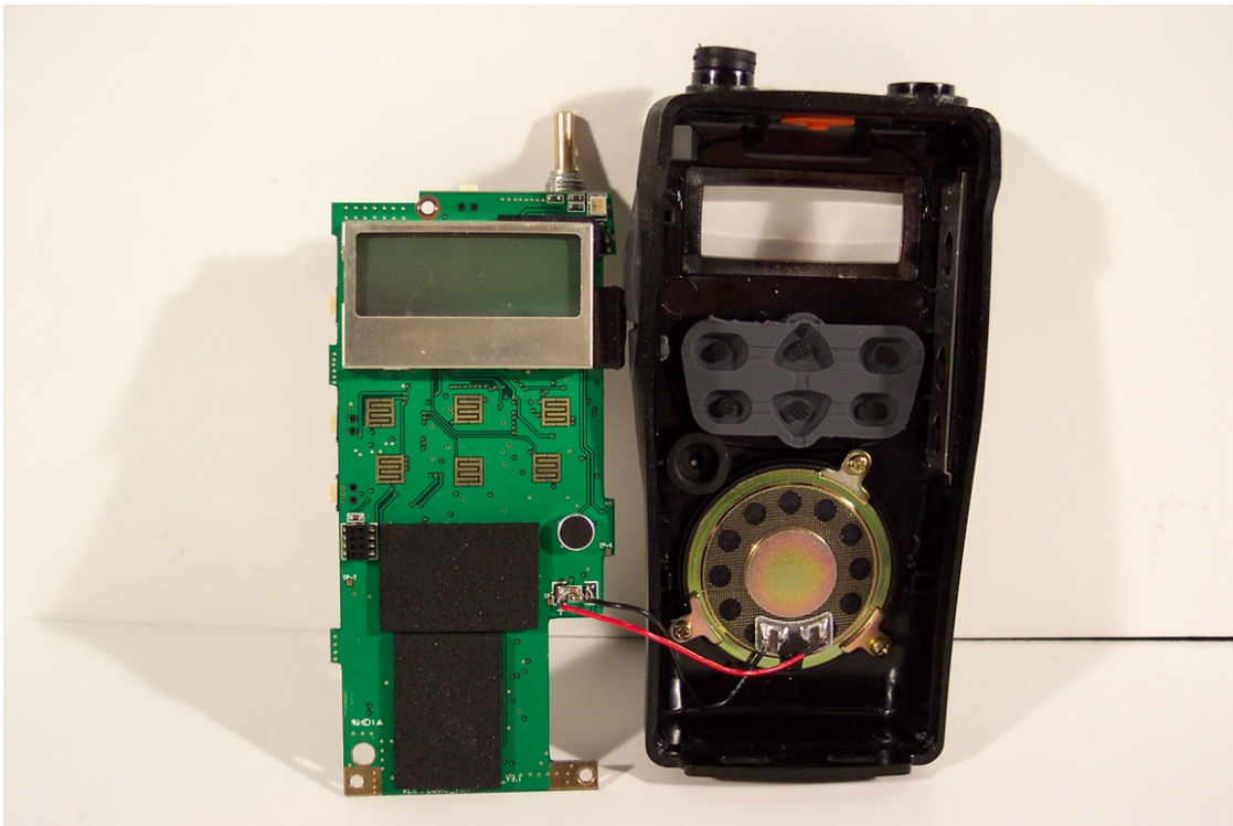
EXHIBIT: SPX-400 Control PCB connected to front case