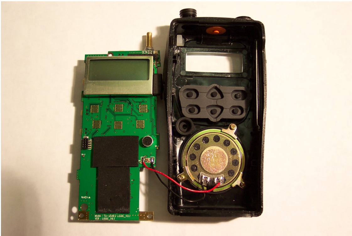
EXHIBIT: SPX-200 Control PCB connected to front case