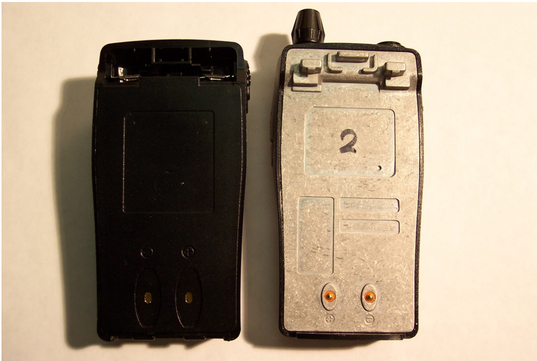
EXHIBIT: SPX-200 RF and Control PCB assembly installed in front case, battery removed