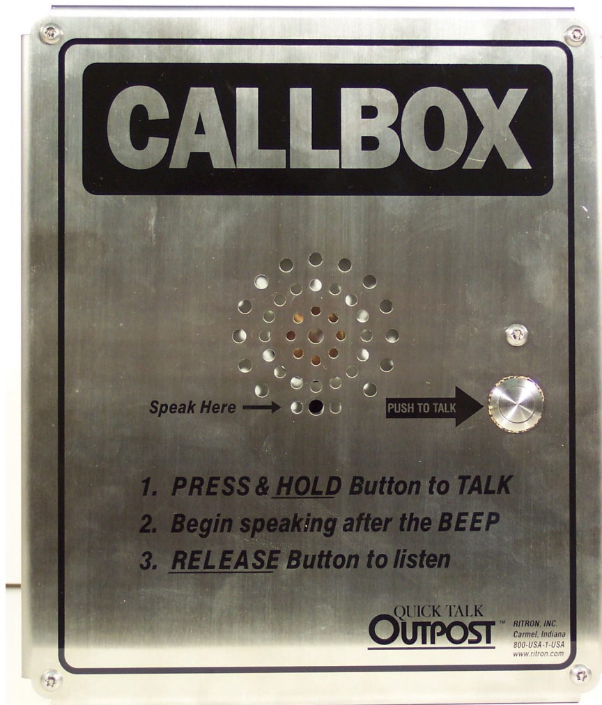
EXHIBIT: RQX-456-XT front view with ON/PTT button and speaker grille FCC ID: AIERIT18-456 CANADA: 1084A-RIT18456