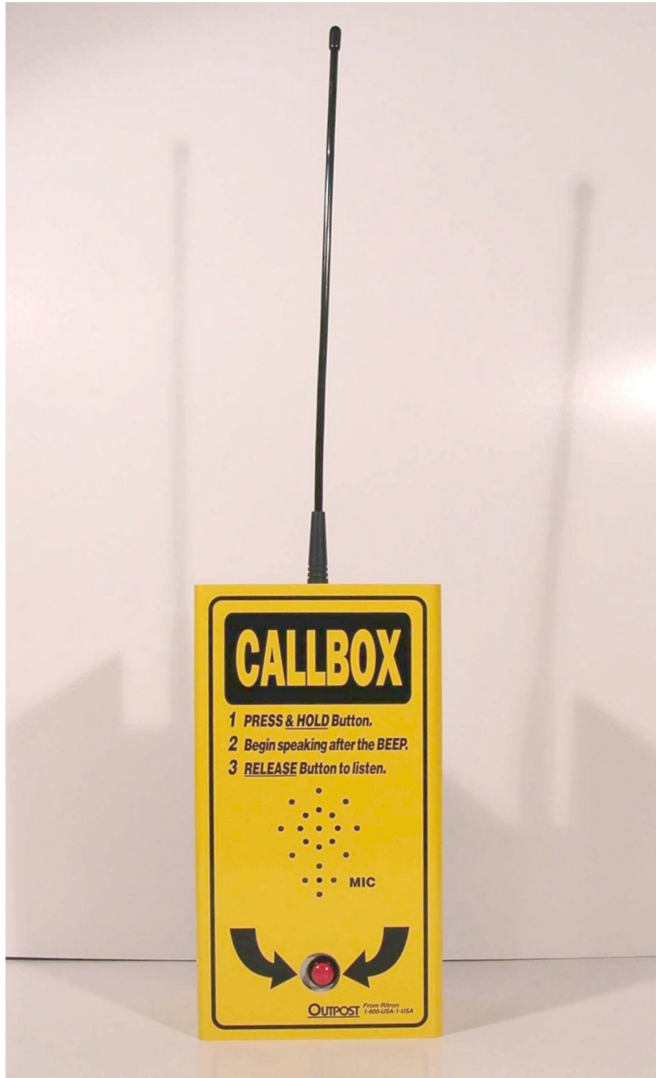
EXHIBIT: RQX-456 front view of facade with ON/PTT button and speaker grille FCC ID: AIERIT18-456 CANADA: 1084A-RIT18456