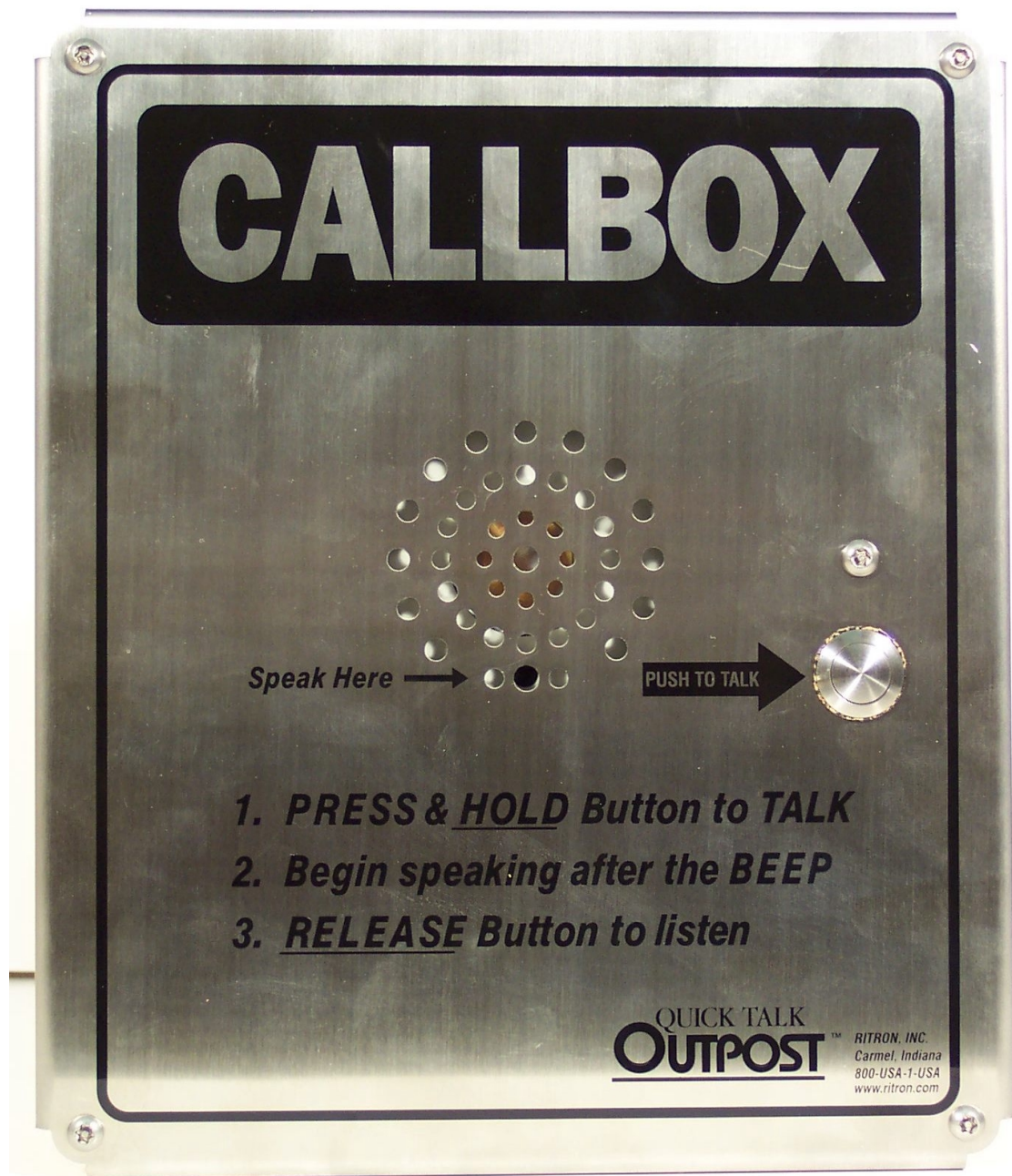
EXHIBIT: RQX-156-XT front view with ON/PTT button and speaker grille FCC ID: AIERIT18-156 IC: 1084A-RIT18156