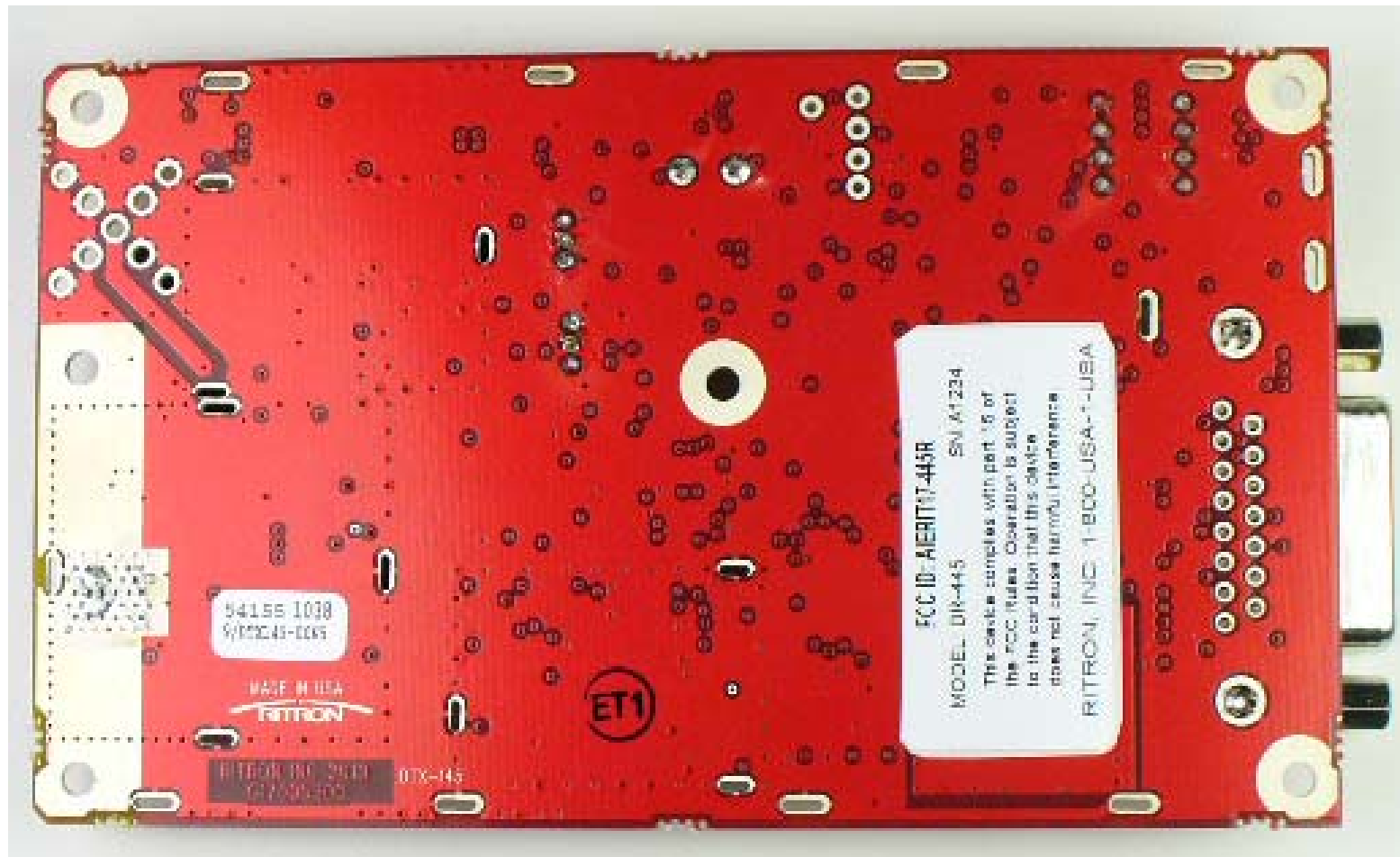
DR-445 FCC ID location