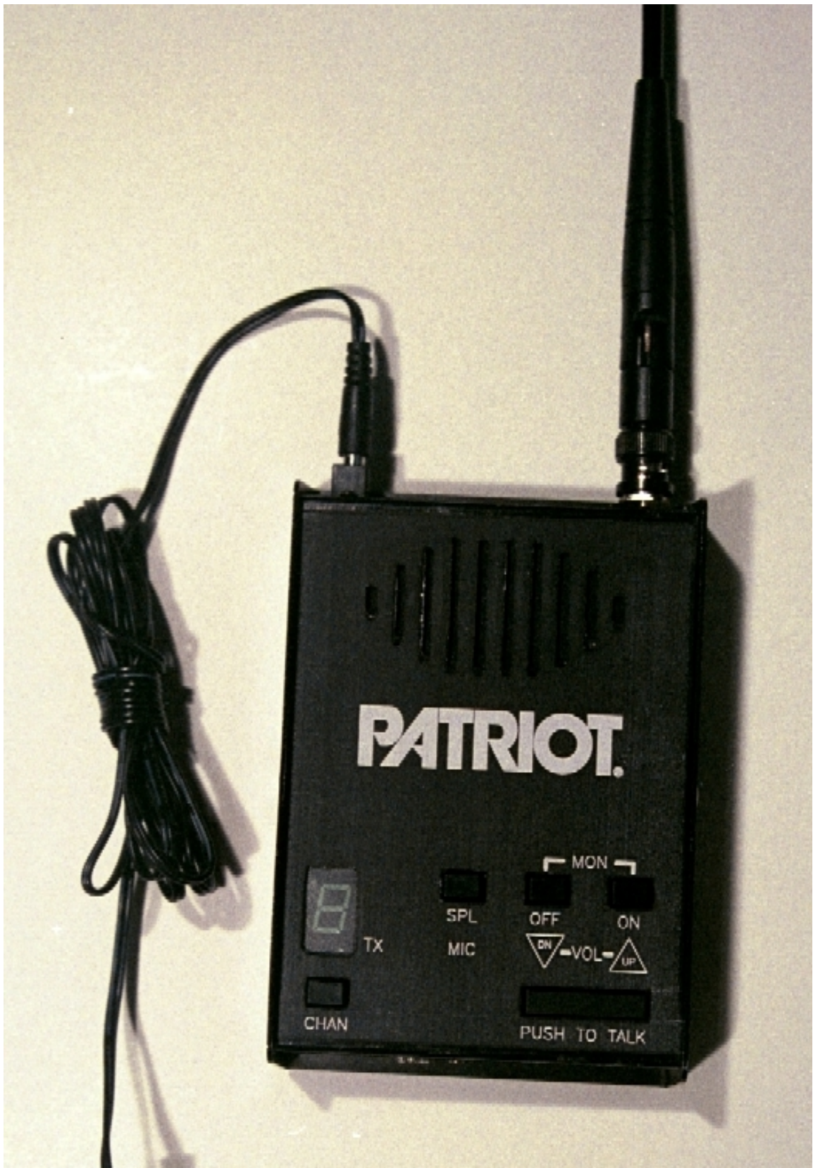
EXHIBIT: PBS-146D in wall mount operation with RPS-1A wall mount power supply connected FCC ID: AIERIT16-146