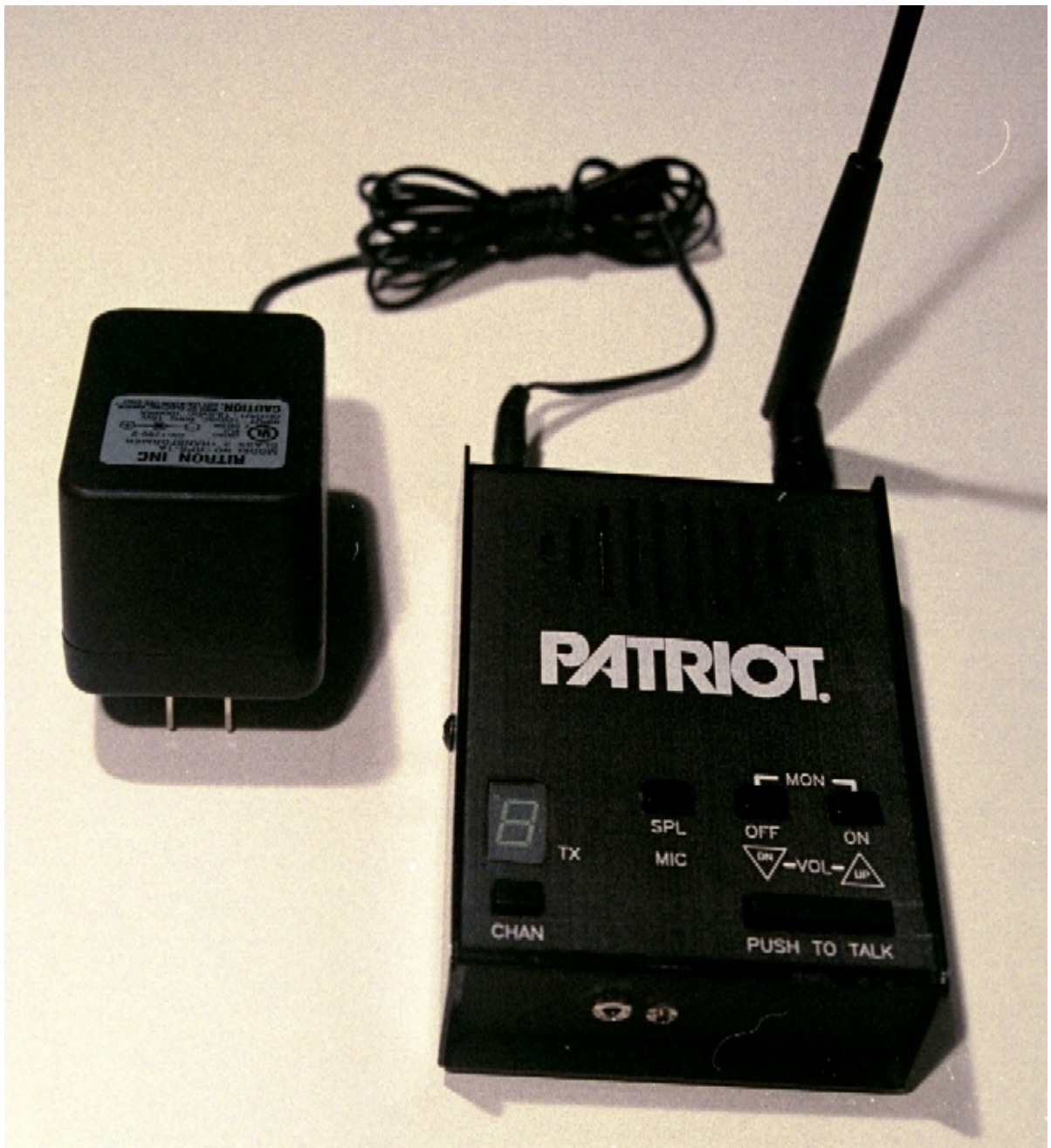
EXHIBIT: PBS-146D in desktop operation with RPS-1A wall mount power supply connected FCC ID: AIERIT16-146