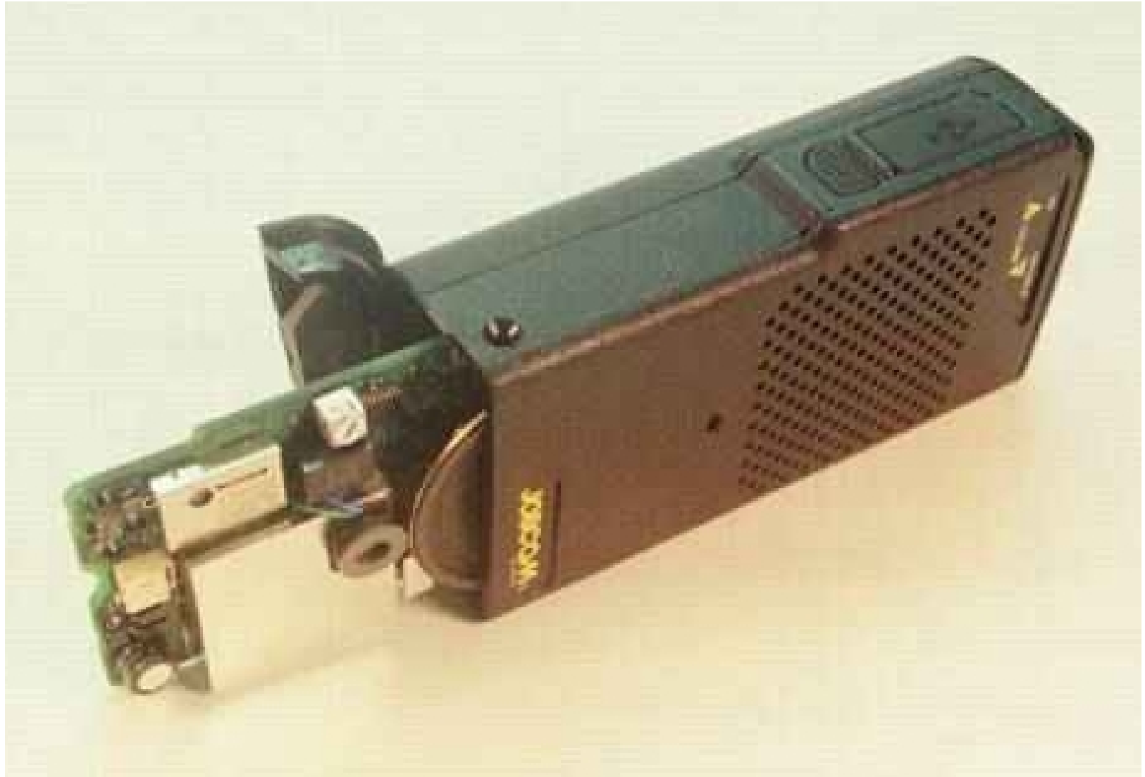
AIERIT13-442 SST-442 PCB installation into case