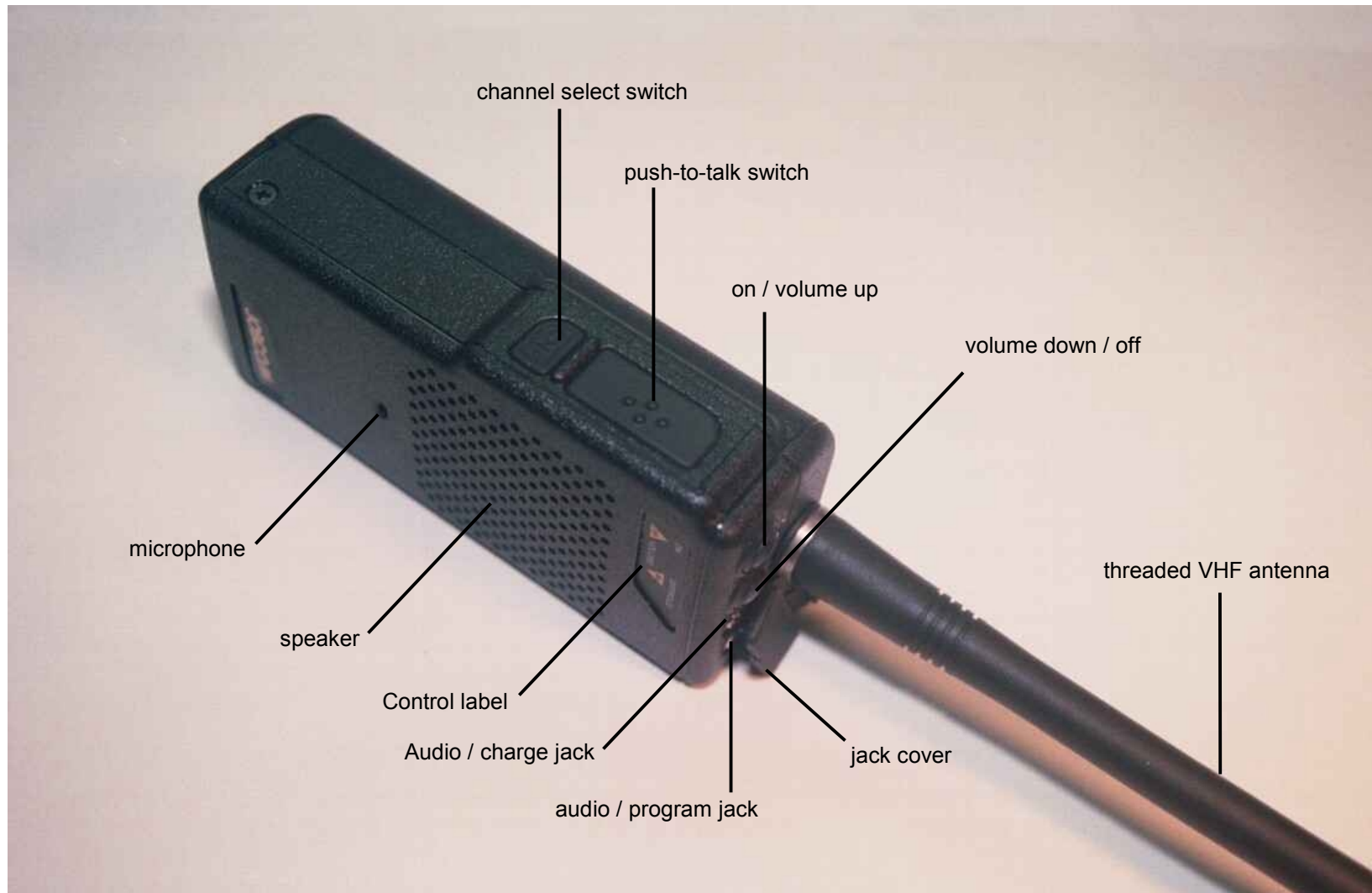
AIERIT13-144 SST-144 controls, jacks, and control label