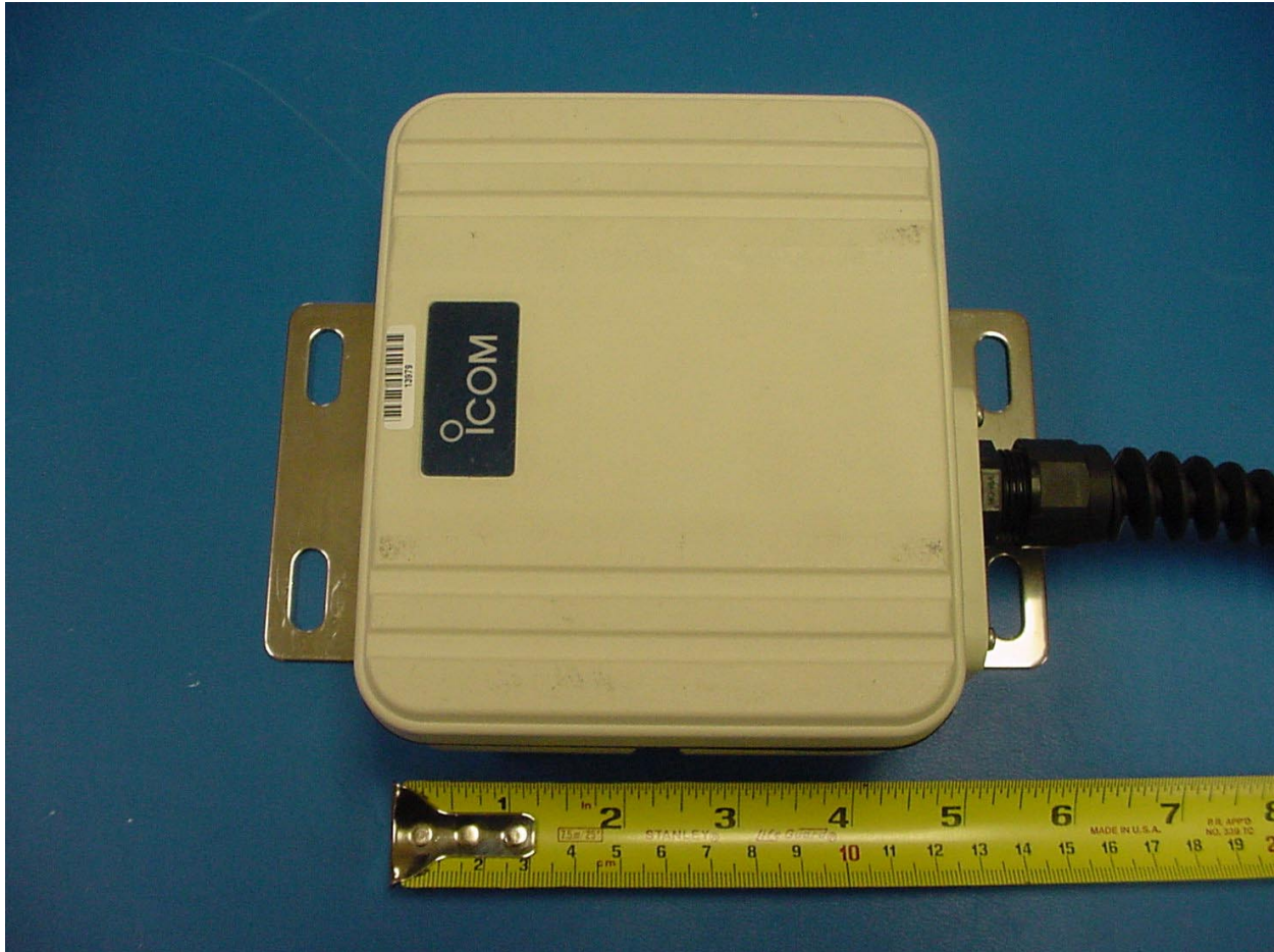
PHOTOGRAPH 8: TOP VIEW AND LEFT SIDE

RTL Work Order: 2001336 RTL Quote Number: QRTL01-382H Date of Tests: 1-7-2002 to 1-11-2002