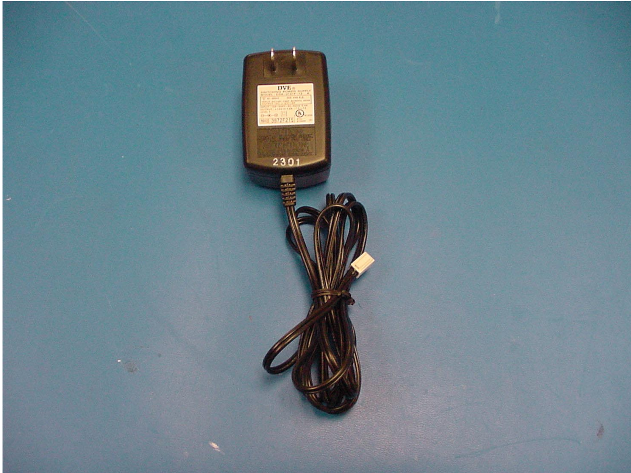
PHOTOGRAPH 6: AC/DC ADAPTER

RTL Work Order: 2001336 RTL Quote Number: QRTL01-382H Date of Tests: 1-7-2002 to 1-11-2002