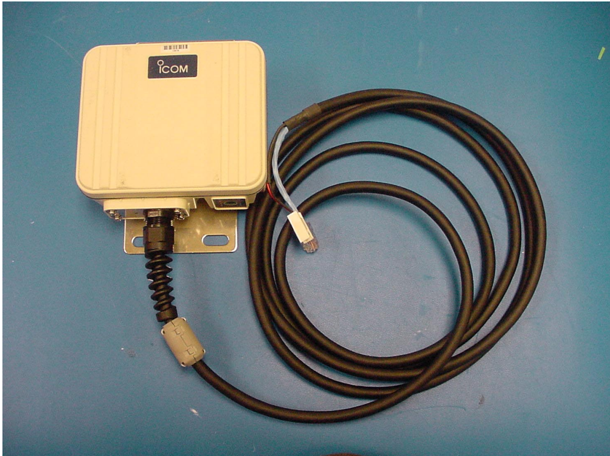
PHOTOGRAPH 5: TOP VIEW WITH I/O CABLES