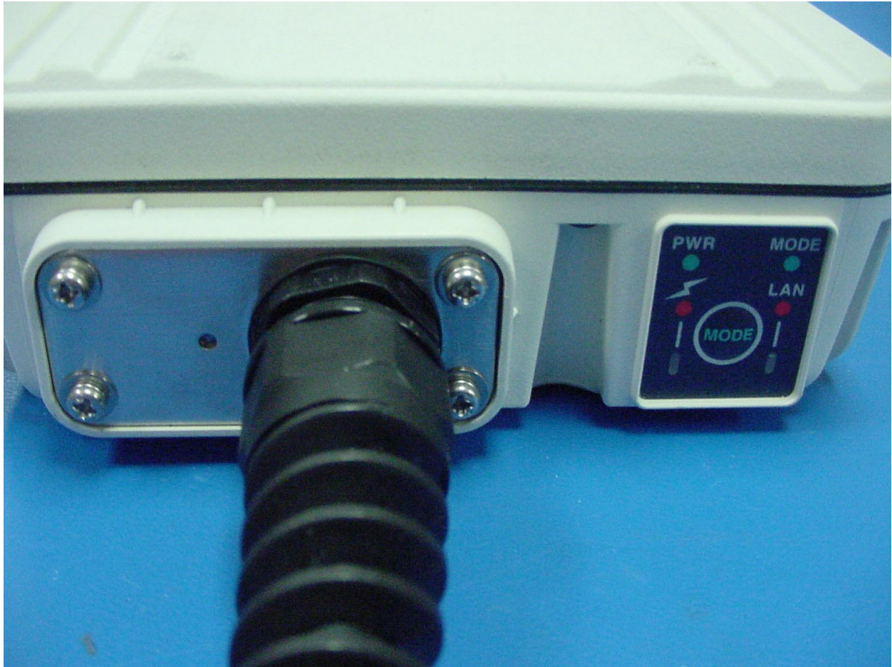
PHOTOGRAPH 10: CONNECTORS, SWITCHES AND LEDS

RTL Work Order: 2001336 RTL Quote Number: QRTL01-382H Date of Tests: 1-7-2002 to 1-11-2002