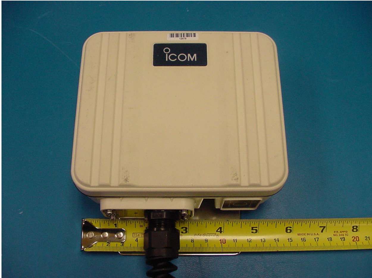
PHOTOGRAPH 7: TOP VIEW

RTL Work Order: 2001336 RTL Quote Number: QRTL01-382H Date of Tests: 1-7-2002 to 1-11-2002