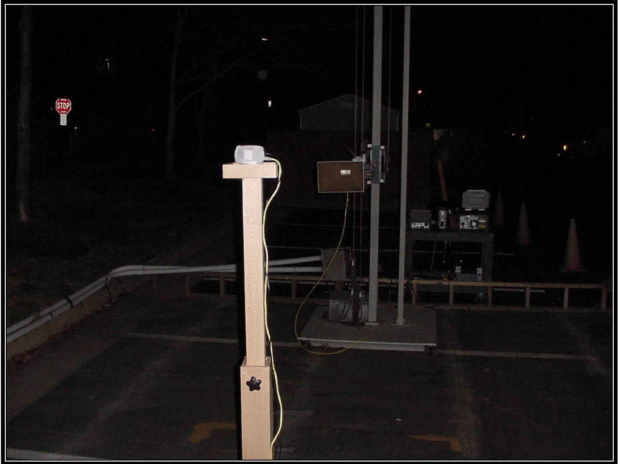
PHOTOGRAPH 3: RADIATED EMISSION REAR VIEW CASE CONFIGURATION