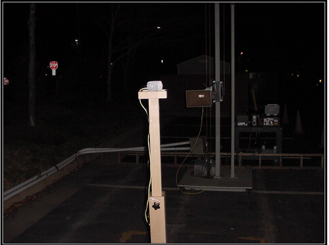
PHOTOGRAPH 2: RADIATED EMISSION FRONT VIEW WORST CASE CONFIGURATION