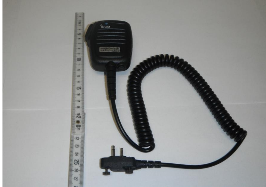
< HM-159LA Speaker Microphone >