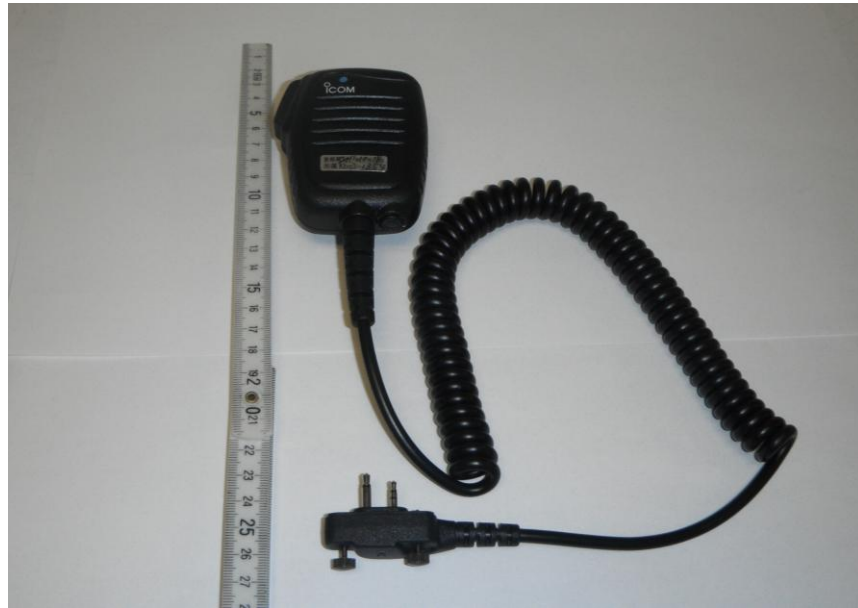
< HM-159LA Speaker Microphone >