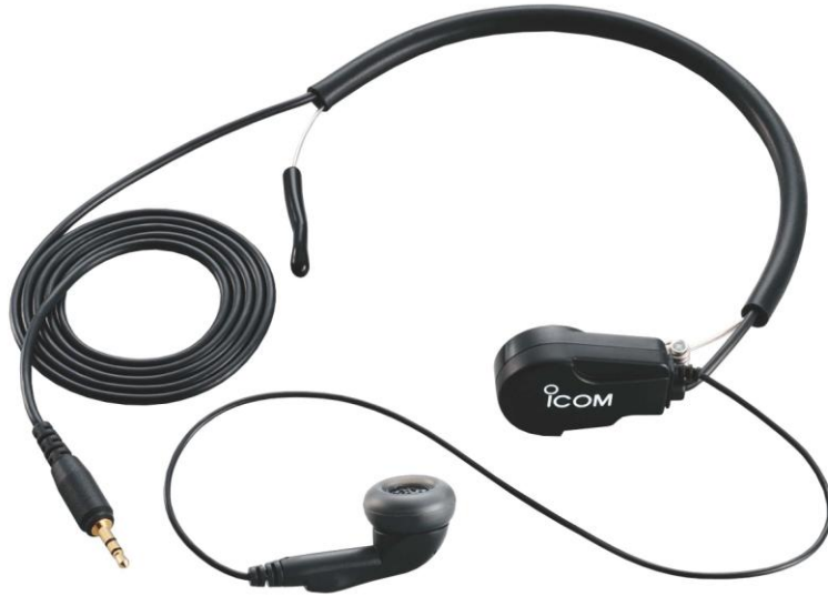
< HS-97 Headset >