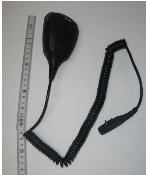
< HM-168LWP Speaker-microphone >