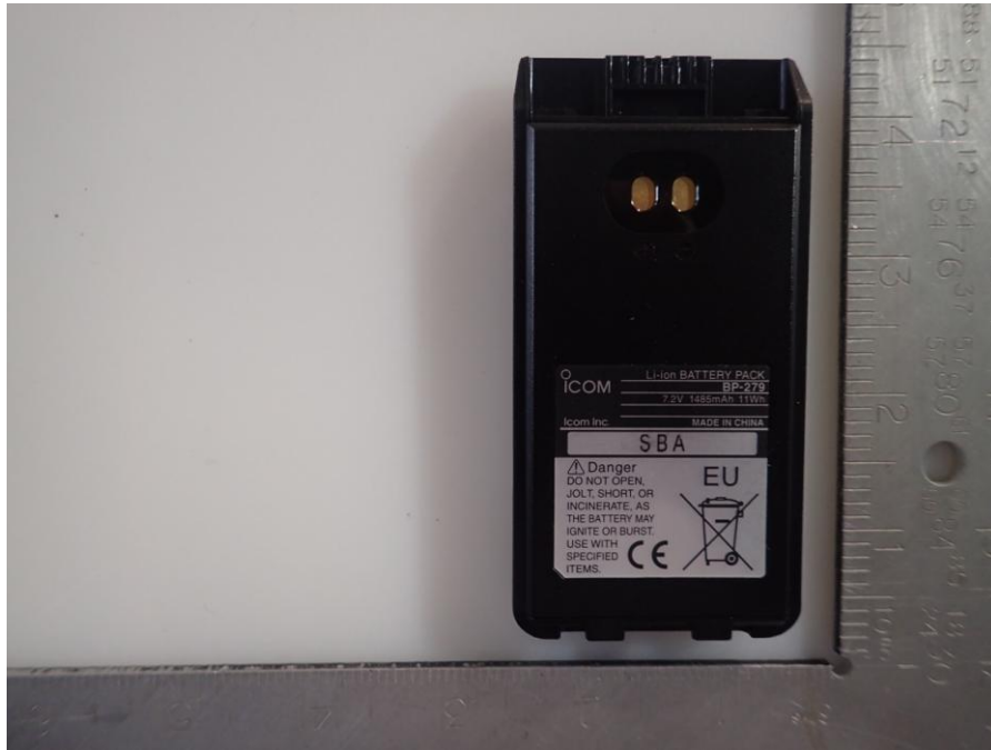
< Li-ion Battery >