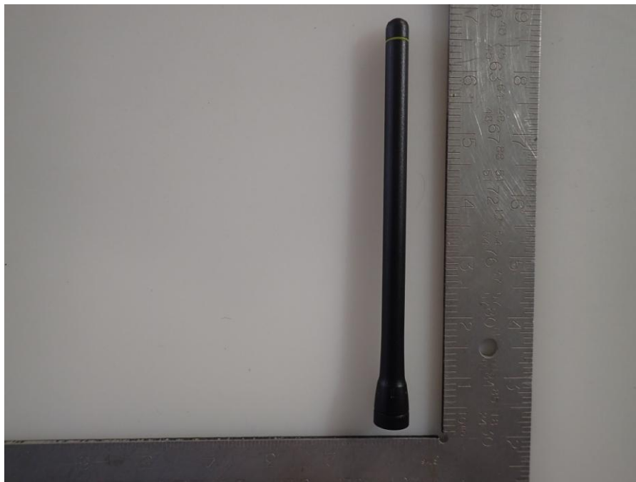
< FA-SC28V Antenna >