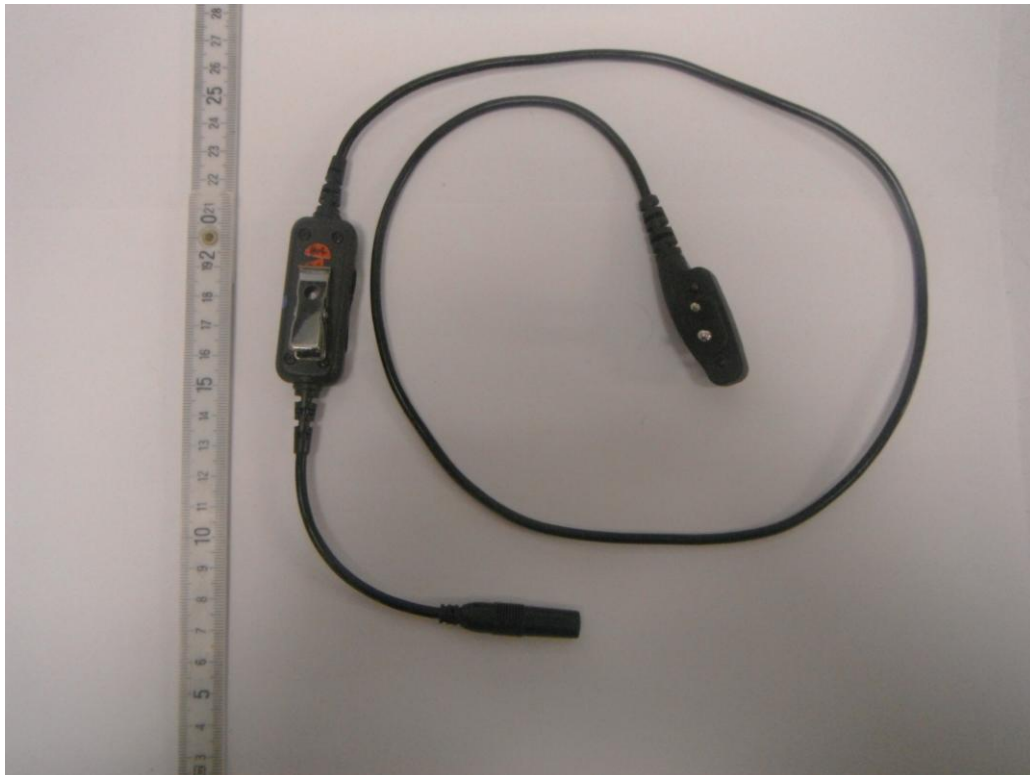
<VS-4LA PTT Switch Cable/OPC-2004LA Adapter Cable>