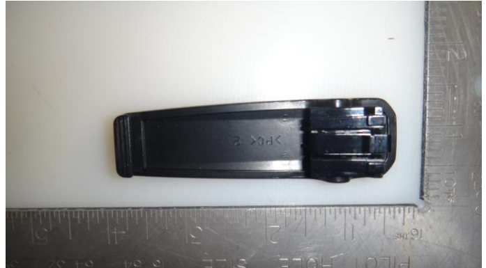
< MB-133 Belt-clip >