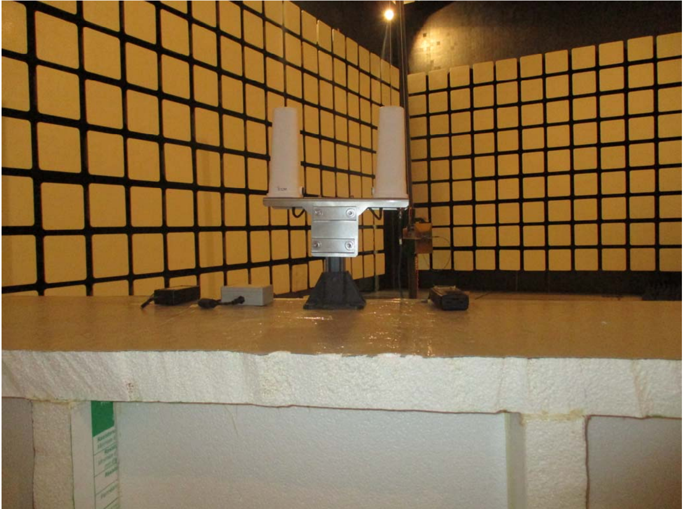
Radiated Emissions at 3 m, Above 1 GHz