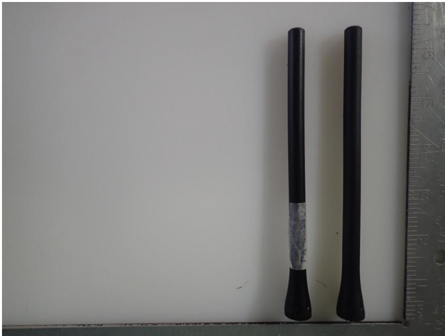
< FA-SC59V, SD-IC001 Antenna >