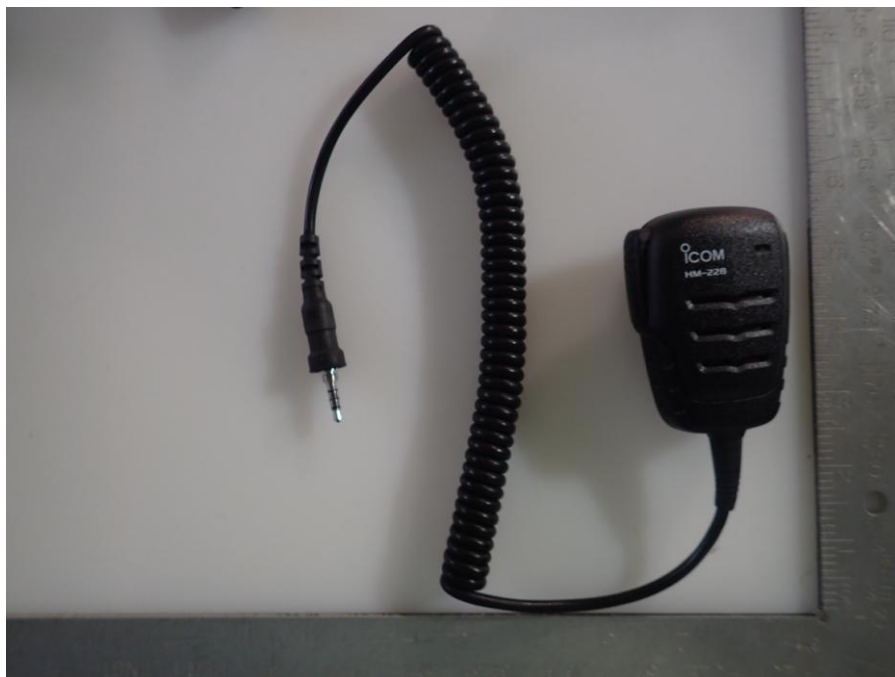
< HM-228 Speaker Microphone >