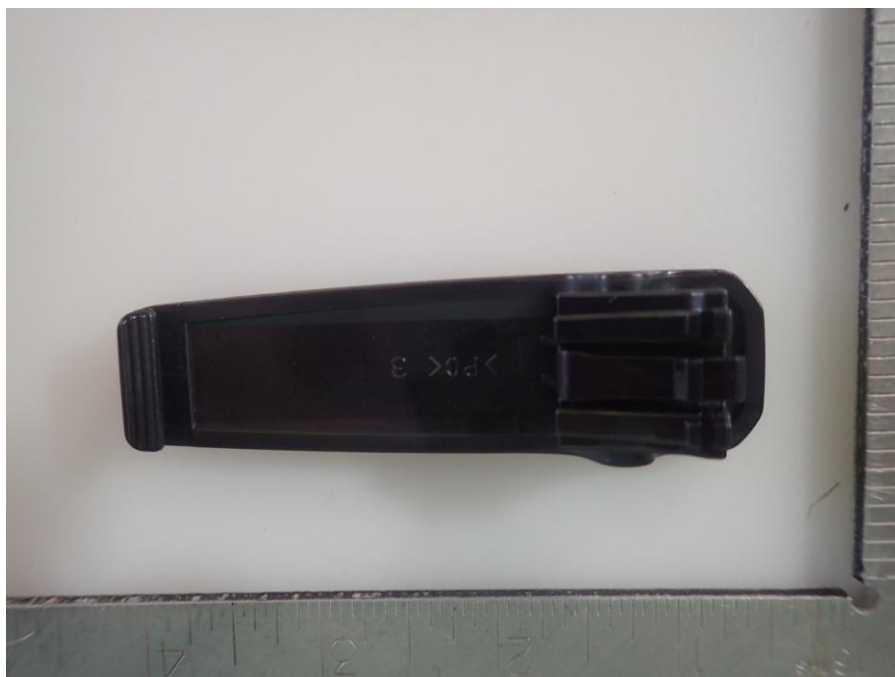
< MB-133 Belt-clip >