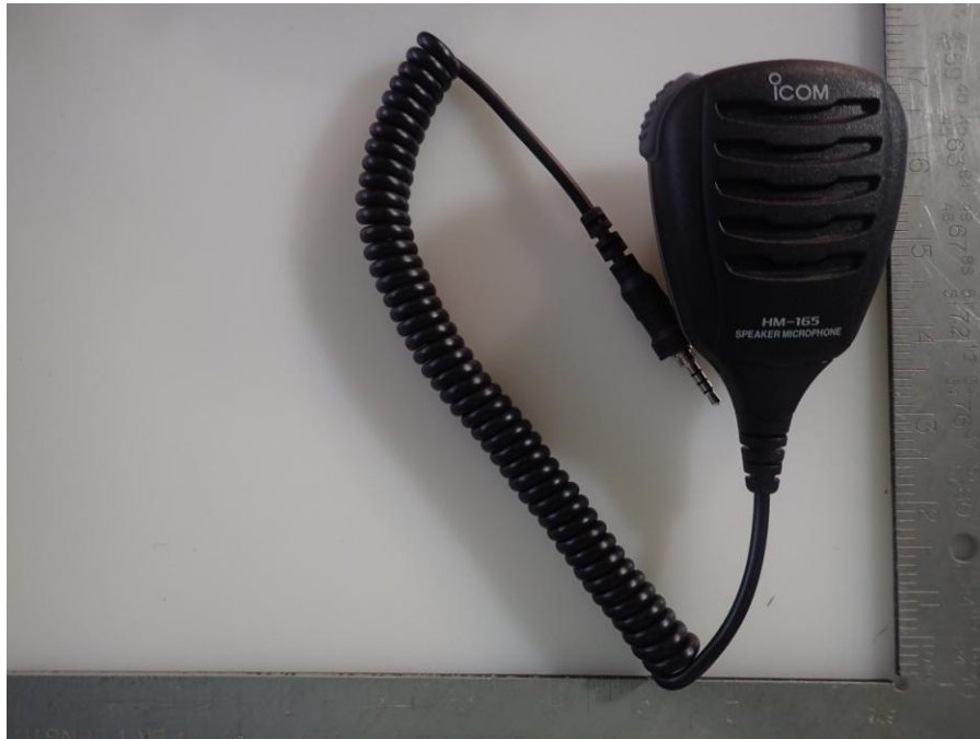
< HM-165 Speaker-Microphone >