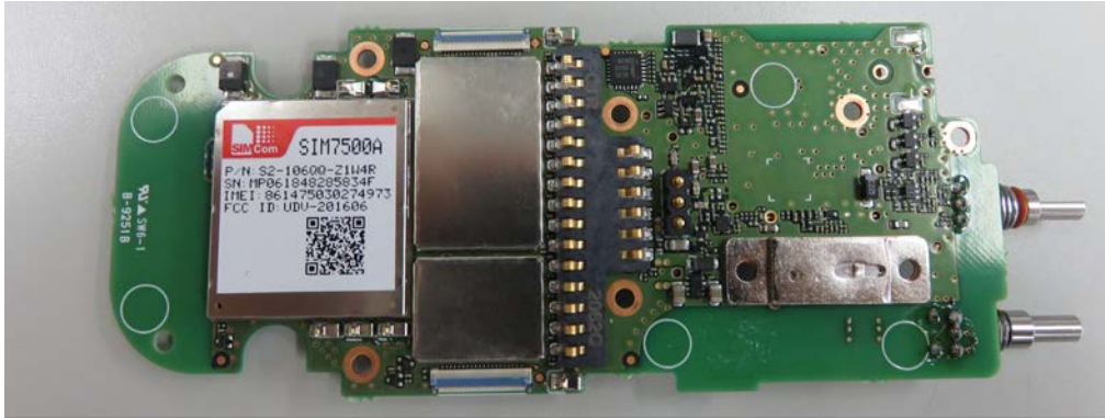
MAIN Board side-A view