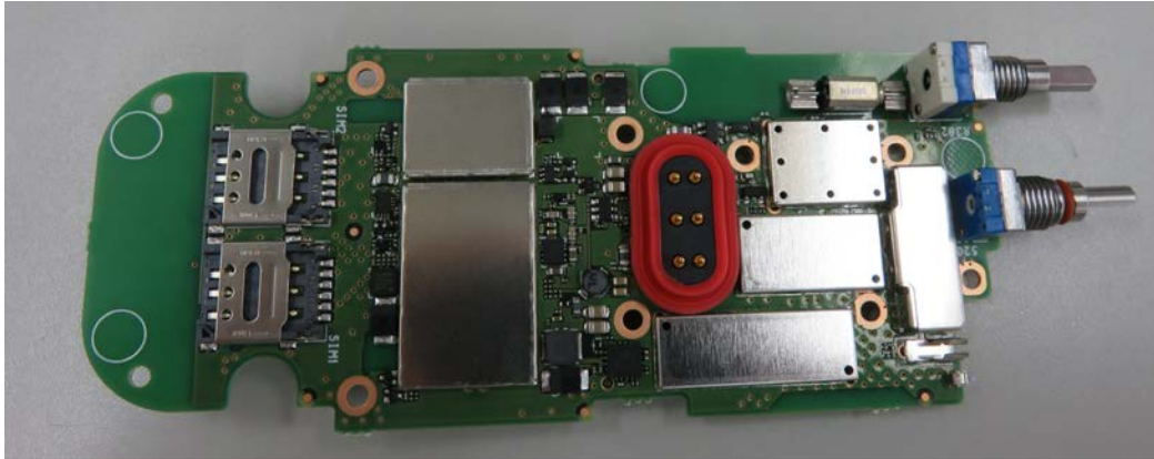
MAIN Board side-B view