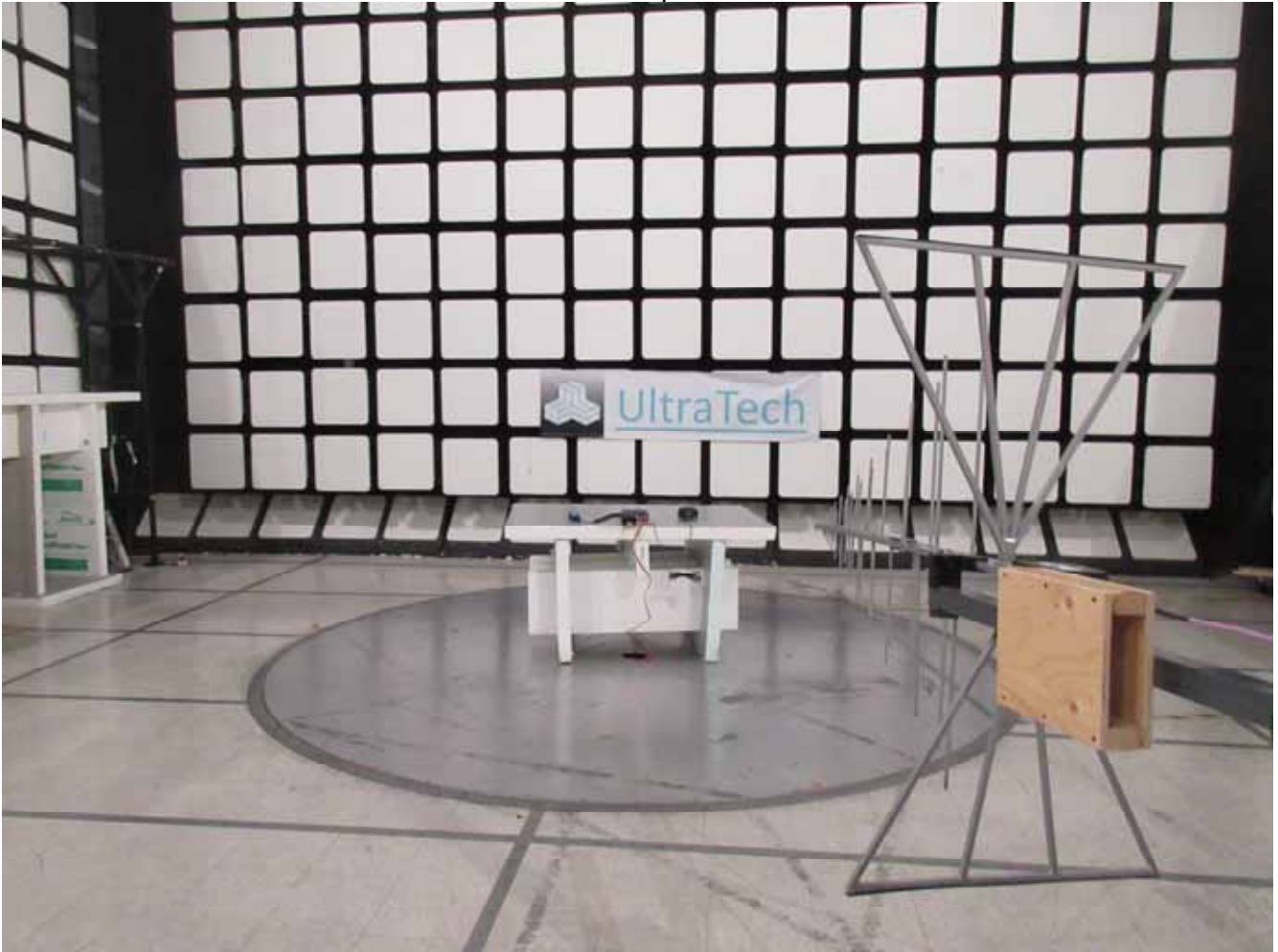
Tx Radiated Emission Test Setup