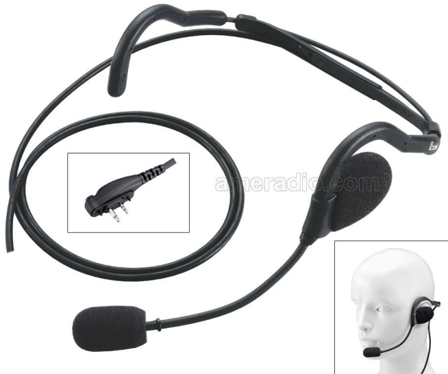
< HS-95LWP Headset >