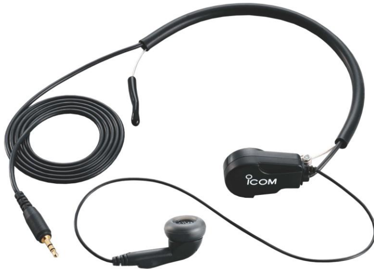
< HS-97 Headset >