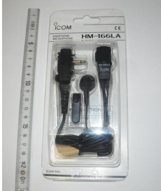
<HM-166LA Earphone Microphone>