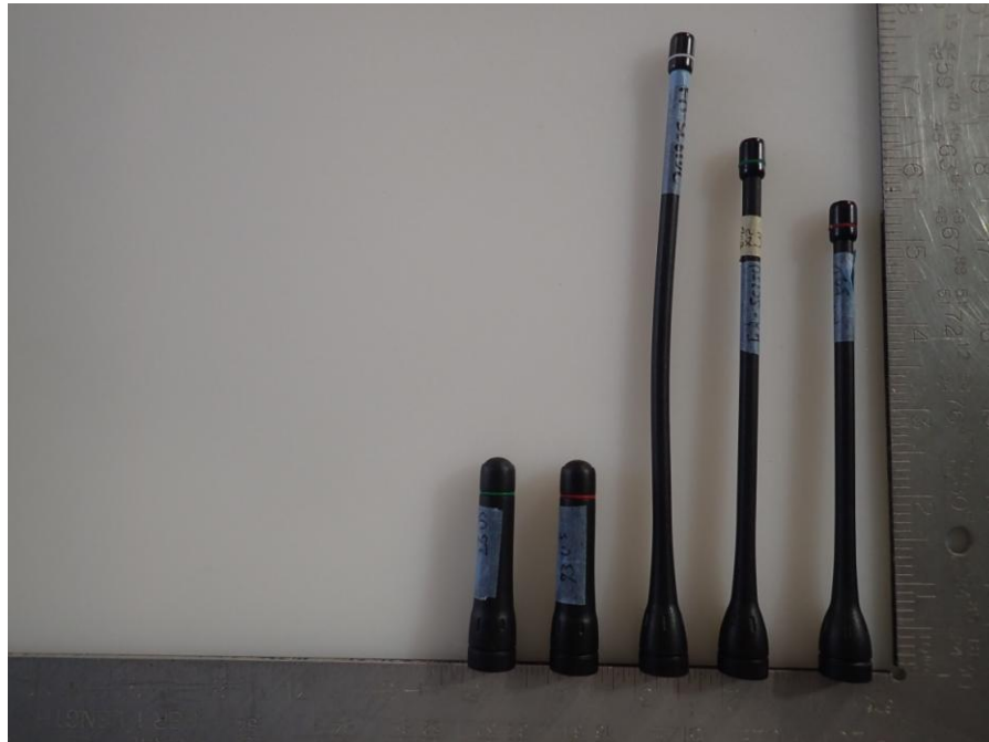
<FA-SC26US, FA-SC73US, FA-SC61UC, FA-SC25U, FA-SC57U Antenna>