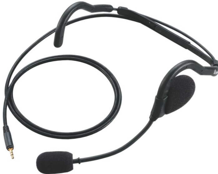
< HS-95 Headset >