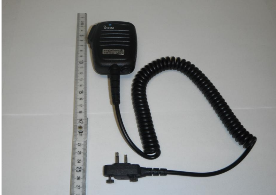
< HM-159LA Speaker Microphone >