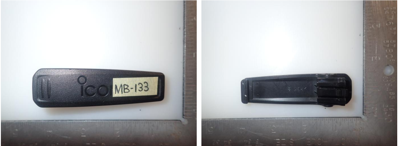
< MB-133 Belt-clip >