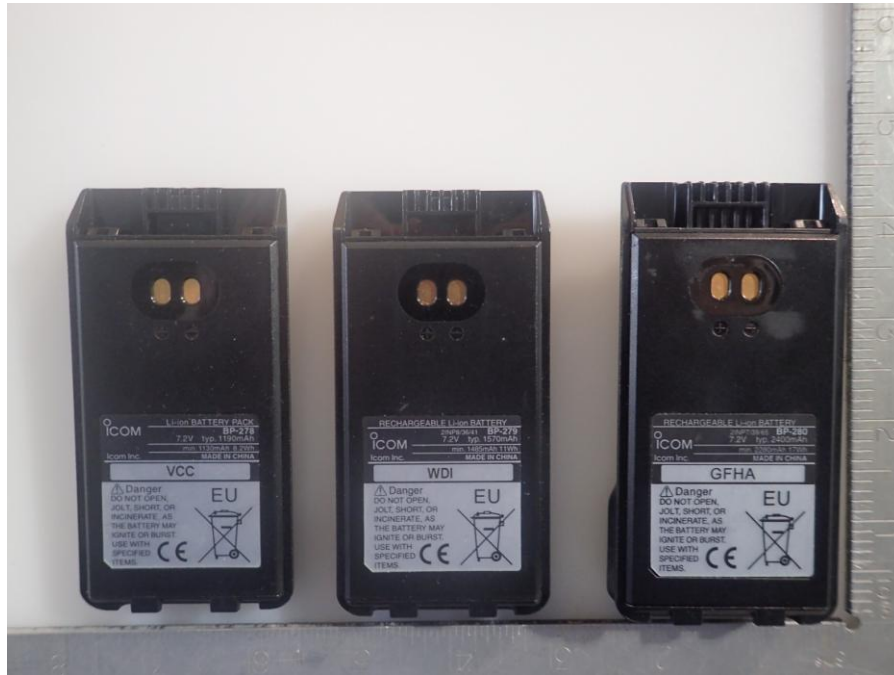
< Li-ion Batteries >