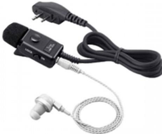
<HM-153LA Earphone Microphone>