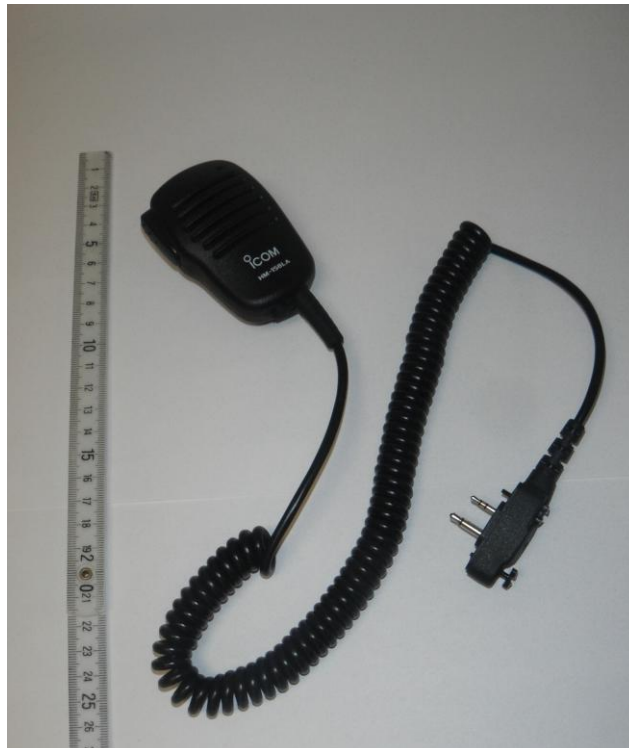
< HM-158LA Speaker-Microphone >