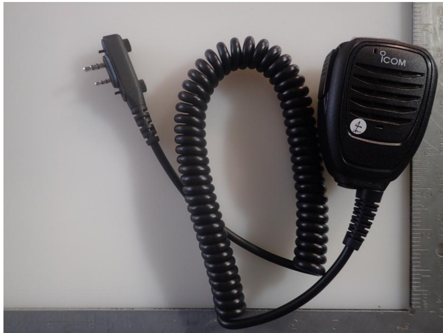
< HM-222HLWP Speaker-microphone >