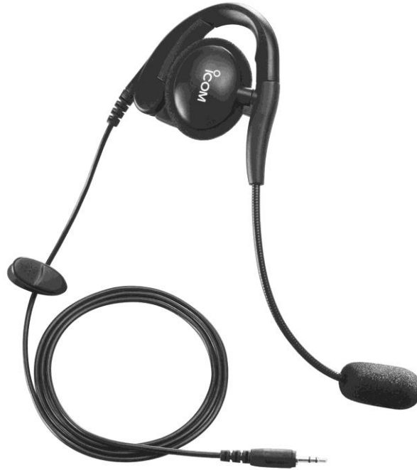
< HS-94 Headset >