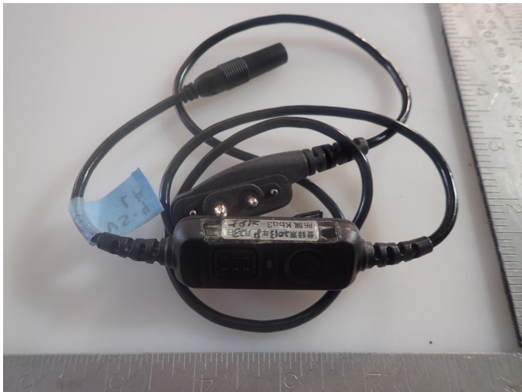
<VS-4LA PTT Switch Cable/OPC-2004LA Adapter Cable>