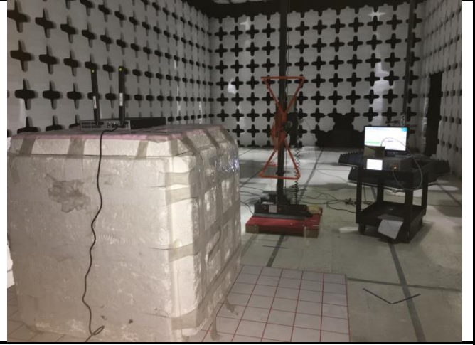
Radiated Emission Below 1G – Rear View