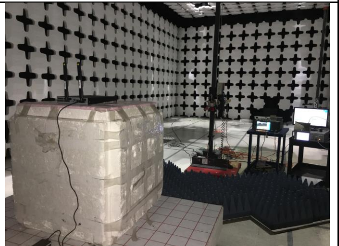
Radiated Emission Above 1G – Rear View