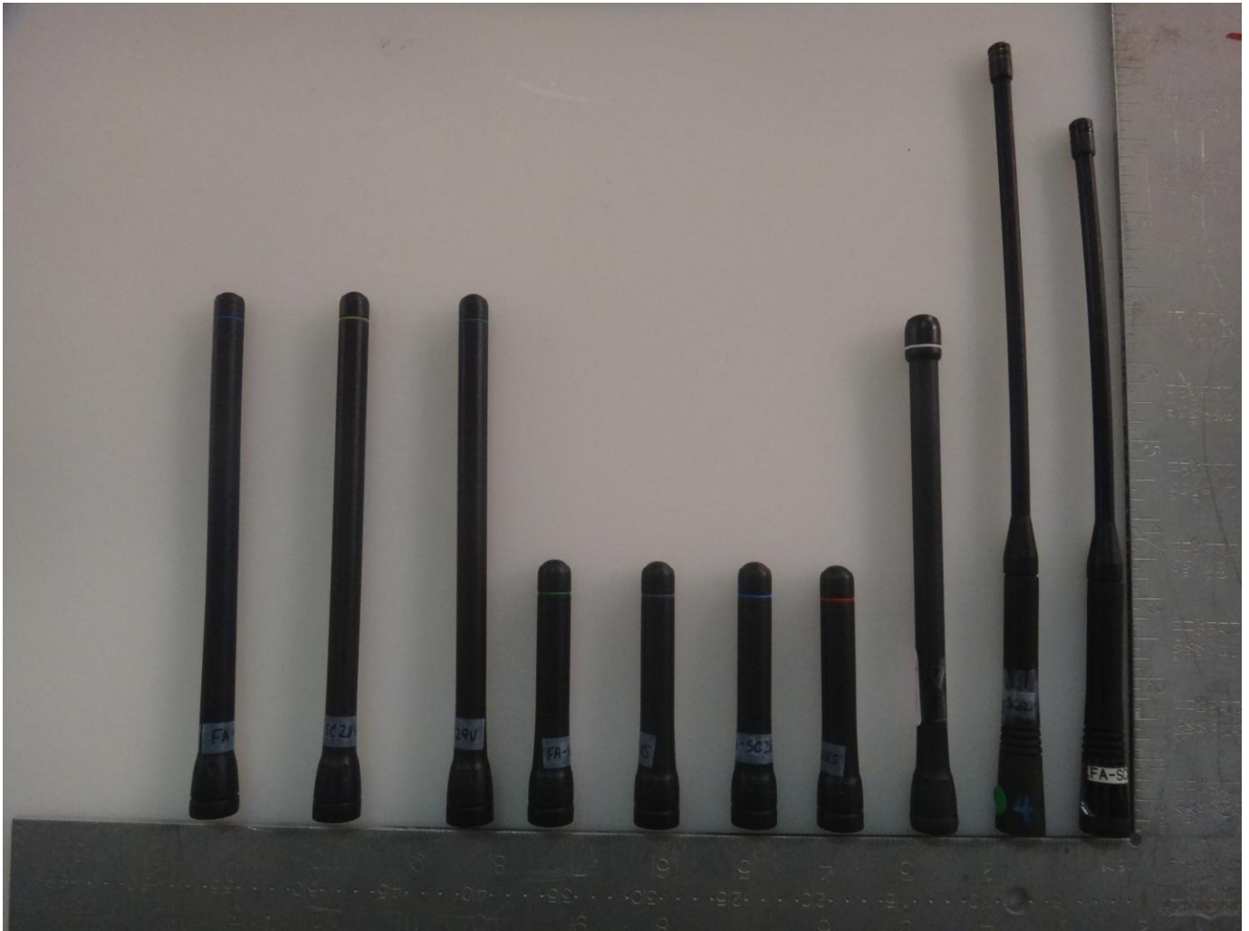
FA-SC25V, FA-SC28V, FA-SC29V, FA-SC62V, FA-SC63V FA-SC26VS, FA-SC27VS, FA-SC56VS, FA-SC57VS, FA-SC61VC Antenna