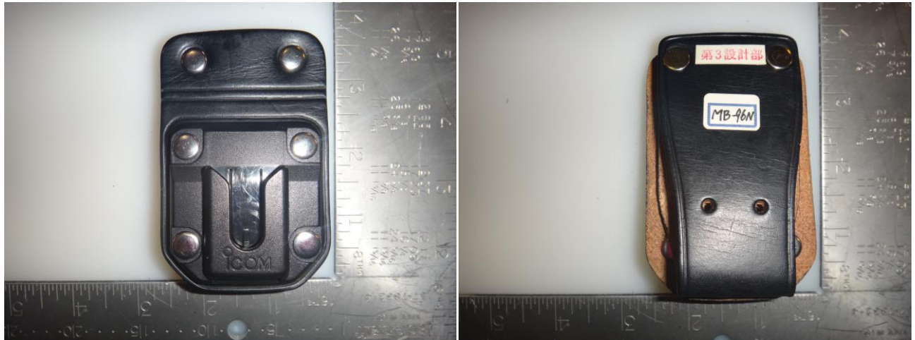
< MB-96N BELT-HANGER >