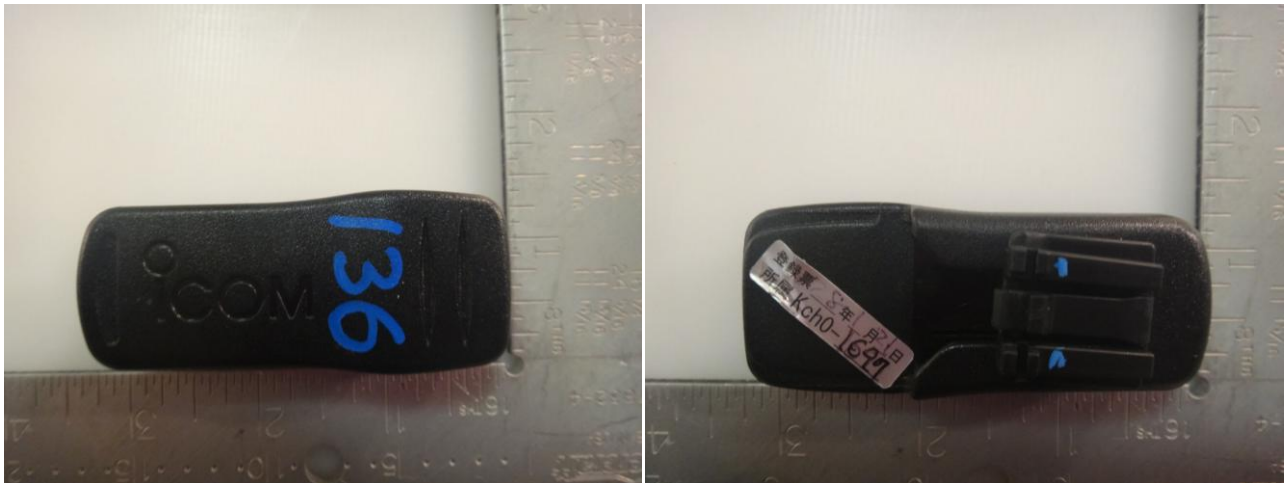
< MB-136 BELT-CLIP >