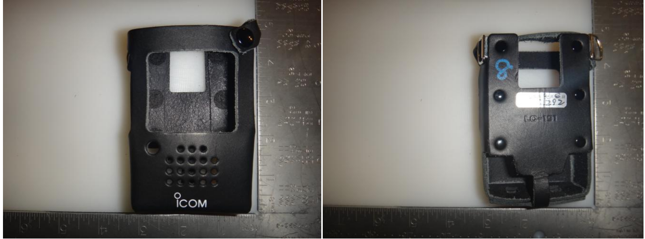
<LC-191 CARRYING CASE>