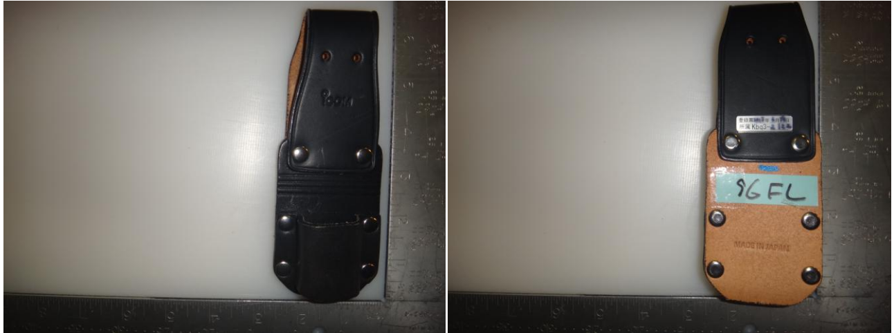
< MB-96FL BELT-HANGER >