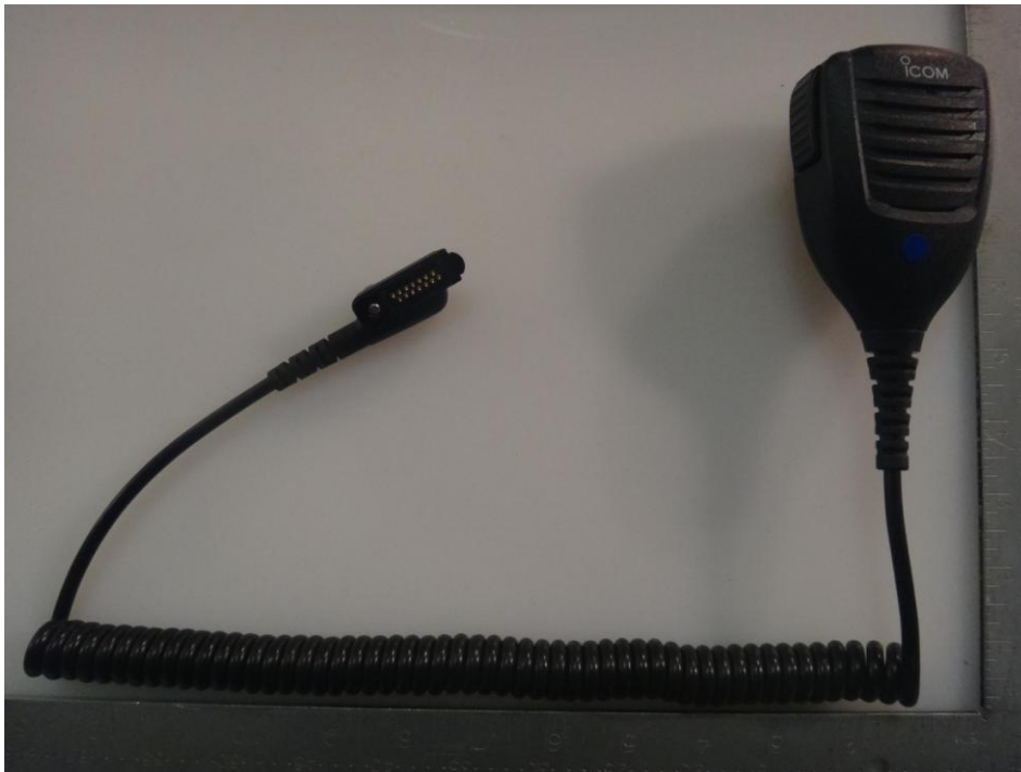
< HM-184UL Speaker-Microphone >