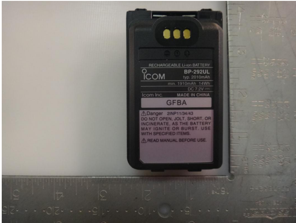
< Li-ion Batteries >