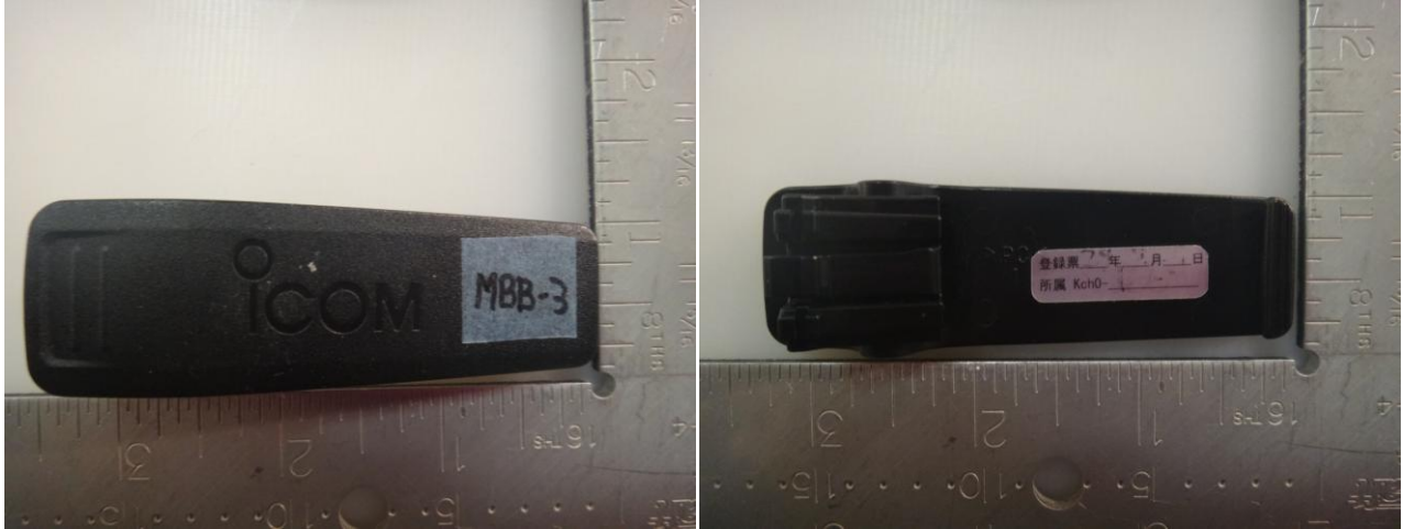
< MBB-3 Belt-clip >