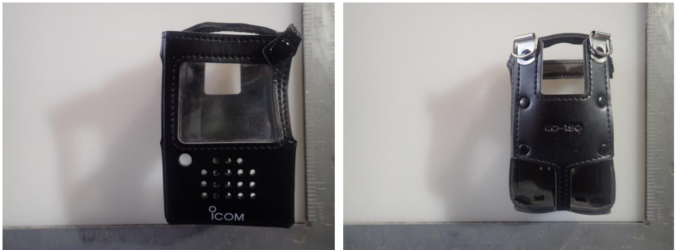
< LC-190 Leather case >