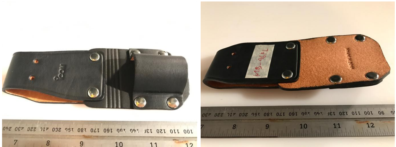
<MB-96FL Belt-hanger >