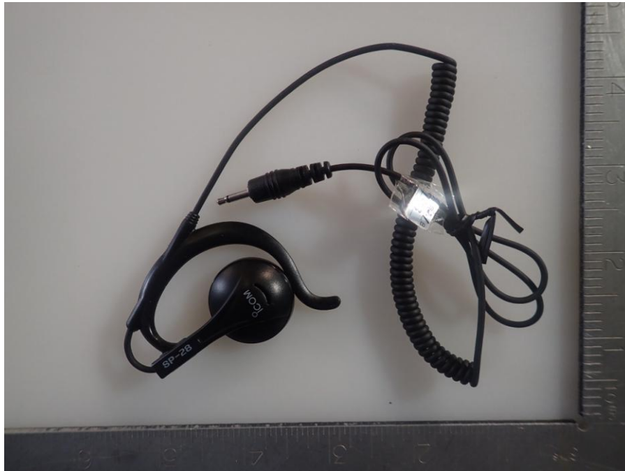
< SP-28 Ear Hook Type Earphone >