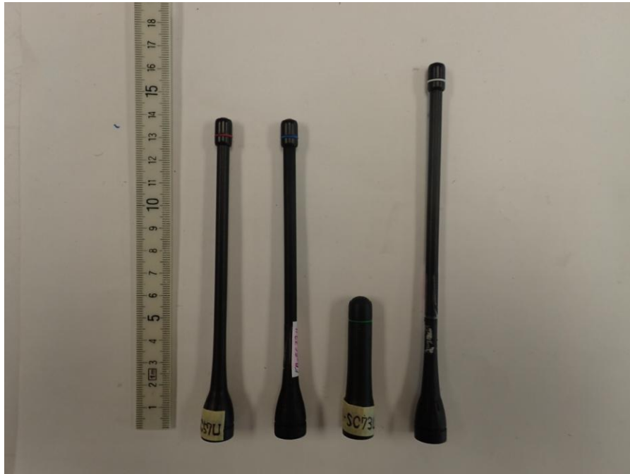
<FA-SC57U, FA-SC72U, FA-SC73US, FA-SC61UC Antenna >