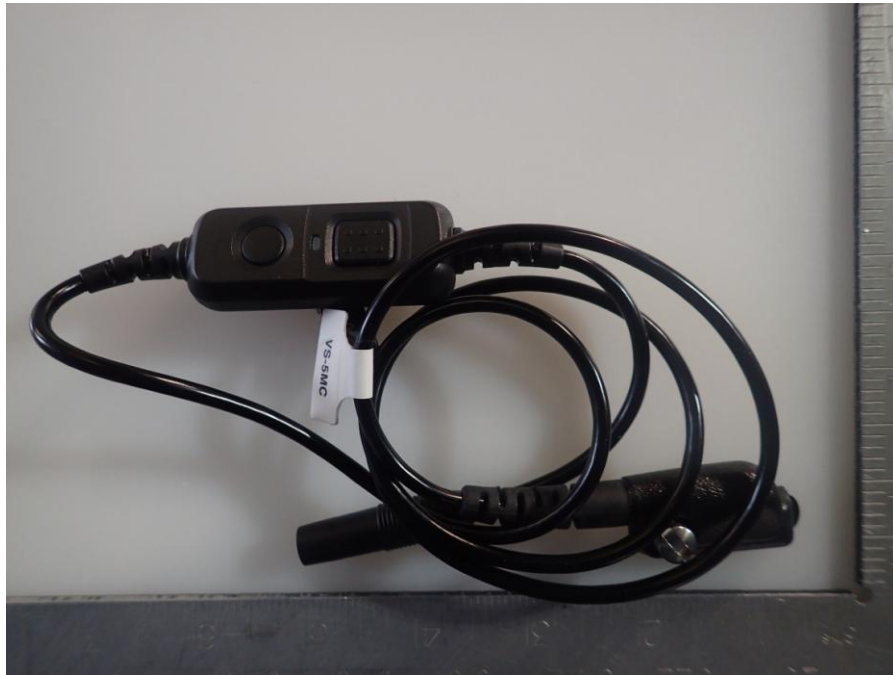
< VS-5MC PTT Switch Cable >