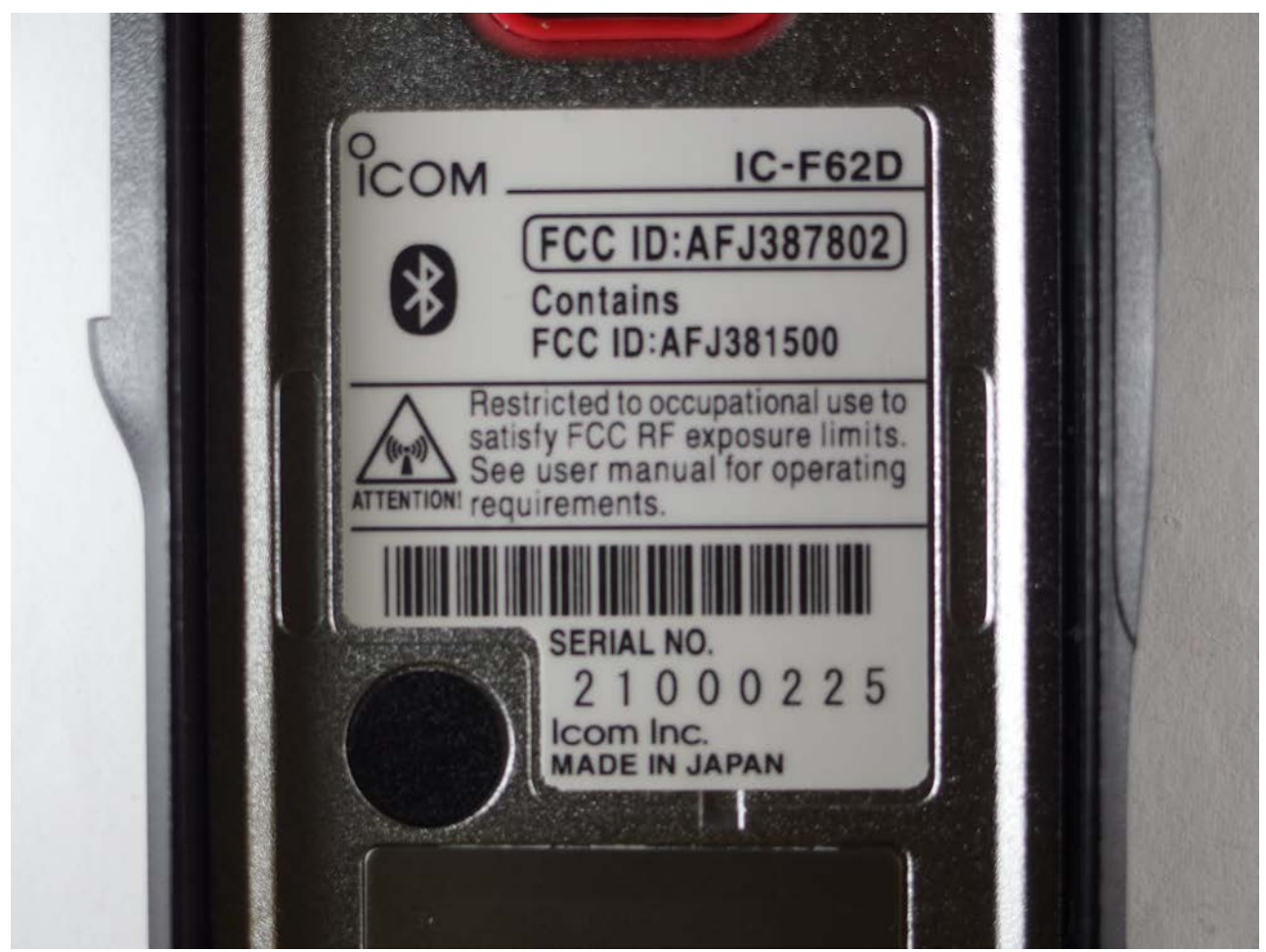
IC-F62D FCC SERIAL