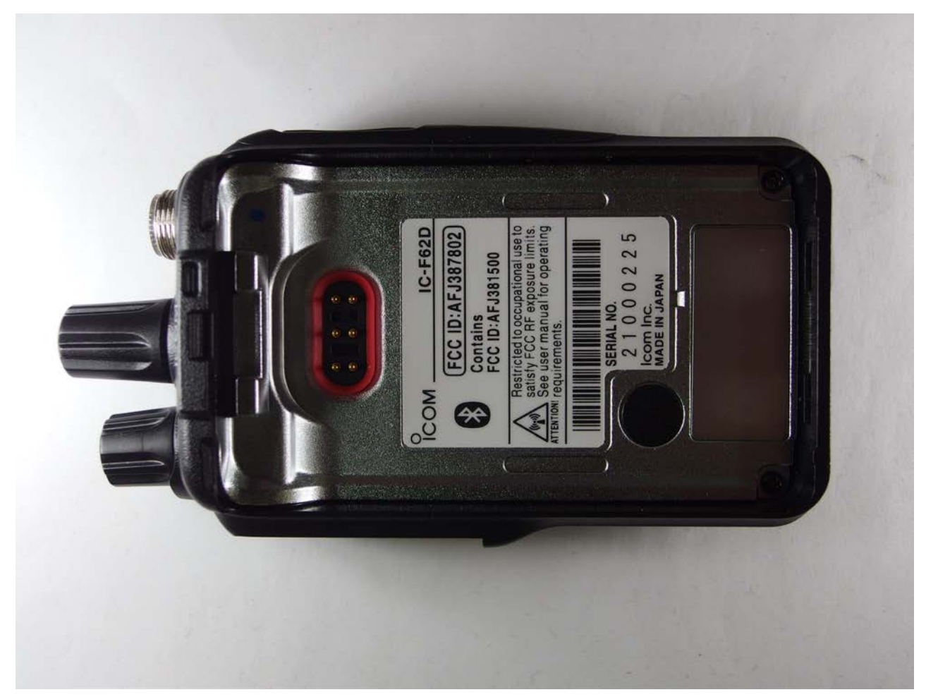
IC-F62D REAR SIDE (WITH OUT BP290:FCC SERIAL)