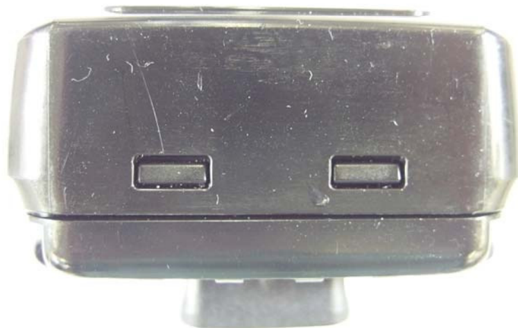
IC-F62D BOTTOM SIDE