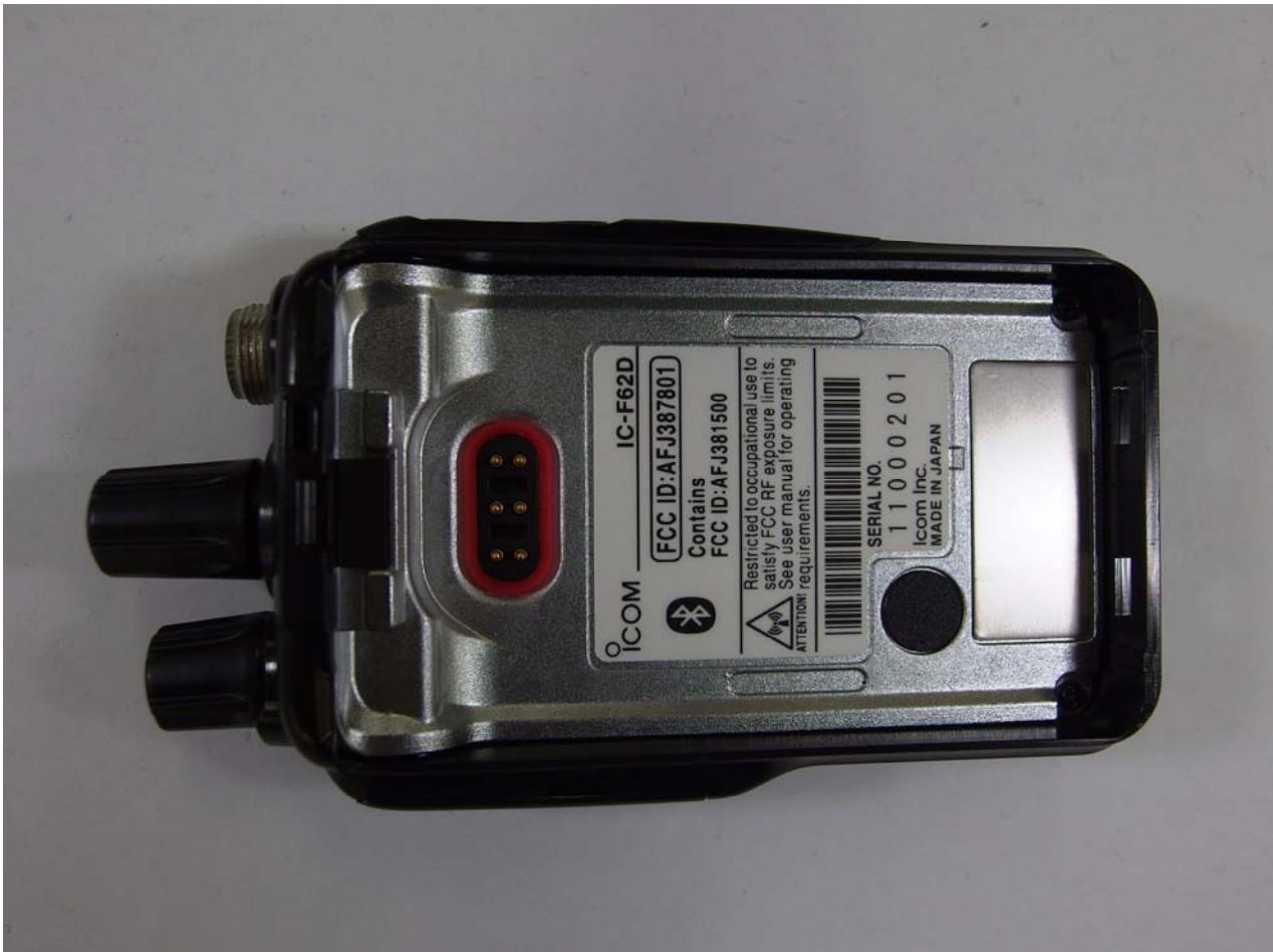
IC-F62D REAR SIDE (WITH OUT BP290:FCC SERIAL)