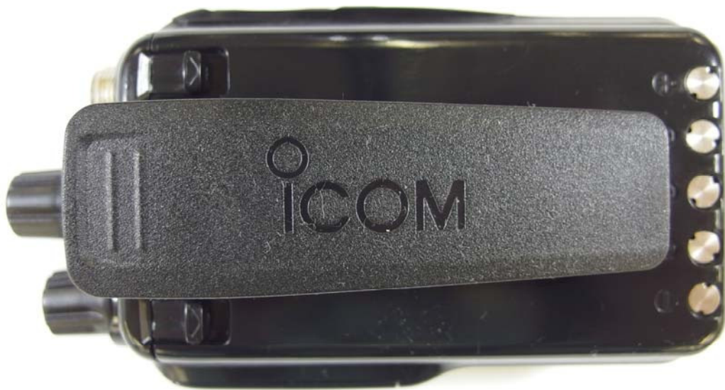
IC-F62D REAR SIDE