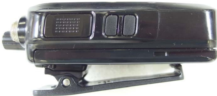
IC-F62D LEFT SIDE