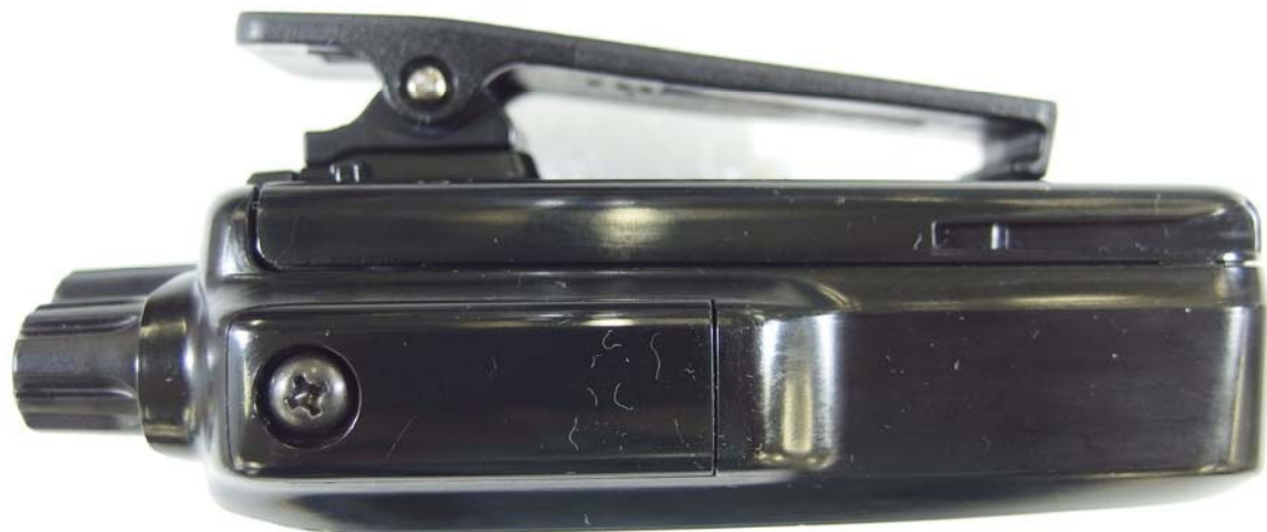
IC-F62D RIGHT SIDE