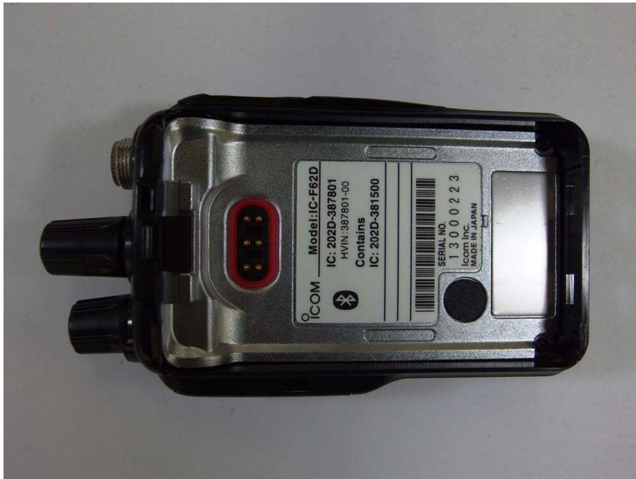
IC-F62D REAR SIDE (WITH OUT BP290:CANADA SERIAL)