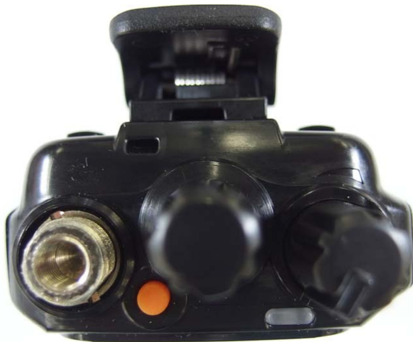
IC-F62D TOP SIDE