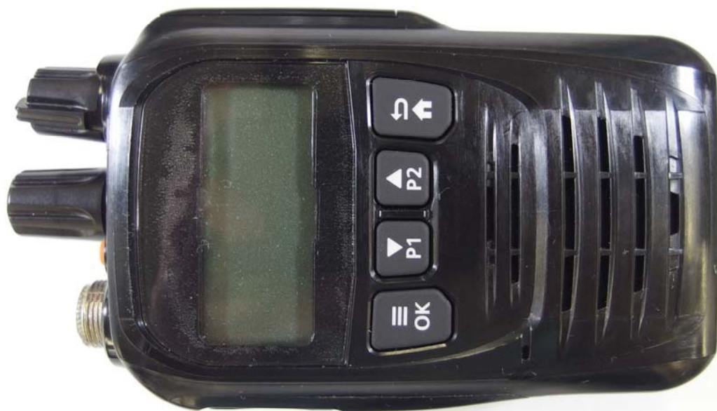
IC-F62D FRONT SIDE