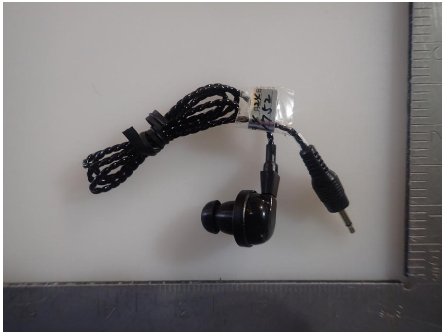
< EH-15B Earphone >