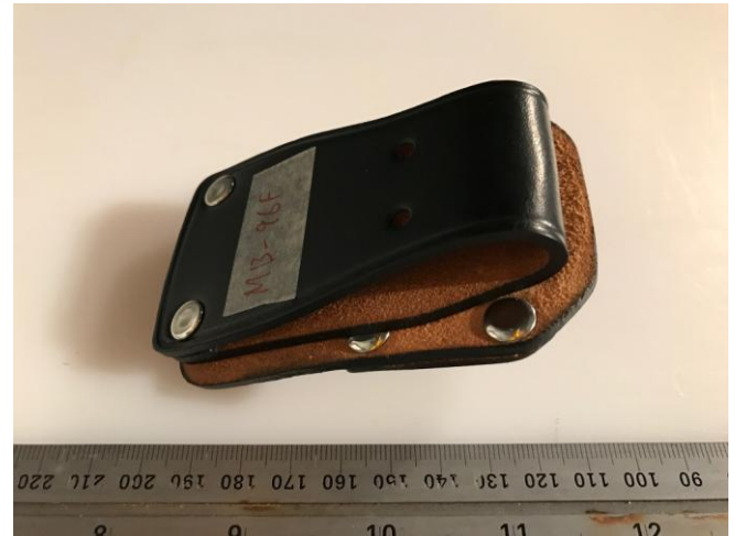
< MB-96F Belt-hanger >