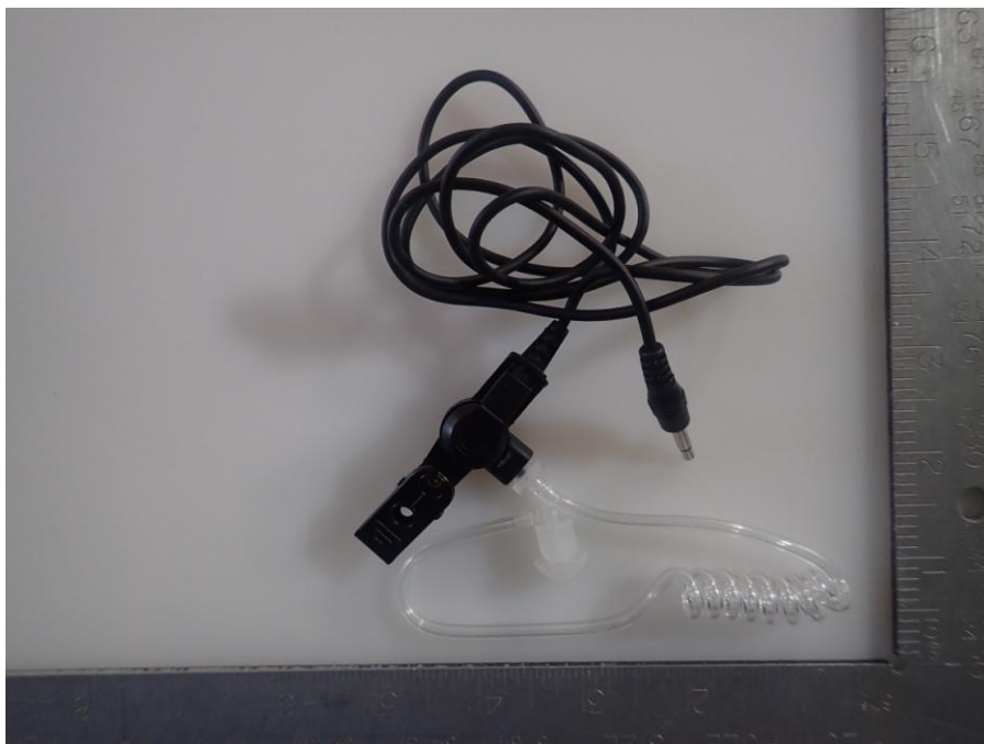
< SP-27 Tube Earphone >