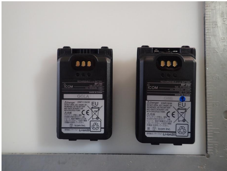
< Li-ion Batteries >