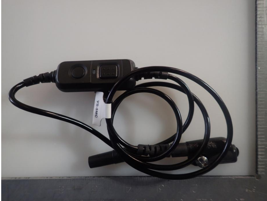
< VS-5MC PTT Switch Cable >