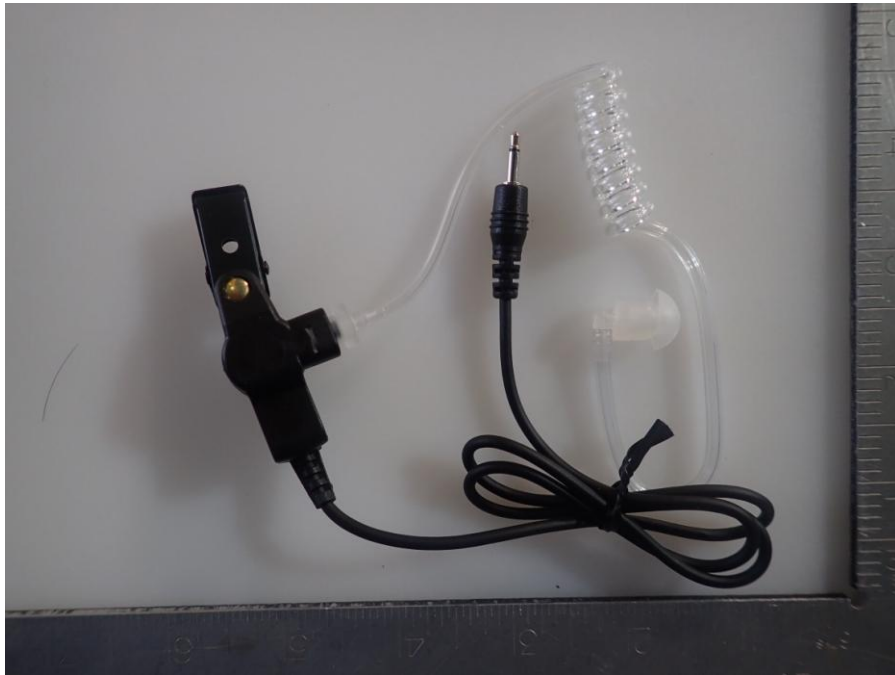
< SP-26 Tube Earphone >