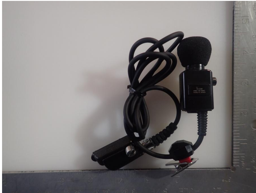
< HM-163MC Tiepin Type-Microphone >