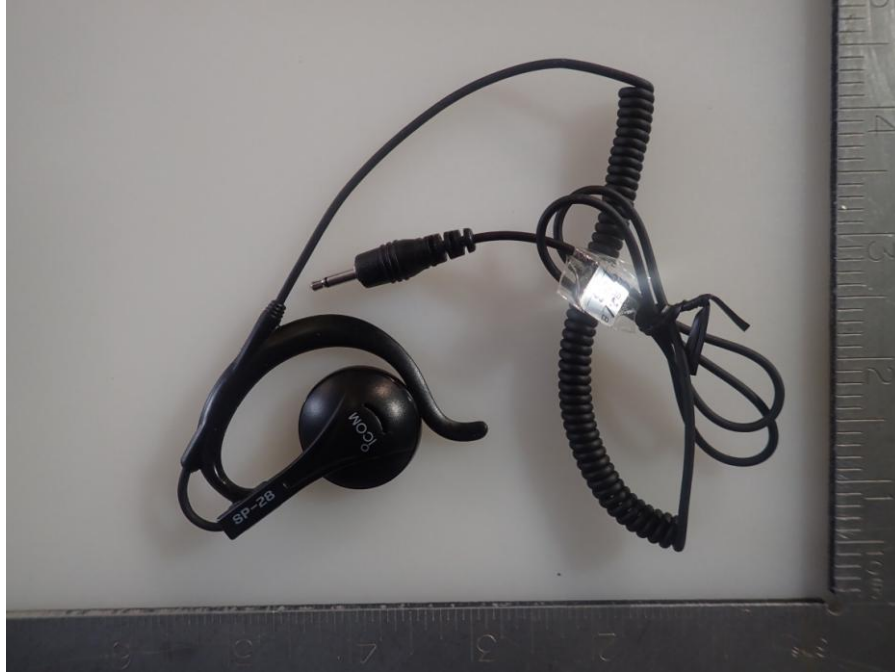
< SP-28 Ear Hook Type Earphone >