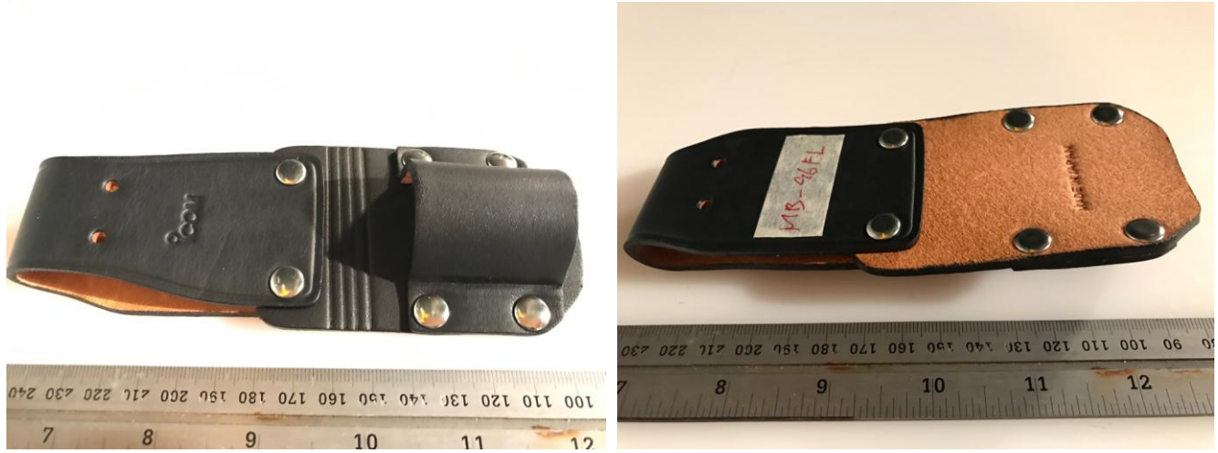
<MB-96FL Belt-hanger >