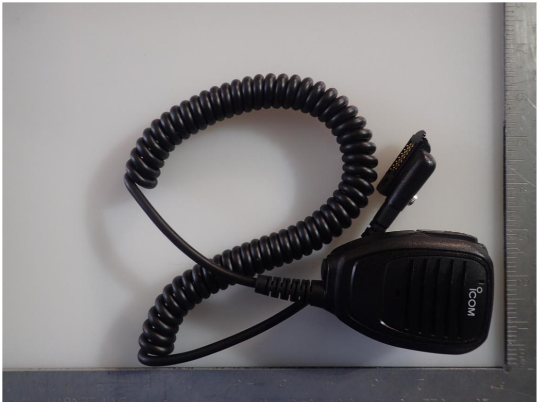
< HM-222 Speaker-Microphone >