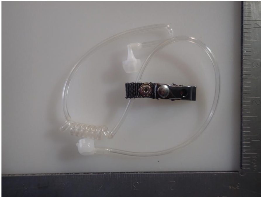
< SP-32 Tube Type Earphone Adapter >