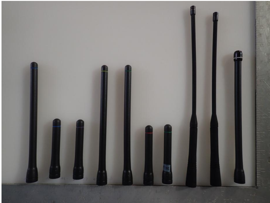
<FA-SC25V_FA-SC26VS_FASC27VS_FA-SC28V_FA-SC29V_FA-SC56VS_FA-SC57VS_FA-SC62V_FA-SC63V_FA-SC61VC Antenna >