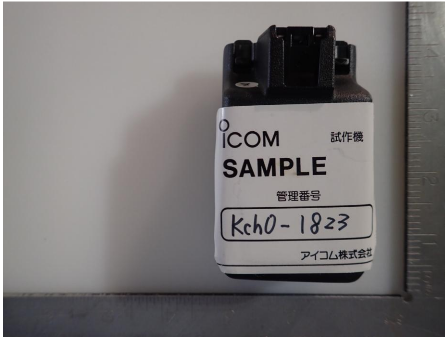
< Battery case BP-291 >