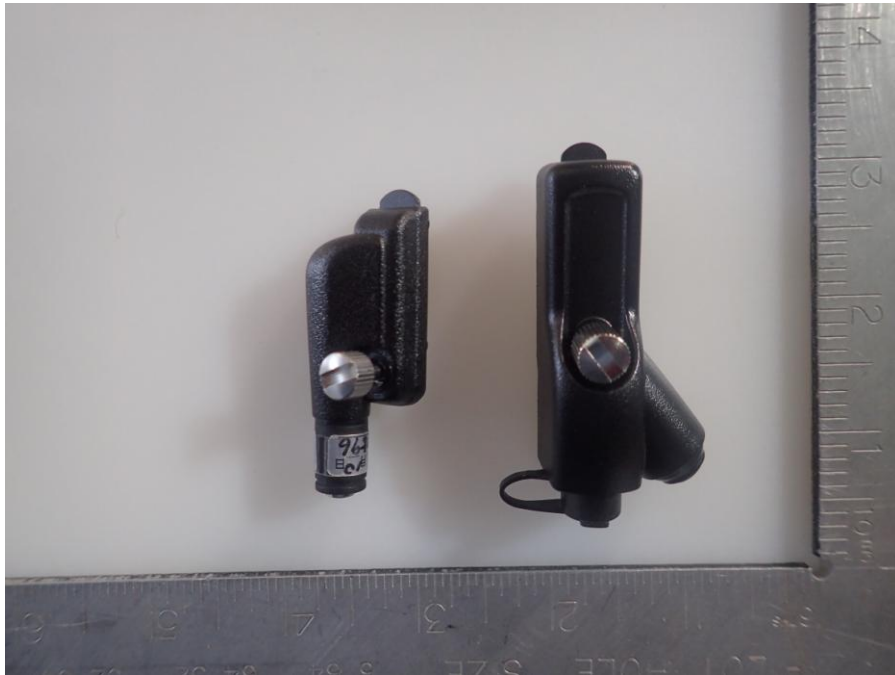
< AD-135 Earphone Adapter & AD-118 ACC Adapter >