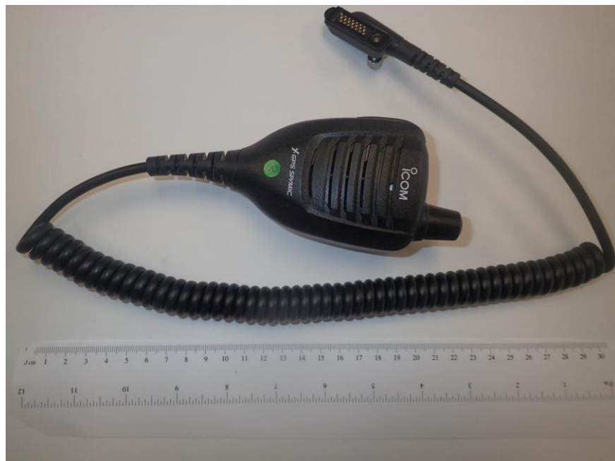
< HM-233GP GPS Speaker-Microphone >