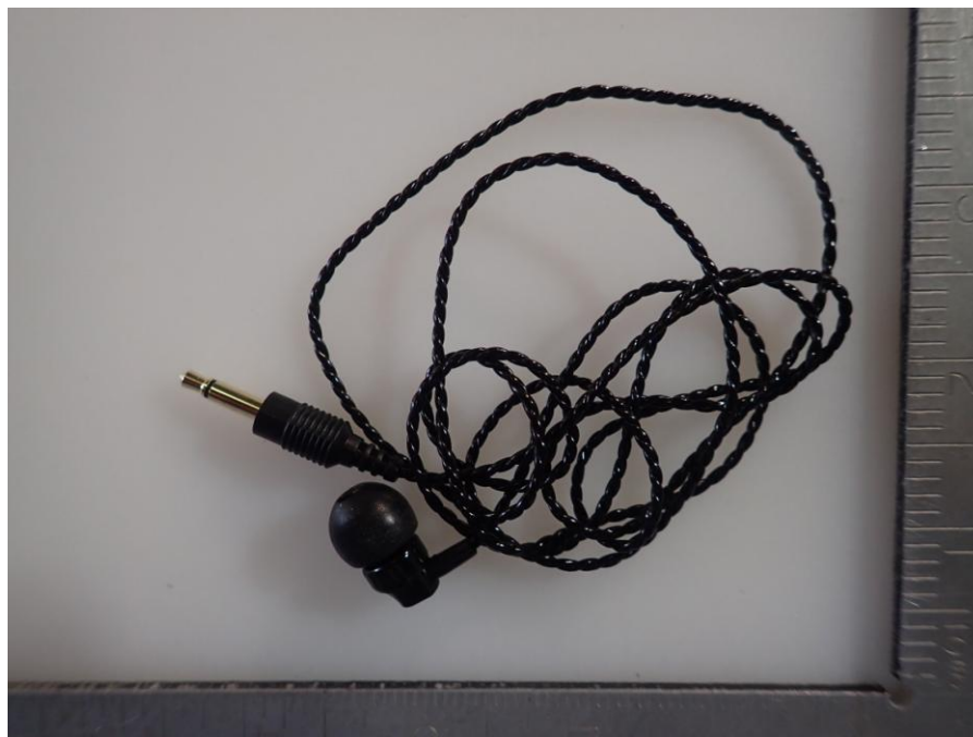
< SP-40 Earphone >