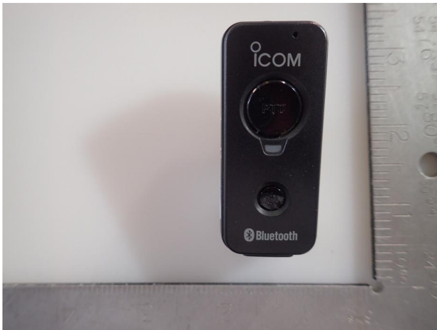
< VS-3 Bluetooth Headset >