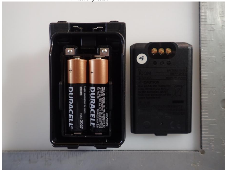
< Battery case BP-291 >