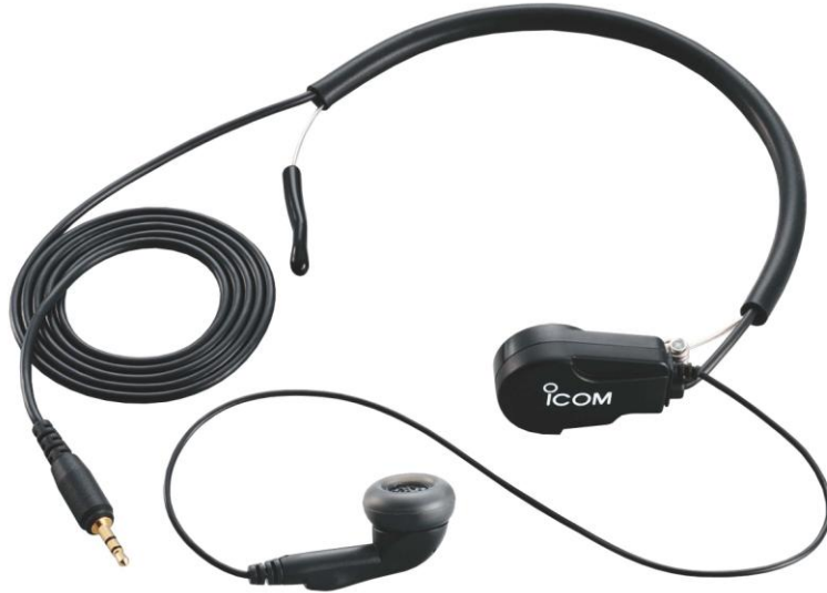
< HS-97 Headset >