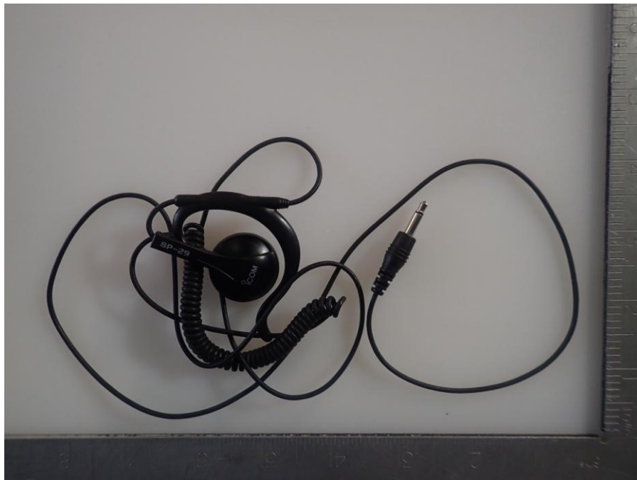
< SP-29 Ear Hook Type Earphone >