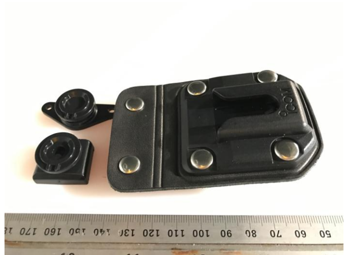
< MB-96N Belt-Hanger >