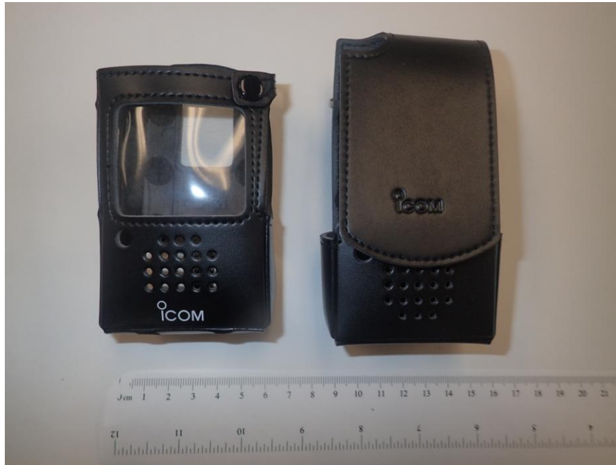
< LC-187 & LC-188 Leather case >