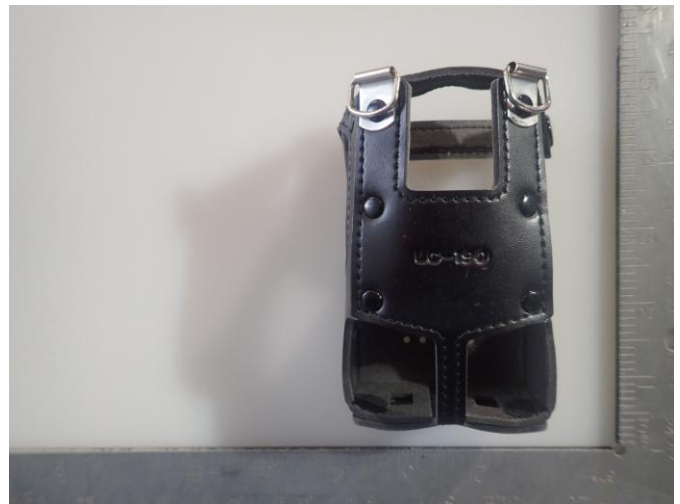
< LC-190 Leather case >