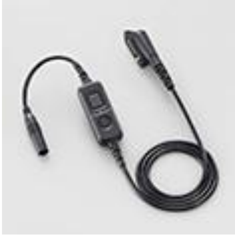
VS-4MC <PTT Switch Cable>