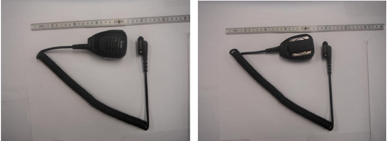
< HM-222 Speaker-Microphone >