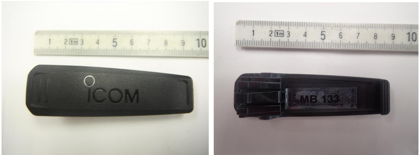
< MB-133 Belt-clip >