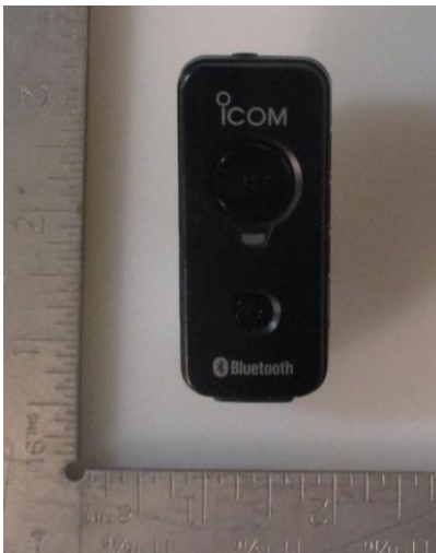
HS-95 <Bluetooth headset >