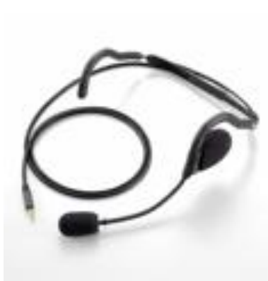
HS-95 < Headsets >