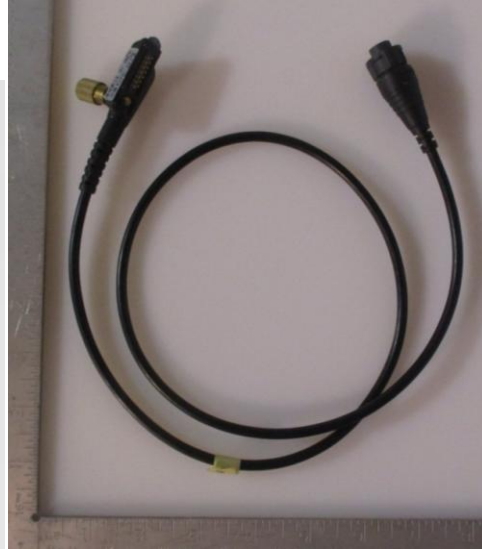
OPC-2362 <HH/Mob cable>