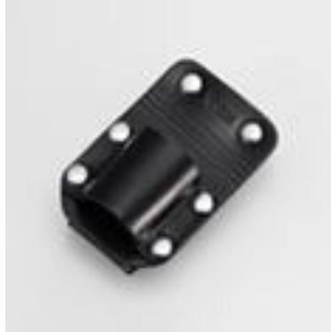
MB-96F < Leather Belt Hangers >