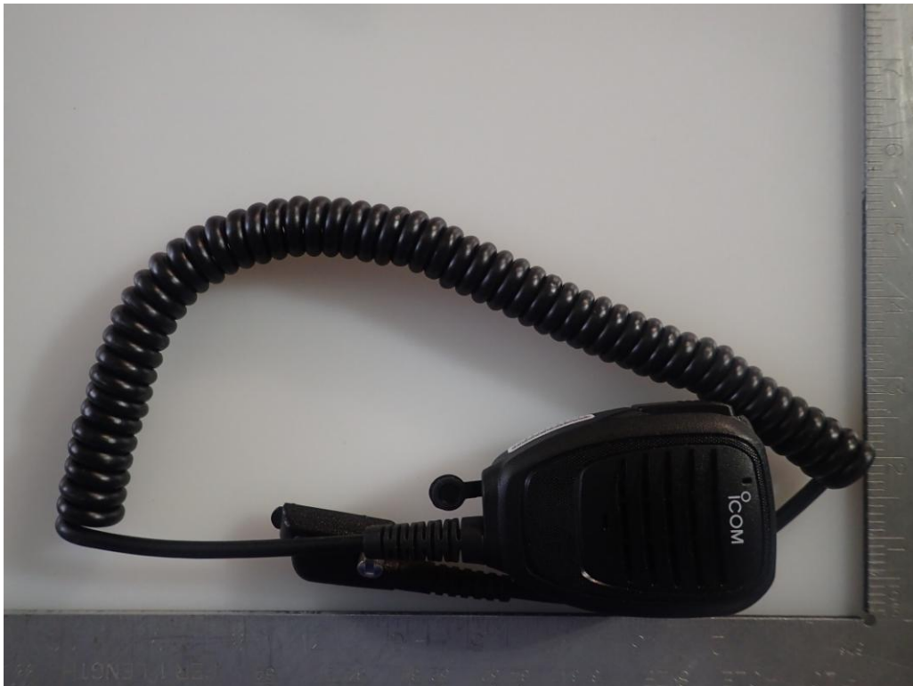
< HM-222H Speaker-Microphone >