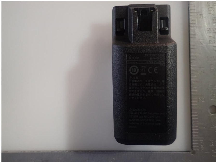
< Battery case BP-305 >