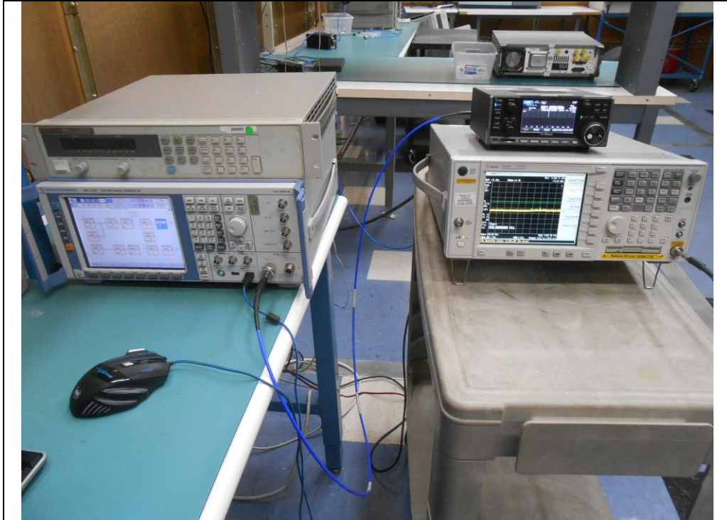
RF Conducted #2