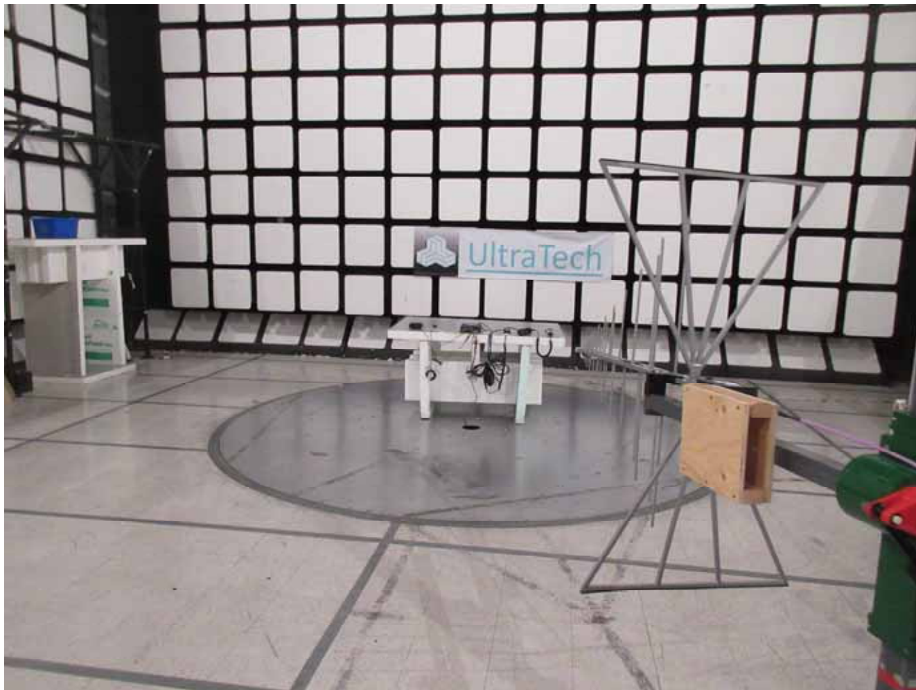
Tx Radiated Emission Test Setup

ICOM Incorporated UHF Digital Transceiver, M/N: IC-F6400D/DS FCC ID: AFJ376901, IC: 202D-376901