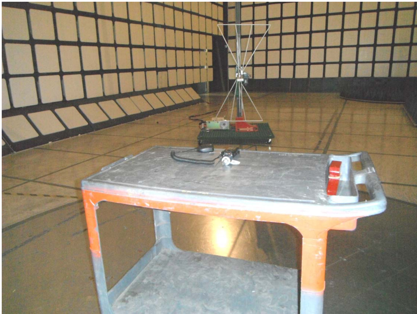
Plot #4: Tx Radiated Emission Test Setup

ICOM Incorporated UHF Transceiver, M/N: IC-F4400DT/DS/D(L) FCC ID: AFJ376702