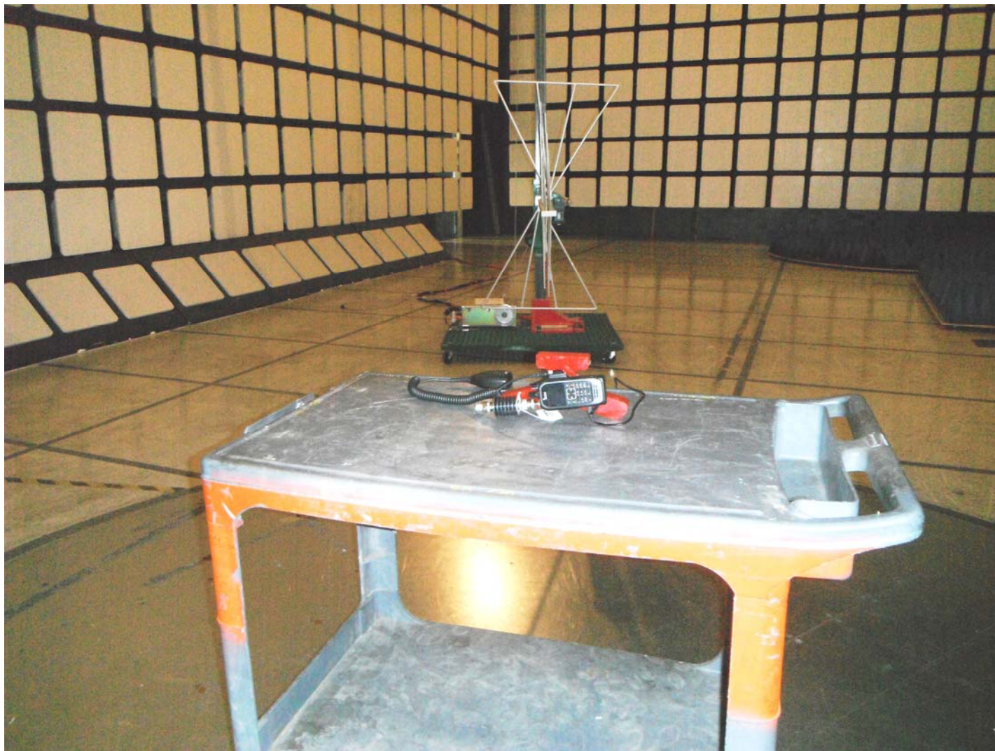
Plot #2: Tx Radiated Emission Test Setup

ICOM Incorporated UHF Transceiver, M/N: IC-F4400DT/DS/D(L) FCC ID: AFJ376702