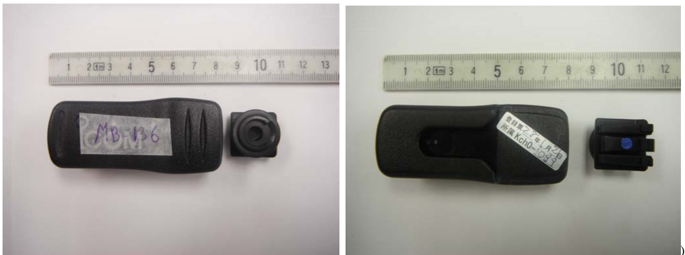
< MB-136 Belt-clip >