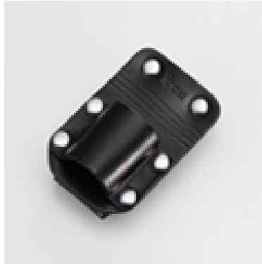
MB-96F < Leather Belt Hangers >