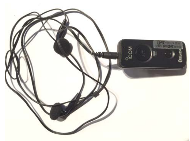
< VS-3 Blue Tooth Headset >