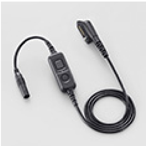
VS-4MC <Switch Adapter for Headsets>