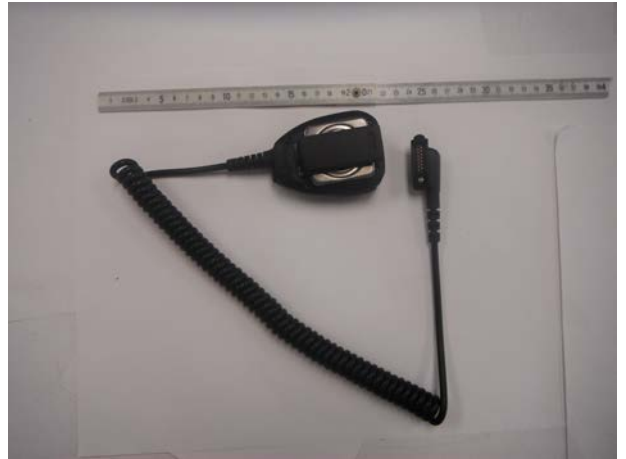
< HM-222 Speaker-Microphone >