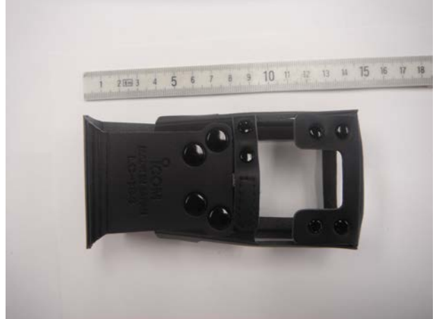
< LC-184 Leather case >