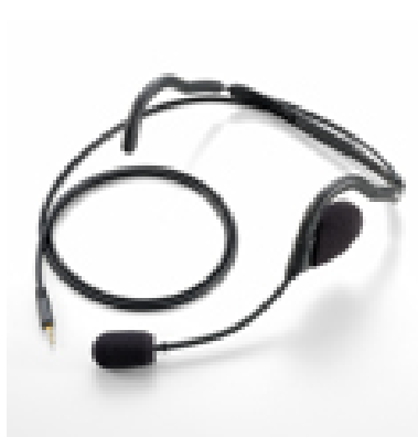
HS-95 < Headsets >