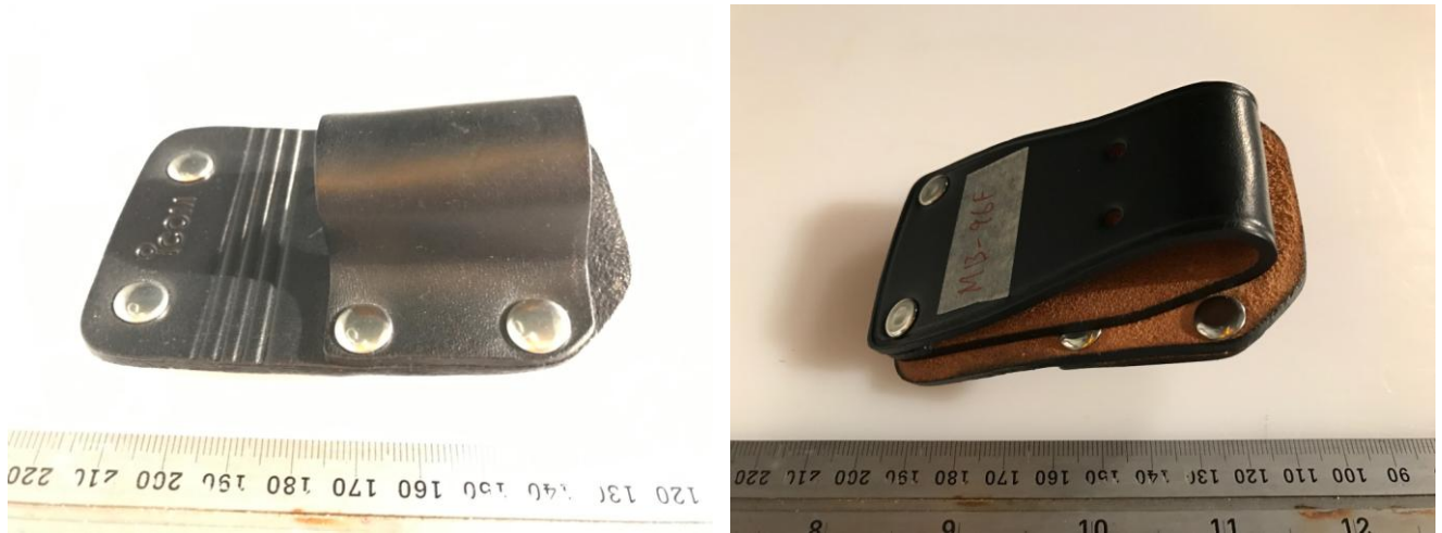
< MB-96F Belt-hanger >