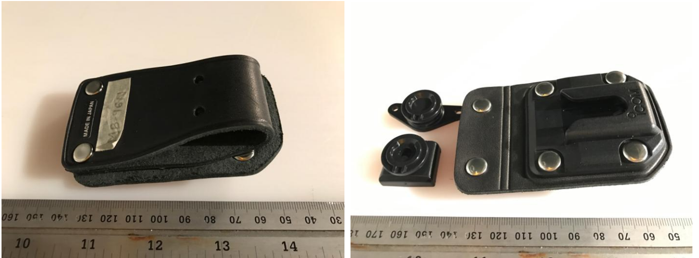
< MB-96N Belt-Hanger >