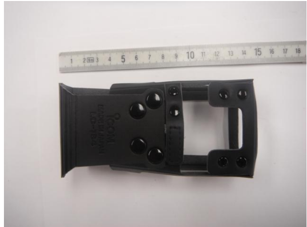
< LC-184 Leather case >