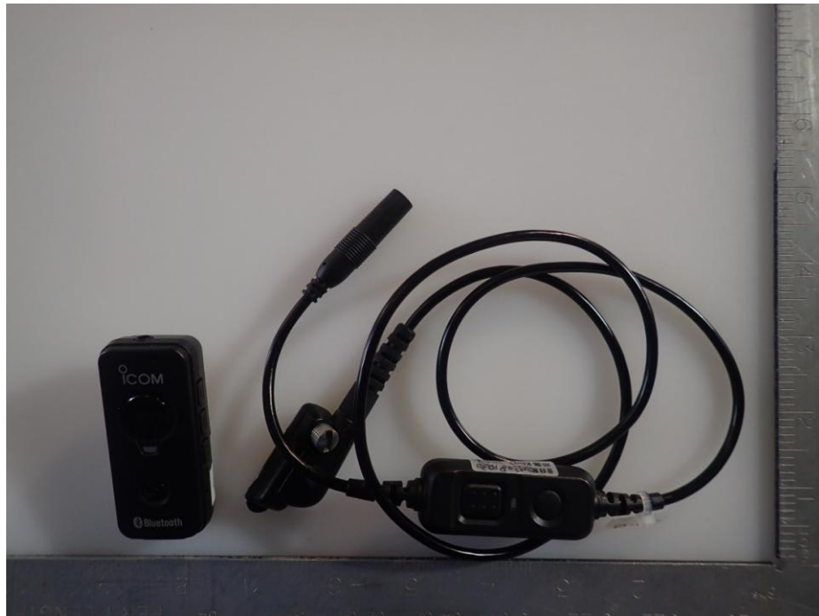
<VS-3 Bluetooth Headset & VS-4MC PTT Switch Cable>