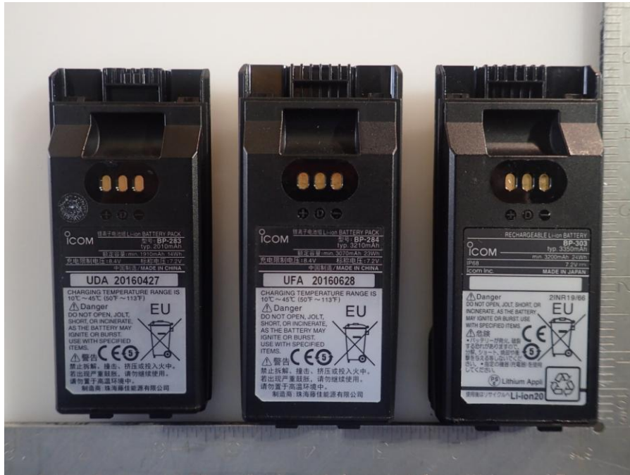
< Li-ion Batteries >