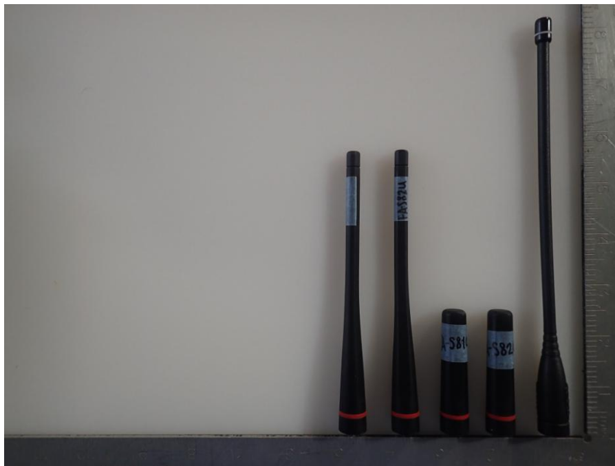
<FA-S81U, FA-S82U, FA-S81US, FA-S82US, FA-S76UC Antenna>