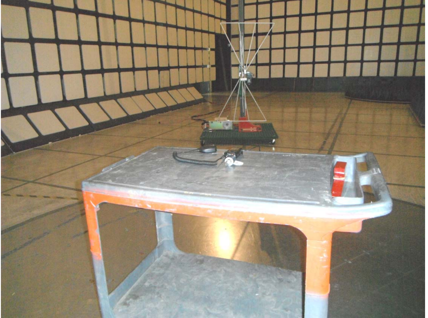
Plot #4: Tx Radiated Emission Test Setup

ICOM Incorporated UHF Transceiver, M/N: IC-F4400DT FCC ID: AFJ376701, IC: 202D-376701