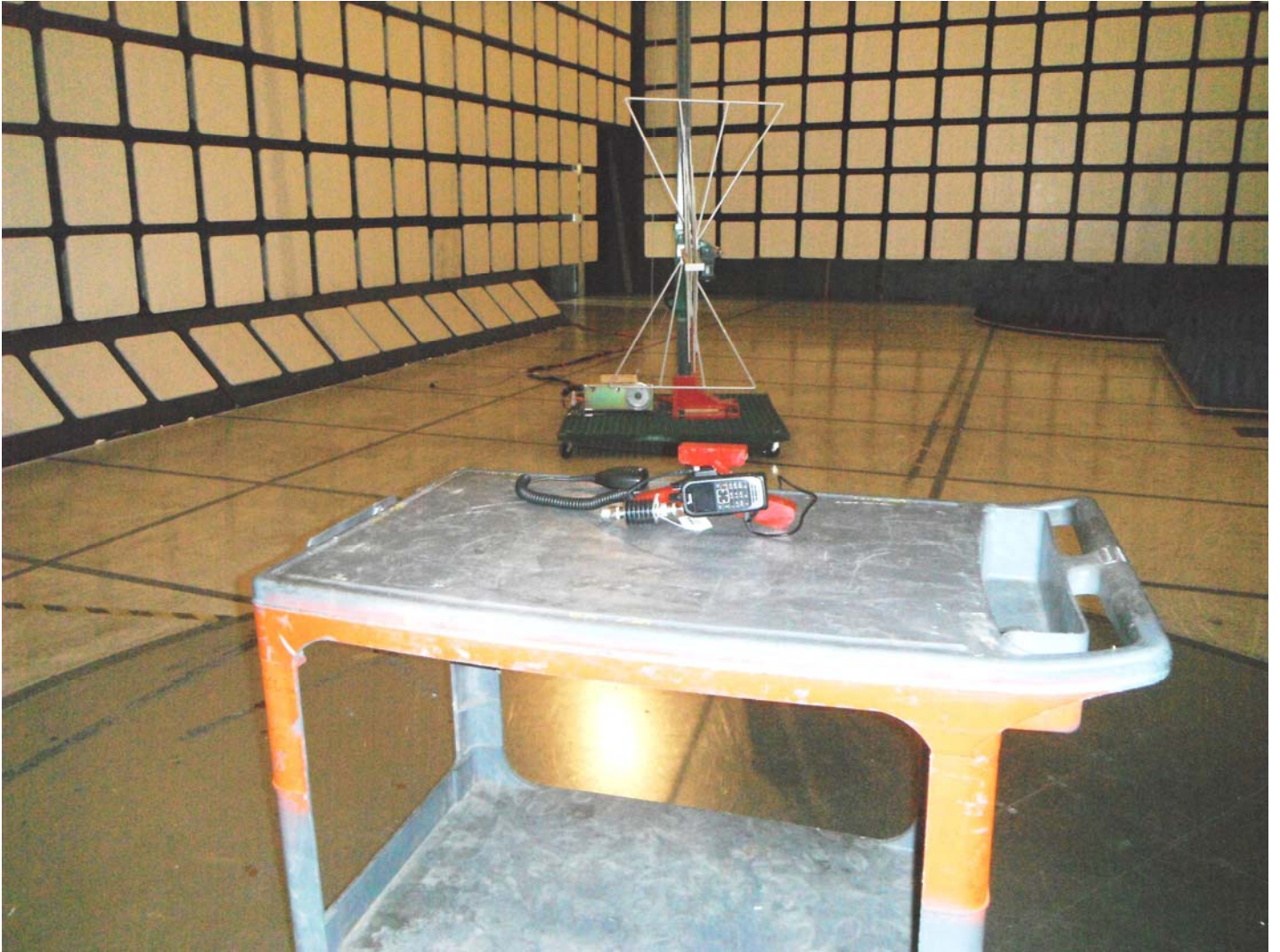
Plot #2: Tx Radiated Emission Test Setup

ICOM Incorporated UHF Transceiver, M/N: IC-F4400DT FCC ID: AFJ376701, IC: 202D-376701