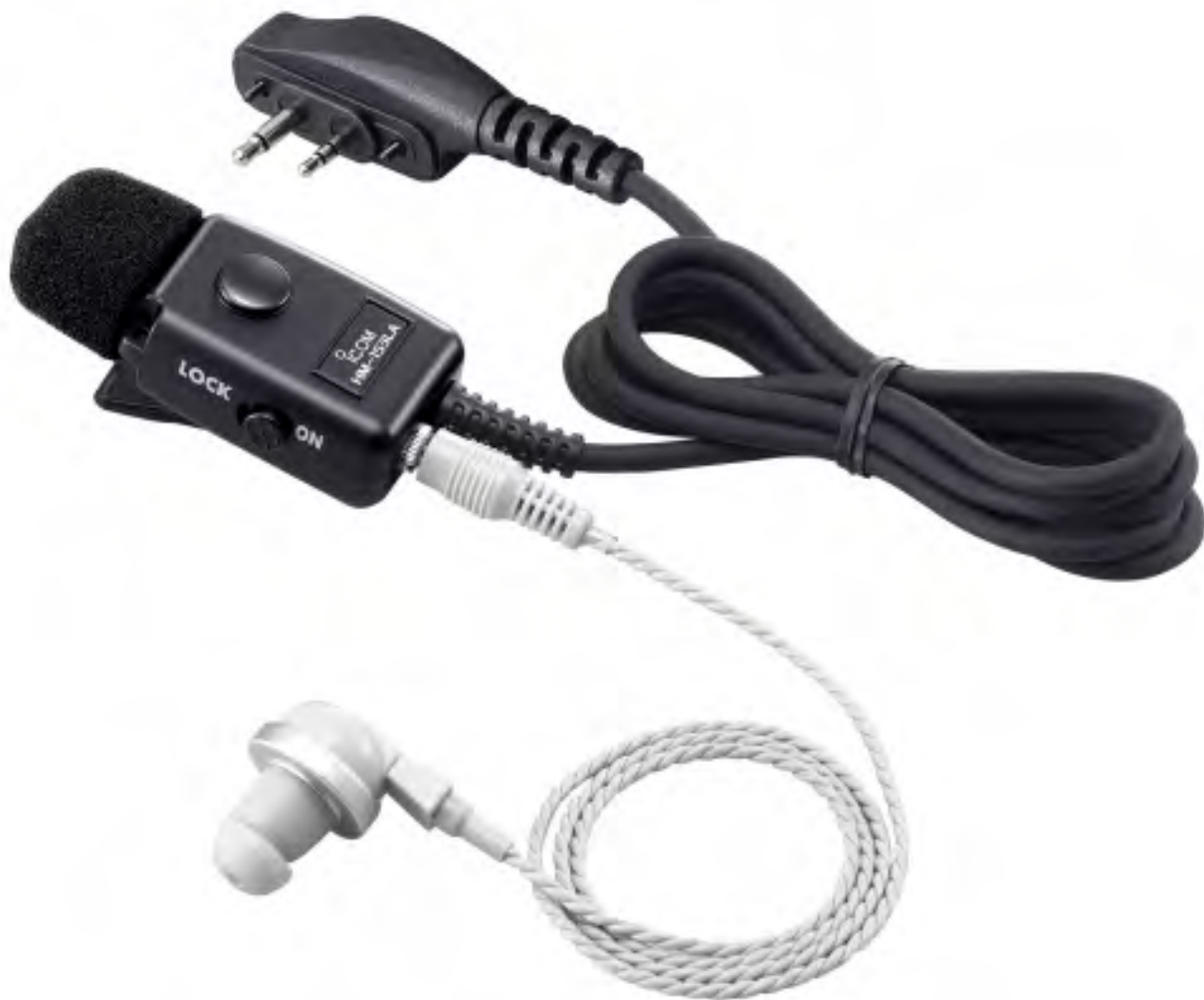
< HM-153LA Speaker Microphone >