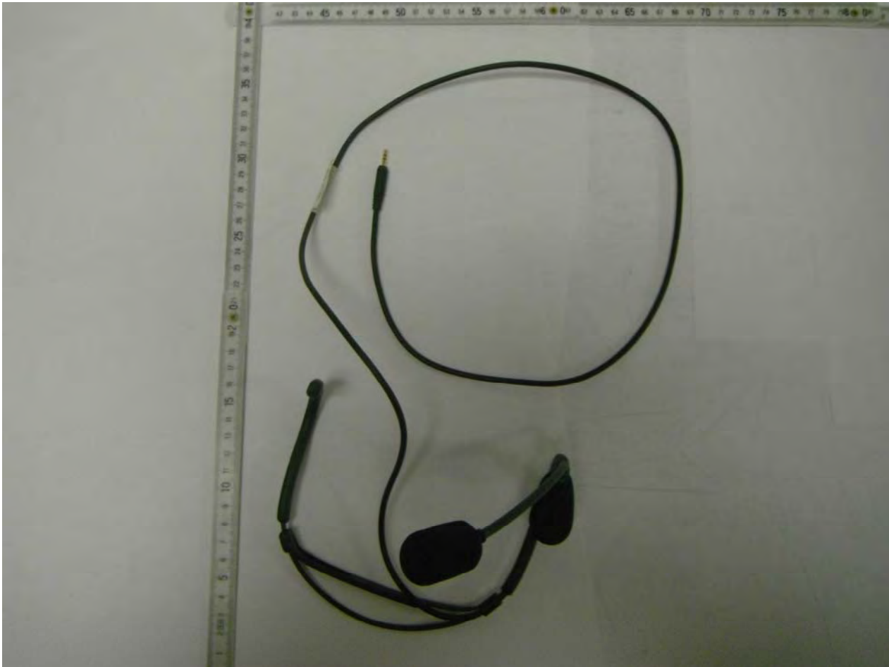
<HS-95 Neck Arm Headset + Plug Adapter Cable>