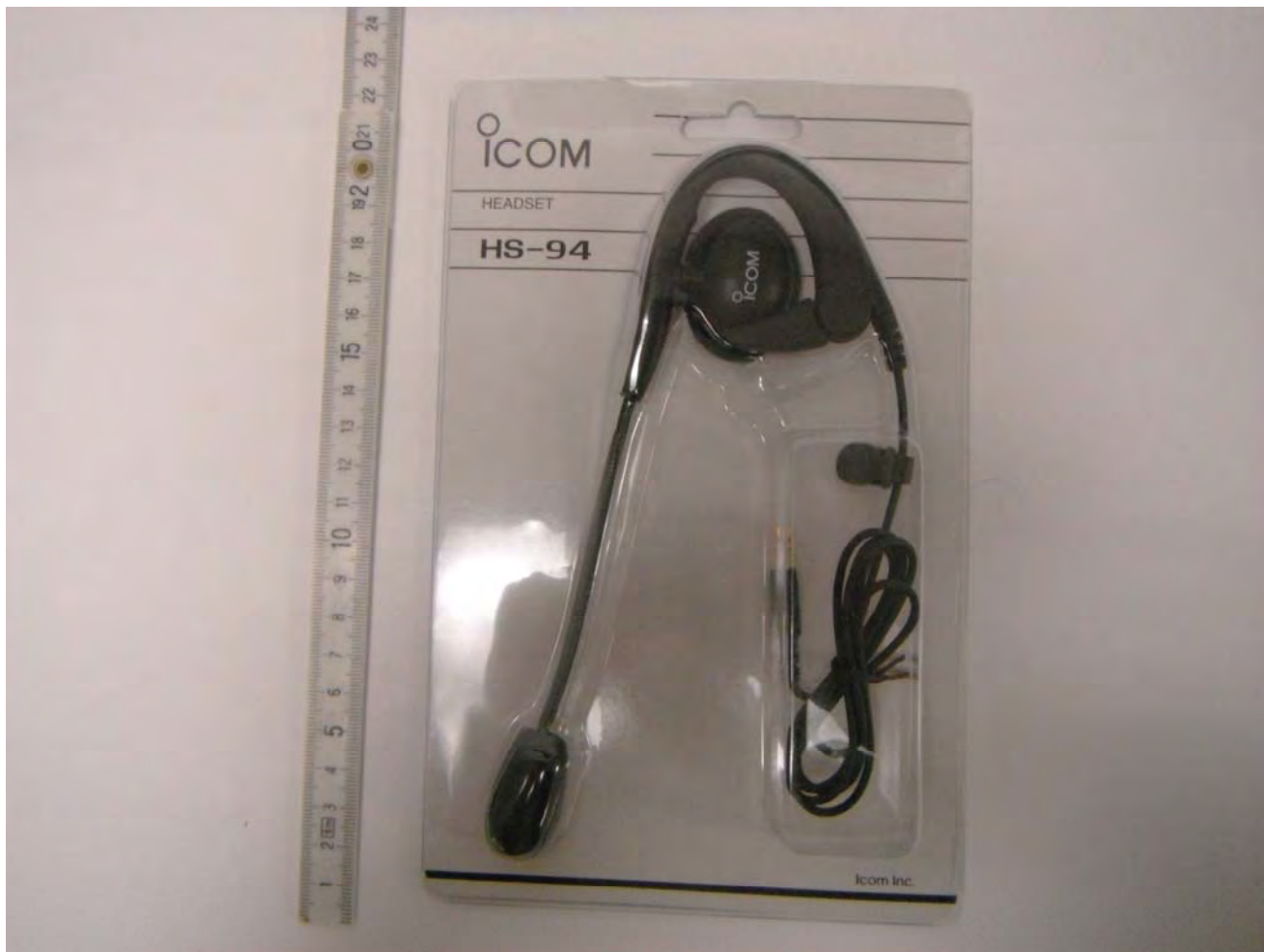
<HS-94 Ear hook Headset + Plug Adapter Cable>