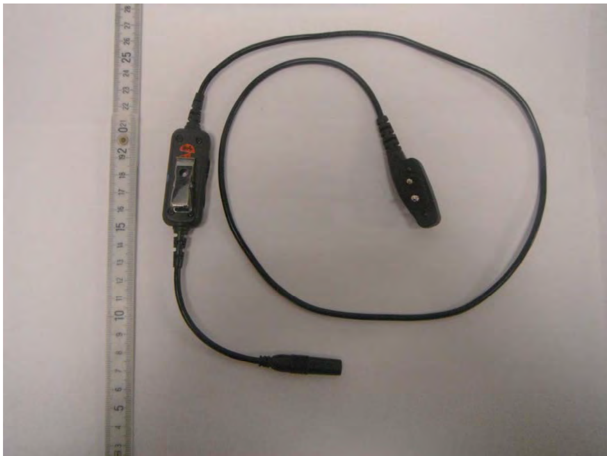
<VS-4LA PTT Switch Cable>