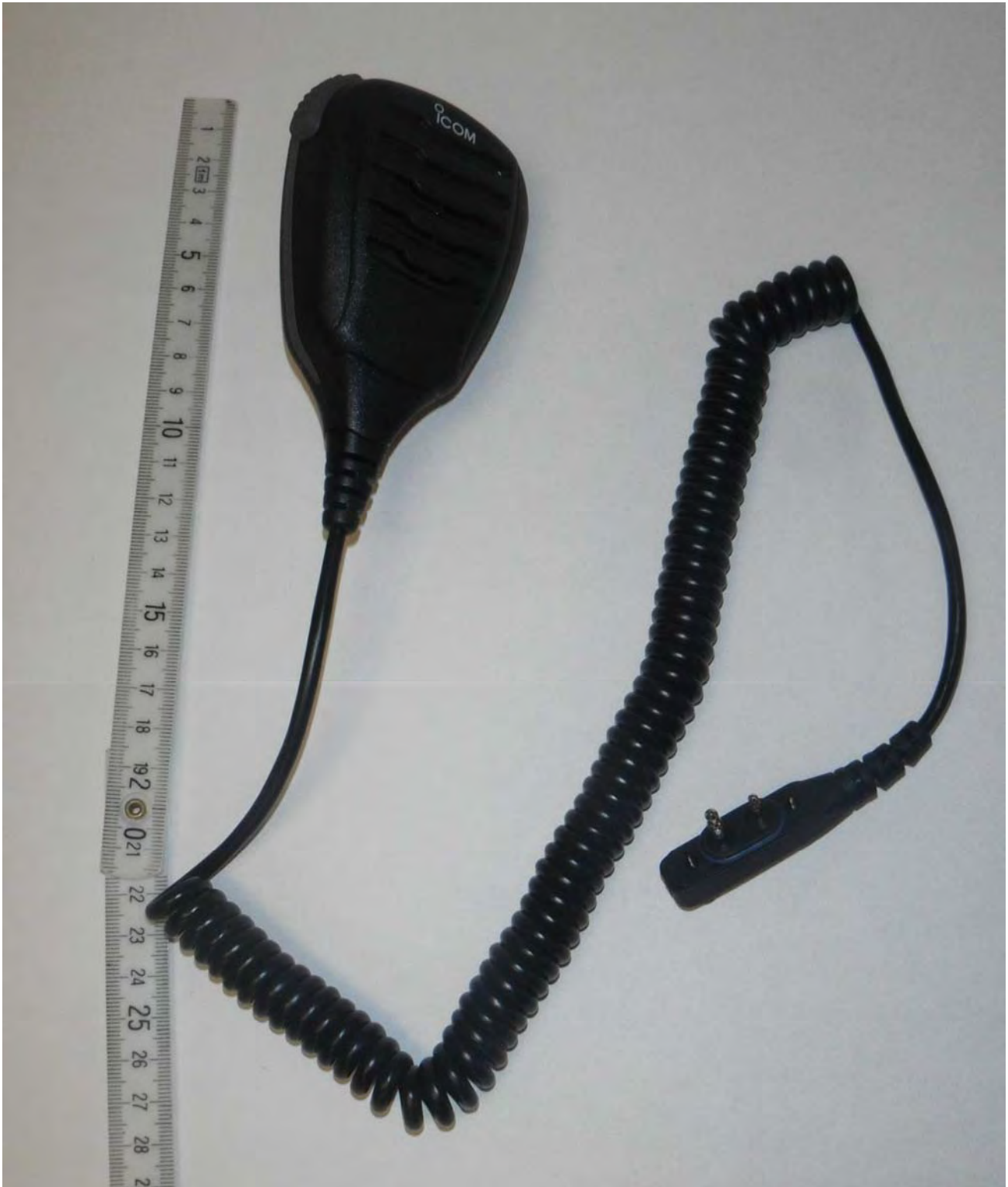
< HM-168LWP Speaker-microphone >