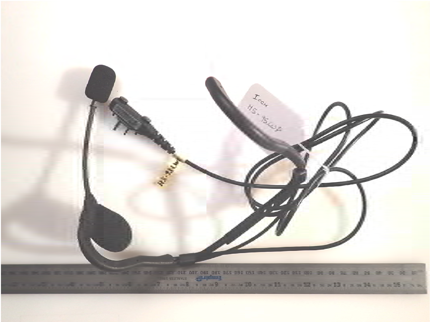
<HS-95LWP Neck Arm Headset + Plug Adapter Cable>