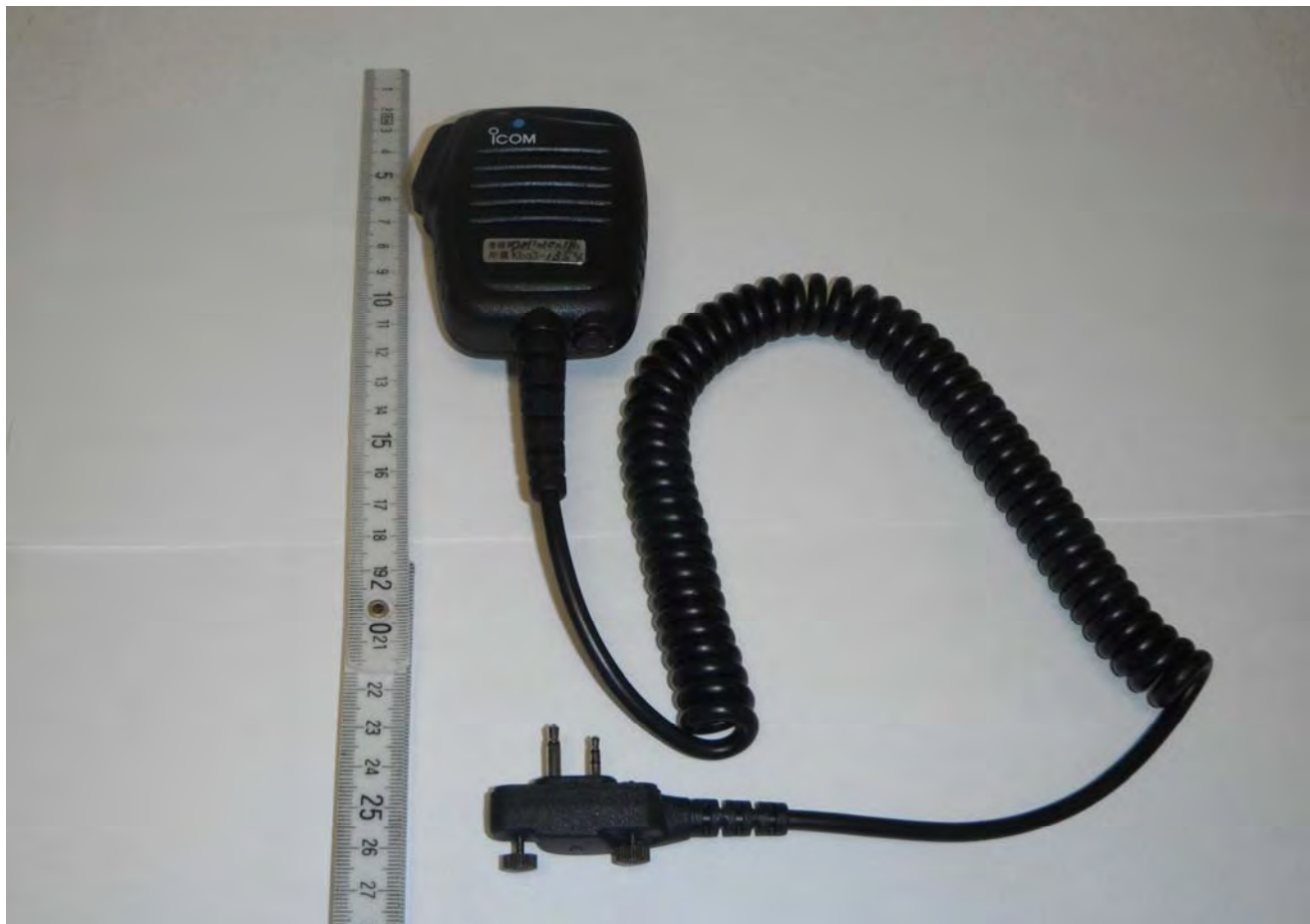
< HM-159LA Speaker Microphone >