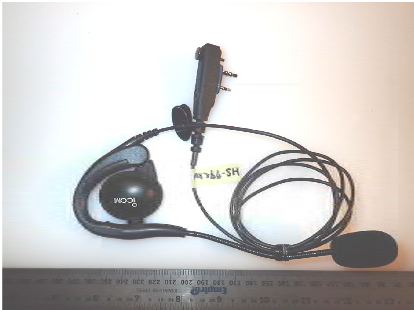
<HS-94LWP Ear hook Headset + Plug Adapter Cable>