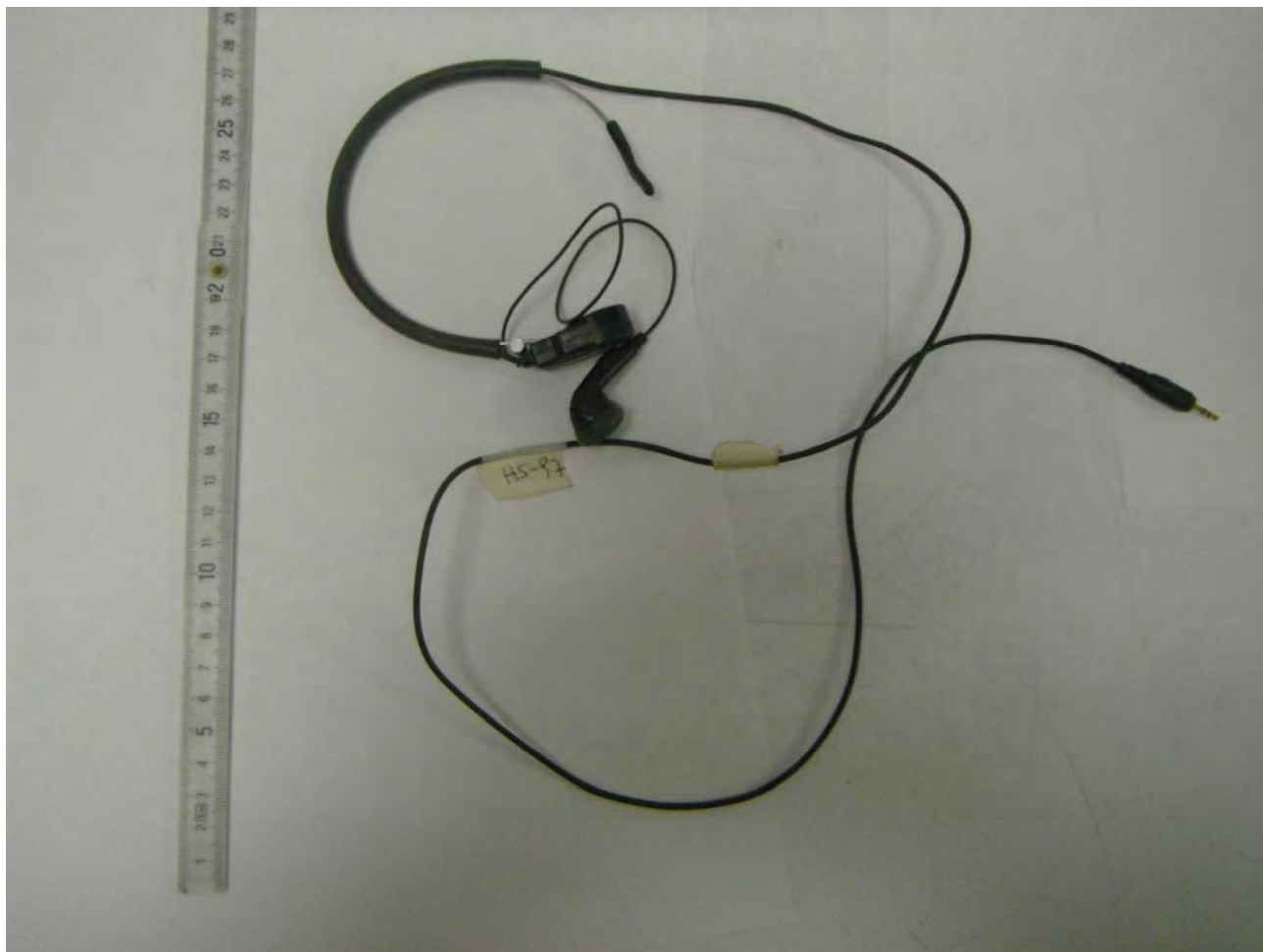
<HS-97 Throat Microphone + Plug Adapter Cable>