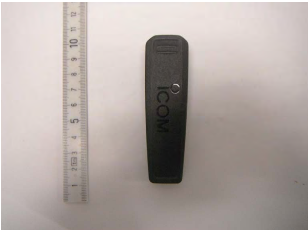
< MB-133 Belt-clip >