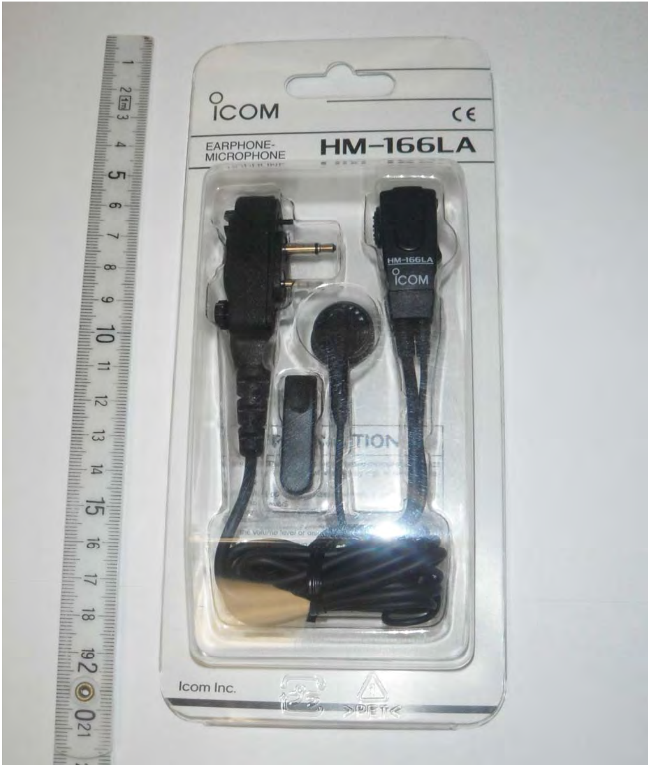
<HM-166LA Earphone Microphone>