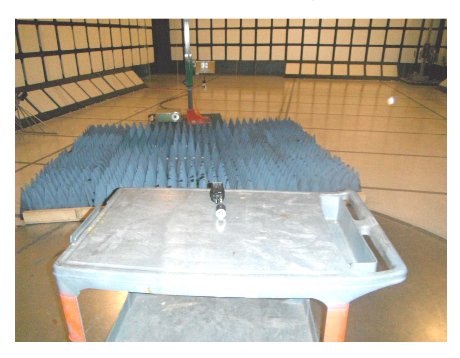
Plot #4: Tx Radiated Emission Test Setup