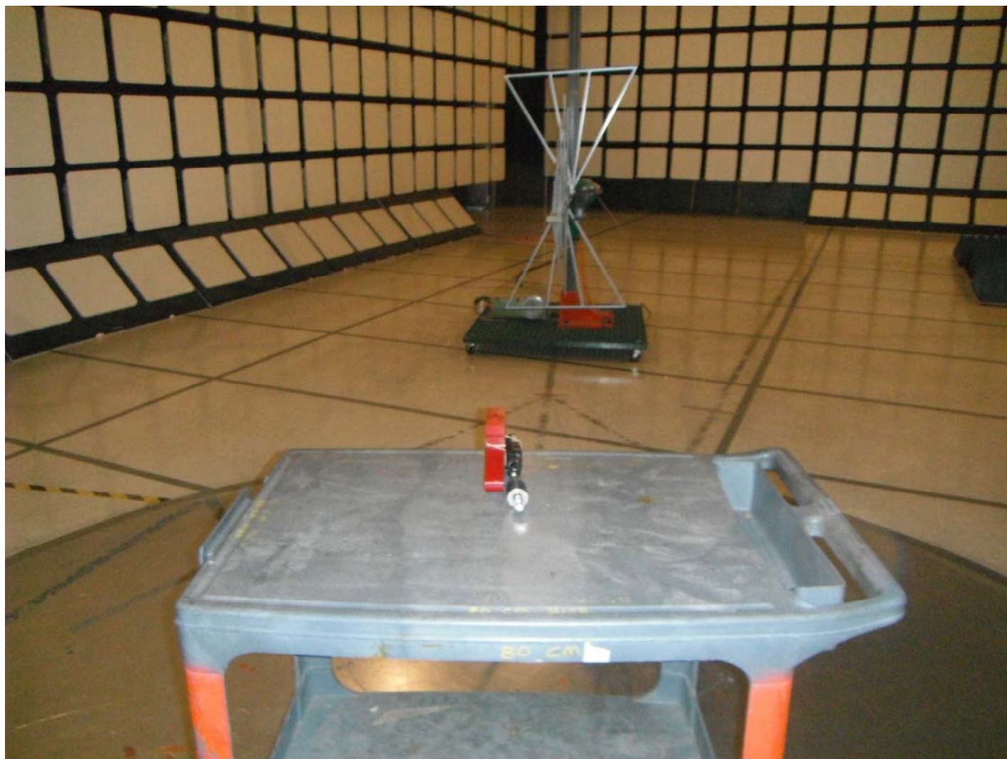
Plot #2: Tx Radiated Emission Test Setup

ICOM Incorporated UHF Transceiver, M/N: IC-F2000T FCC ID: AFJ362101, IC: 202D-362101