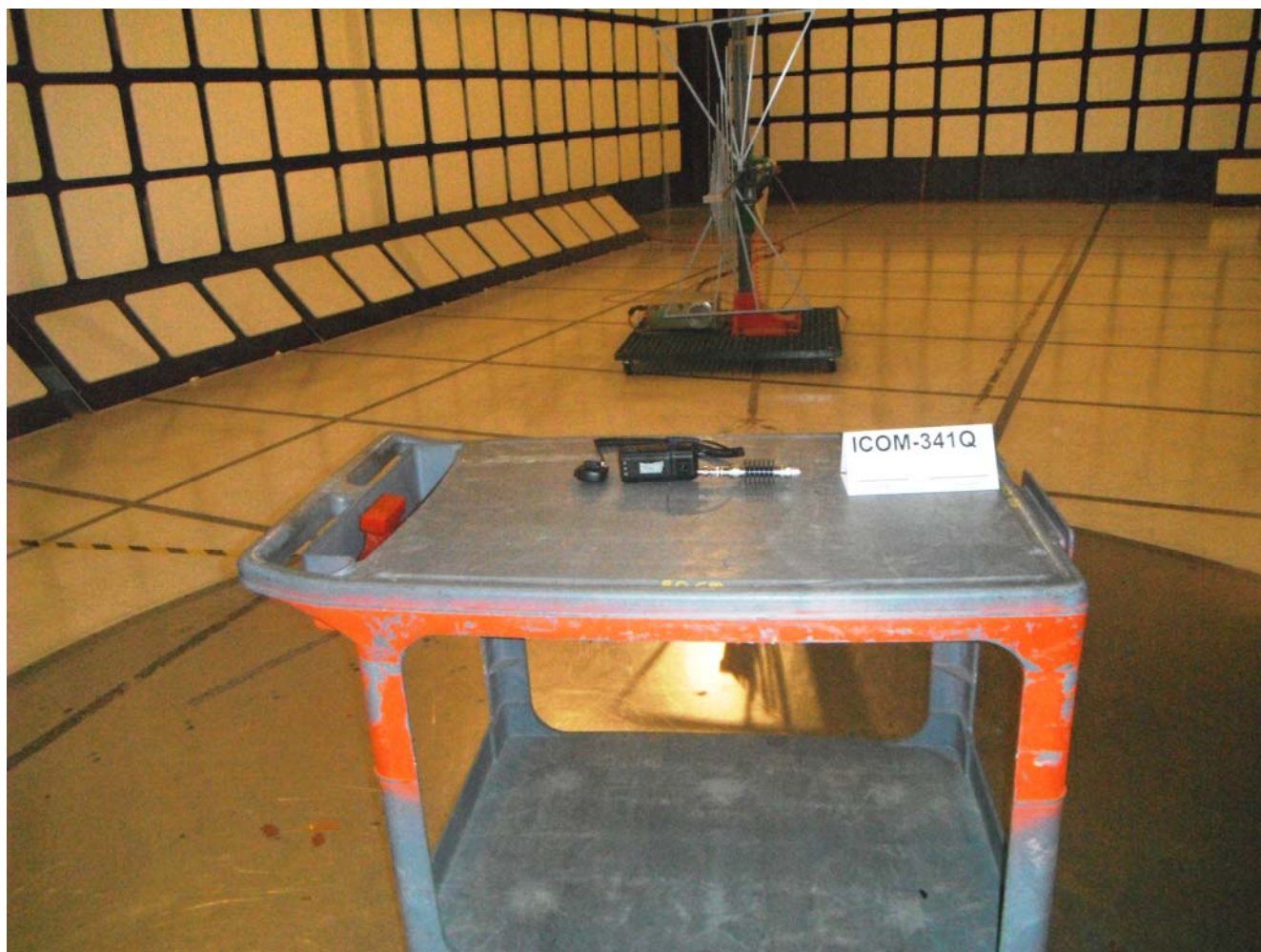
Plot #4: Tx Radiated Emission Test Setup

ICOM Incorporated VHF Transceiver, M/N: IC-F3230DS FCC ID: AFJ352100, IC: 202D-352100