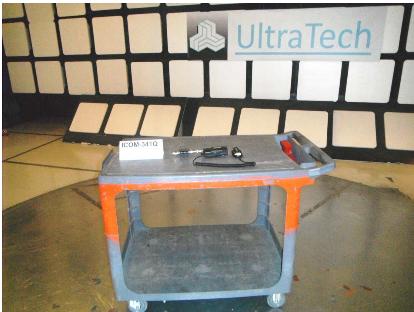
Plot #2: Tx Radiated Emission Test Setup

ICOM Incorporated VHF Transceiver, M/N: IC-F3230DS FCC ID: AFJ352100, IC: 202D-352100