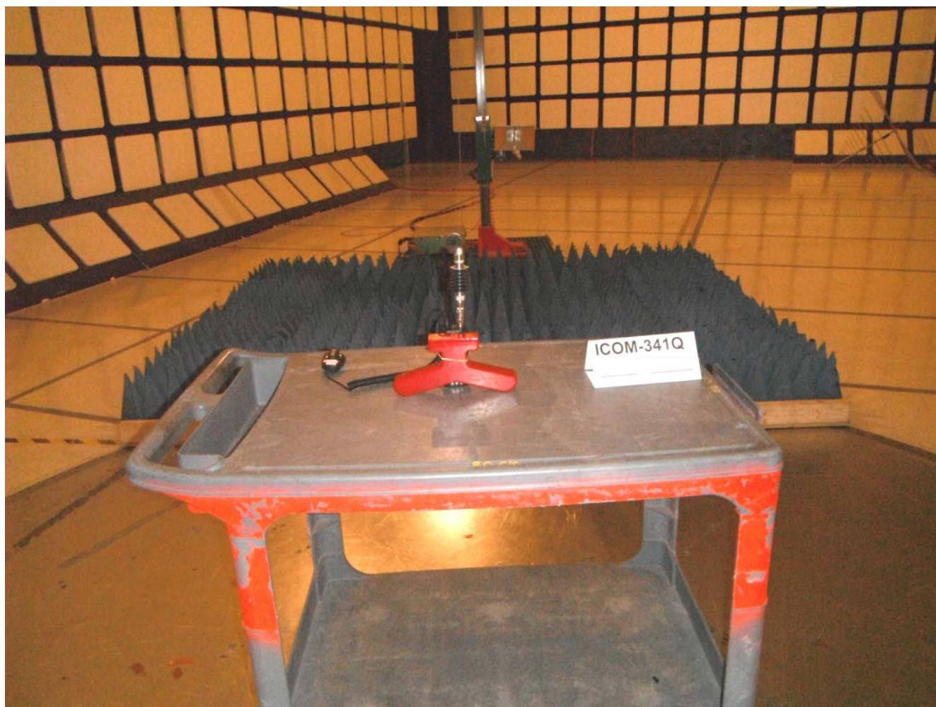
Plot #5: Tx Radiated Emission Test Setup

ICOM Incorporated VHF Transceiver, M/N: IC-F3230DS FCC ID: AFJ352100, IC: 202D-352100