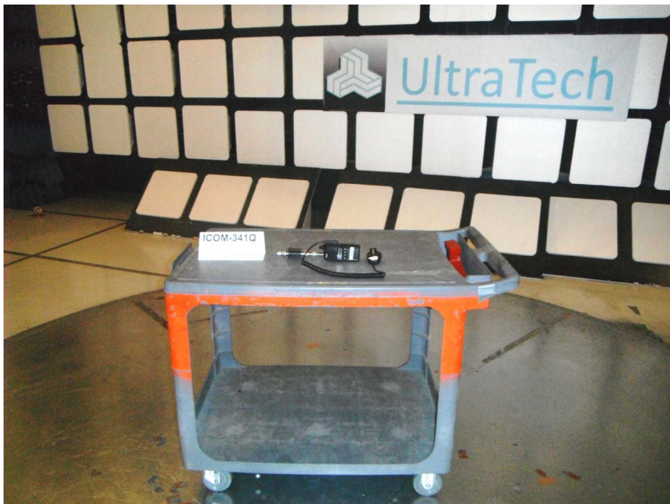
Plot #3: Tx Radiated Emission Test Setup

ICOM Incorporated VHF Transceiver, M/N: IC-F3230DS FCC ID: AFJ352100, IC: 202D-352100