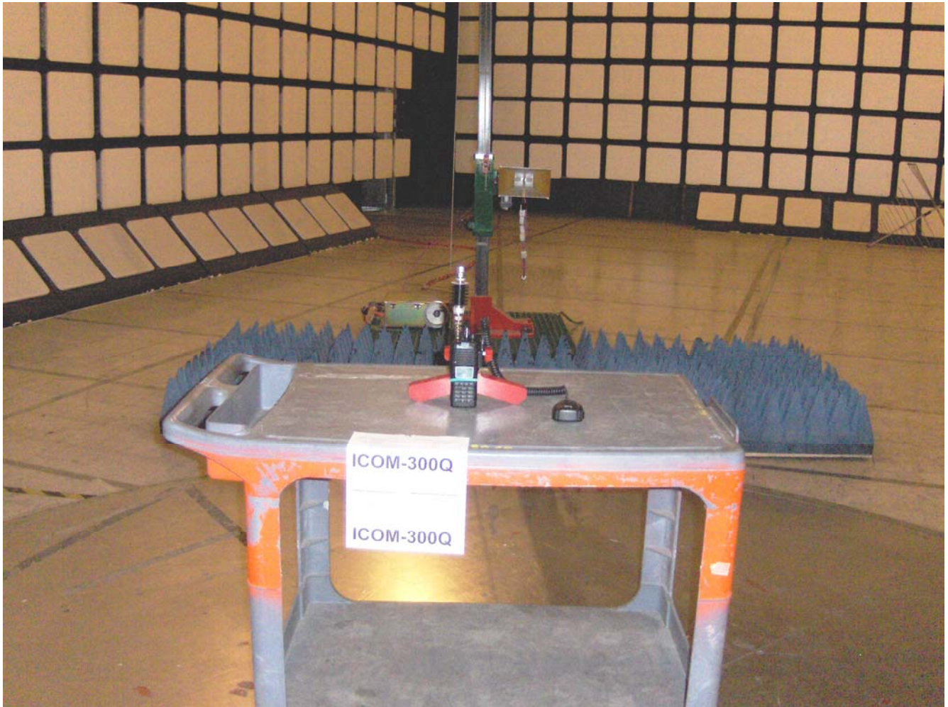
Plot #4: Tx Radiated Emission Test Setup

ICOM Incorporated VHF Transceivers, M/N: IC-F3261DT & IC-F3261DS FCC ID: AFJ340100, IC: 202D-340100