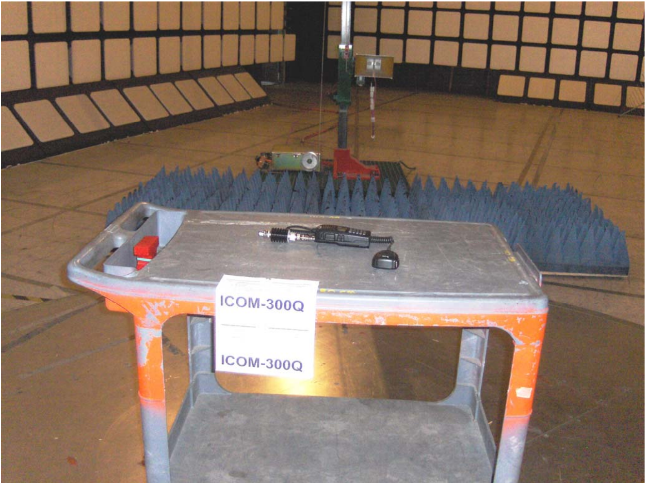
Plot #2: Tx Radiated Emission Test Setup

ICOM Incorporated VHF Transceivers, M/N: IC-F3261DT & IC-F3261DS FCC ID: AFJ340100, IC: 202D-340100