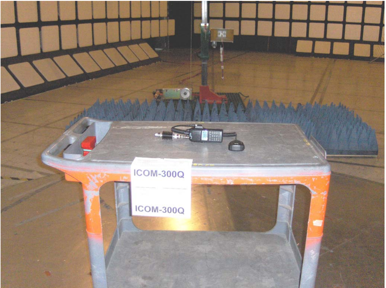
Plot #3: Tx Radiated Emission Test Setup

ICOM Incorporated VHF Transceivers, M/N: IC-F3261DT & IC-F3261DS FCC ID: AFJ340100, IC: 202D-340100