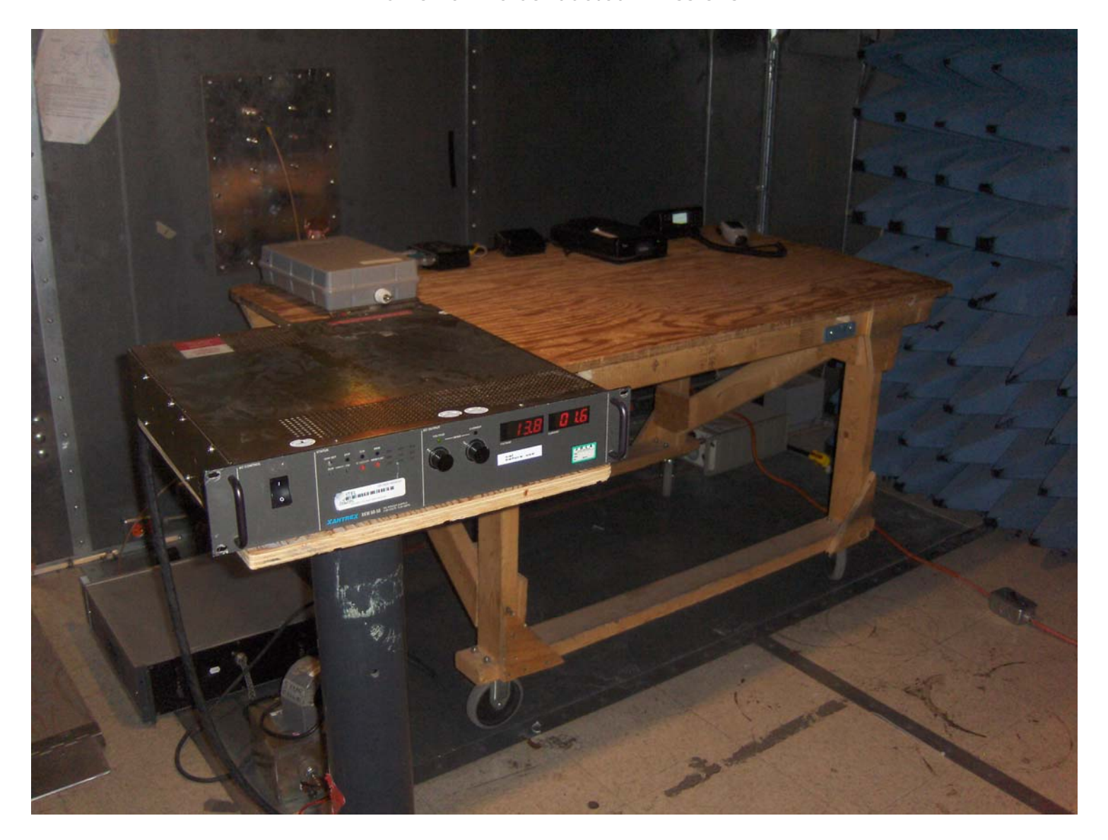
DC Powerline Conducted Emissions