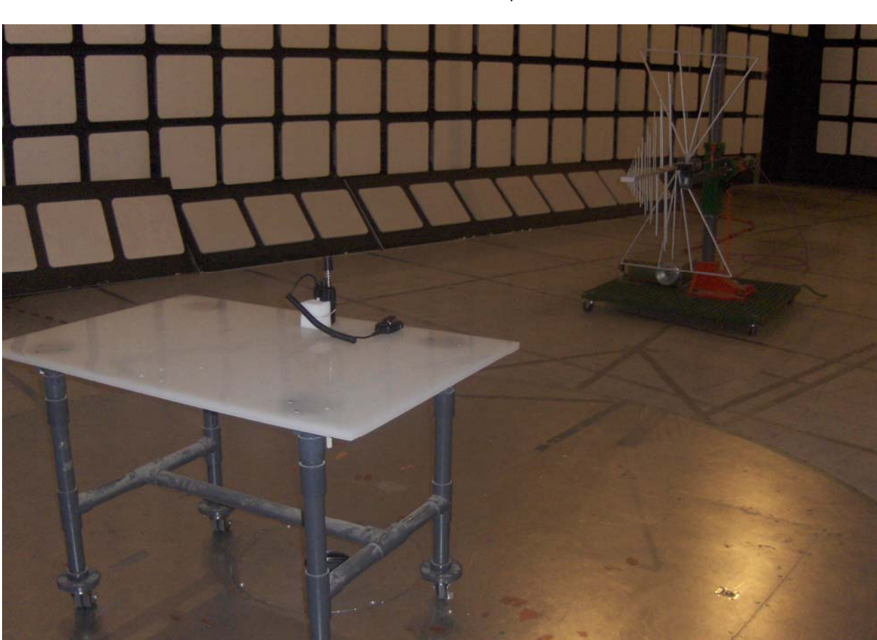
< Radiated emission test, Tx mode >