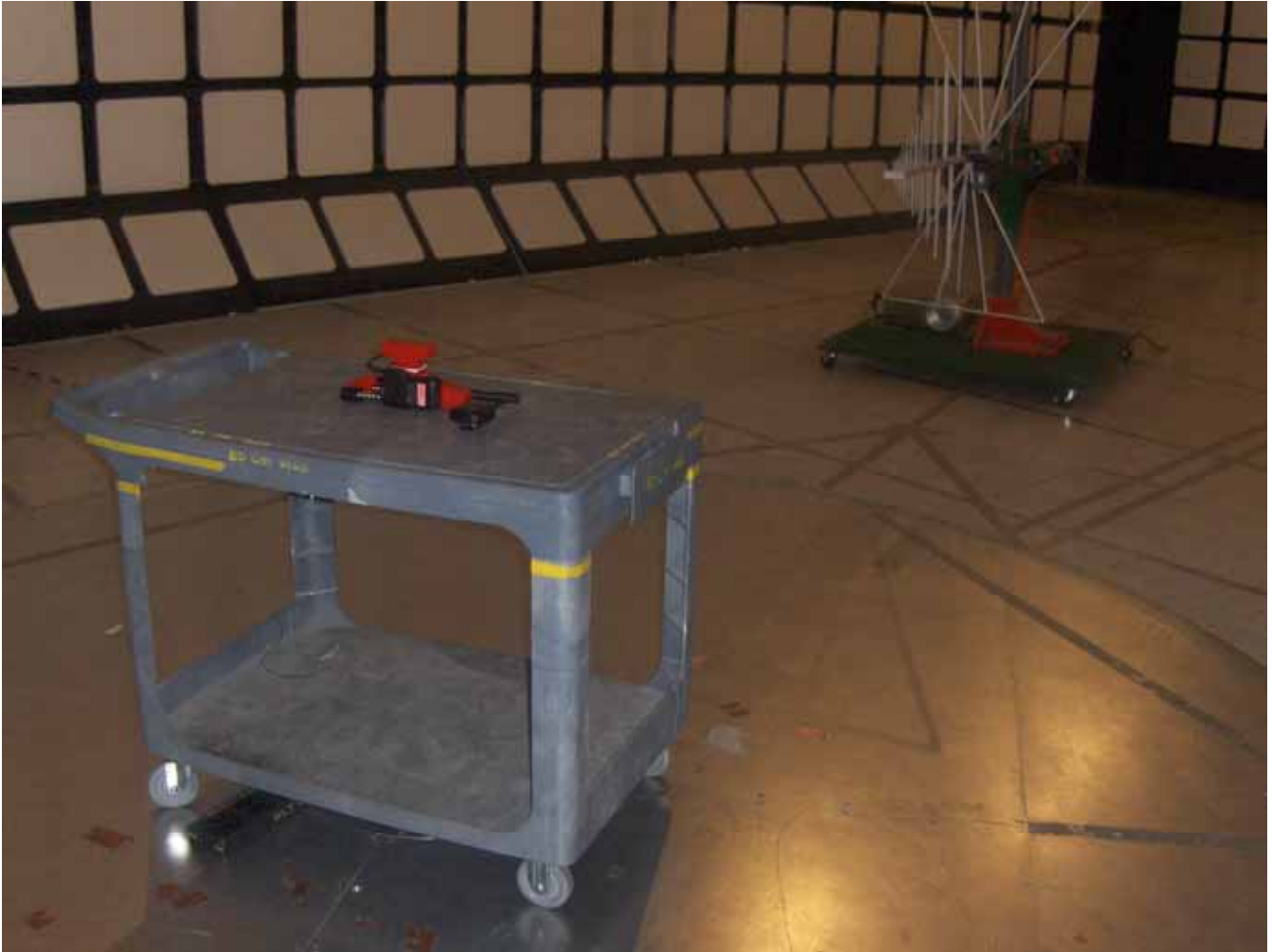
< Radiated emission test, Tx mode >

ICOM Incorporated UHF Transceiver, M/N: IC-F4001 FCC ID: AFJ328601, IC: 202D-328601