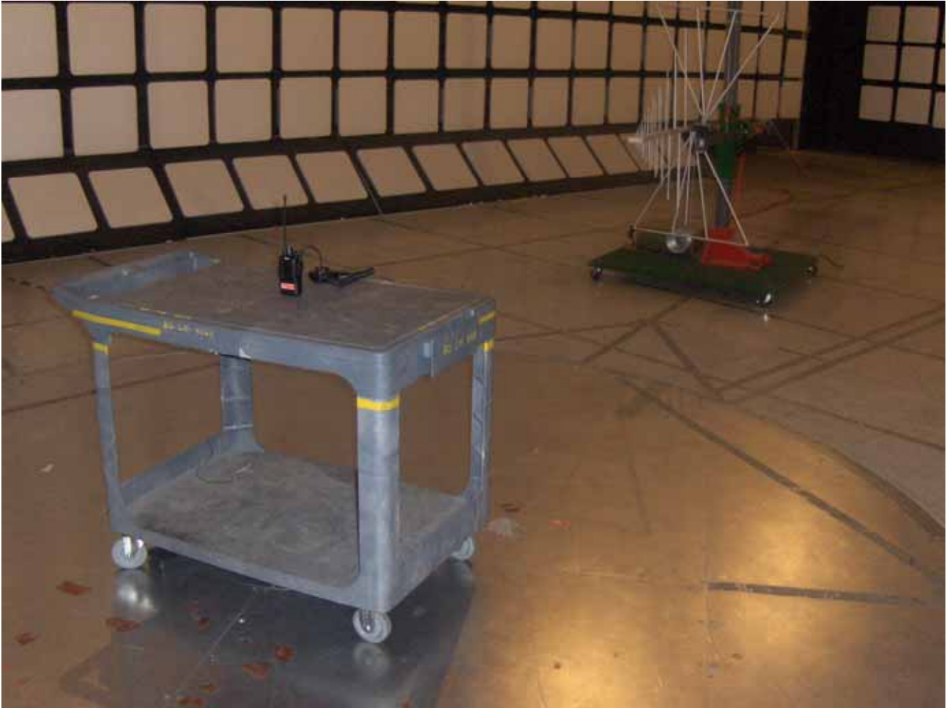
< Radiated emission test, Rx mode >

ICOM Incorporated UHF Transceiver, M/N: IC-F4001 FCC ID: AFJ328601, IC: 202D-328601