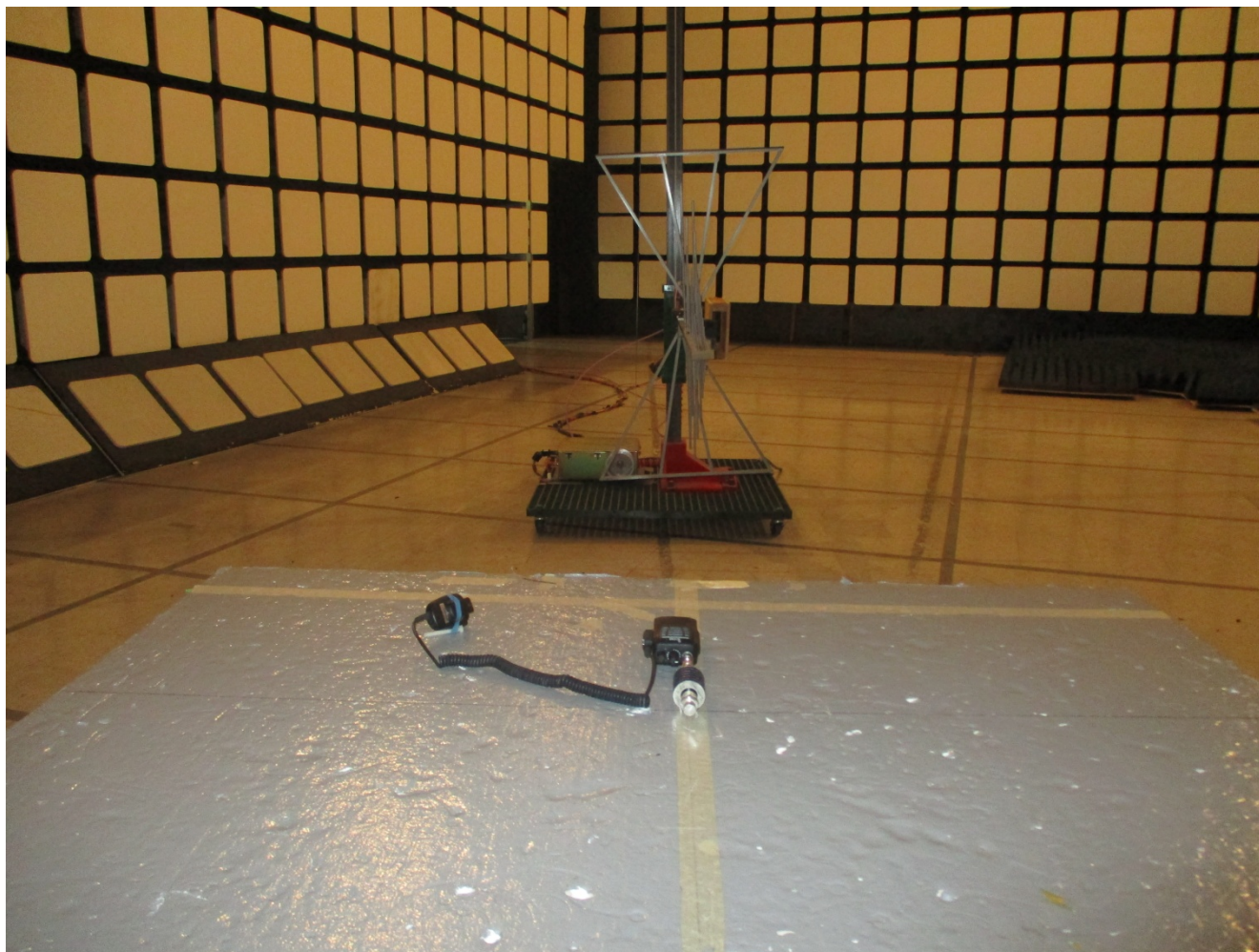
Radiated Emissions at 3 m Orthogonal Position 1