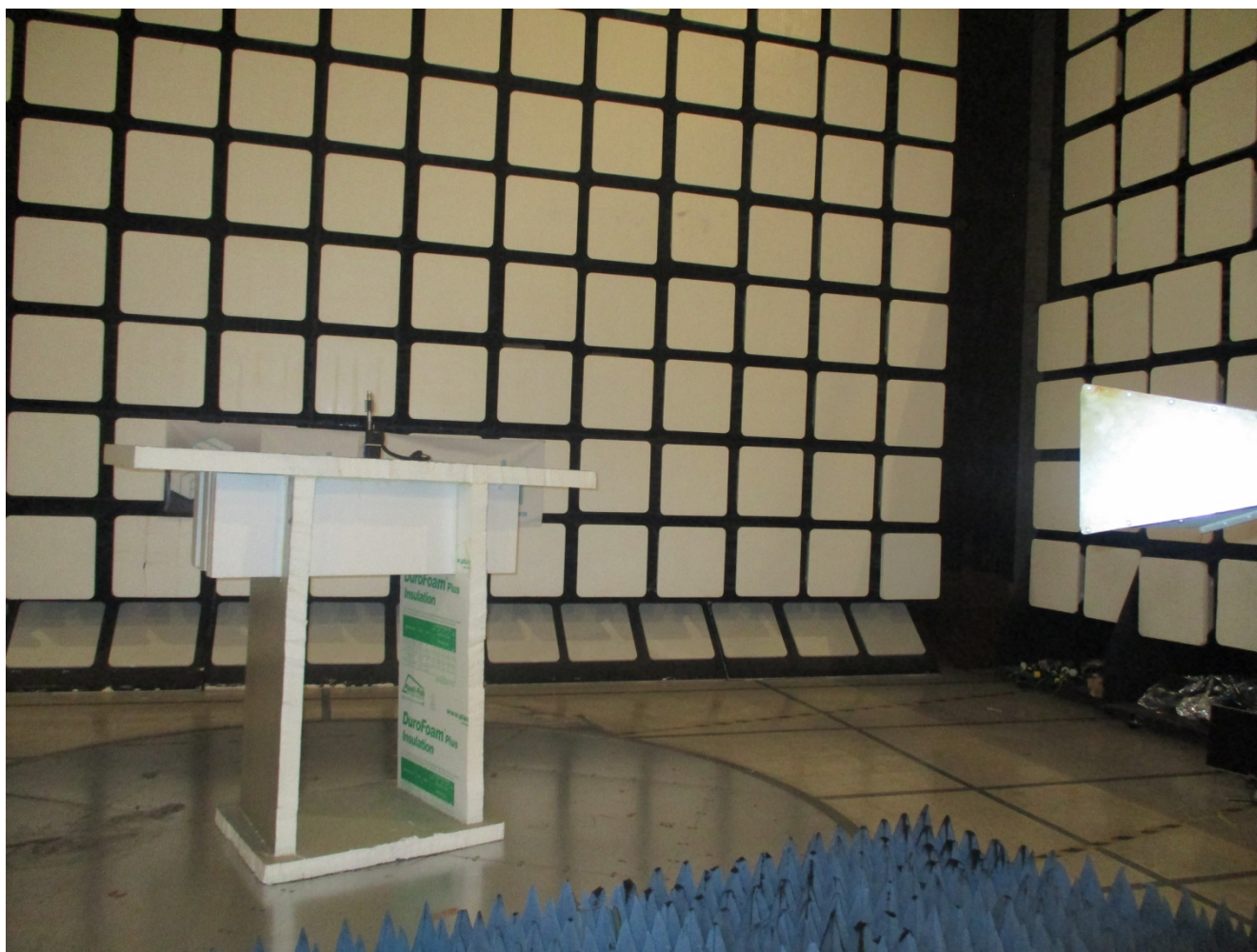
Radiated Emissions at 3 m Orthogonal Position 3