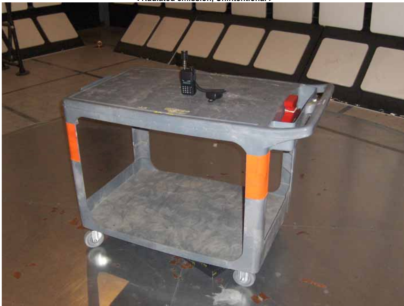
< Radiated emission, Unintentional >

ICOM Incorporated VHF Transceiver, M/N: IC-V80 FCC ID: AFJ325400 IC: 202D-325400