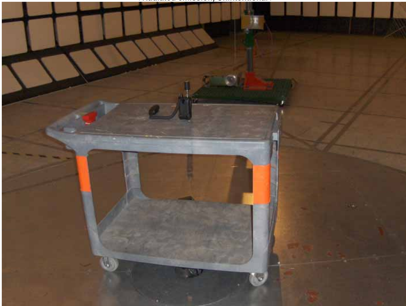
< Radiated emission, Unintentional >