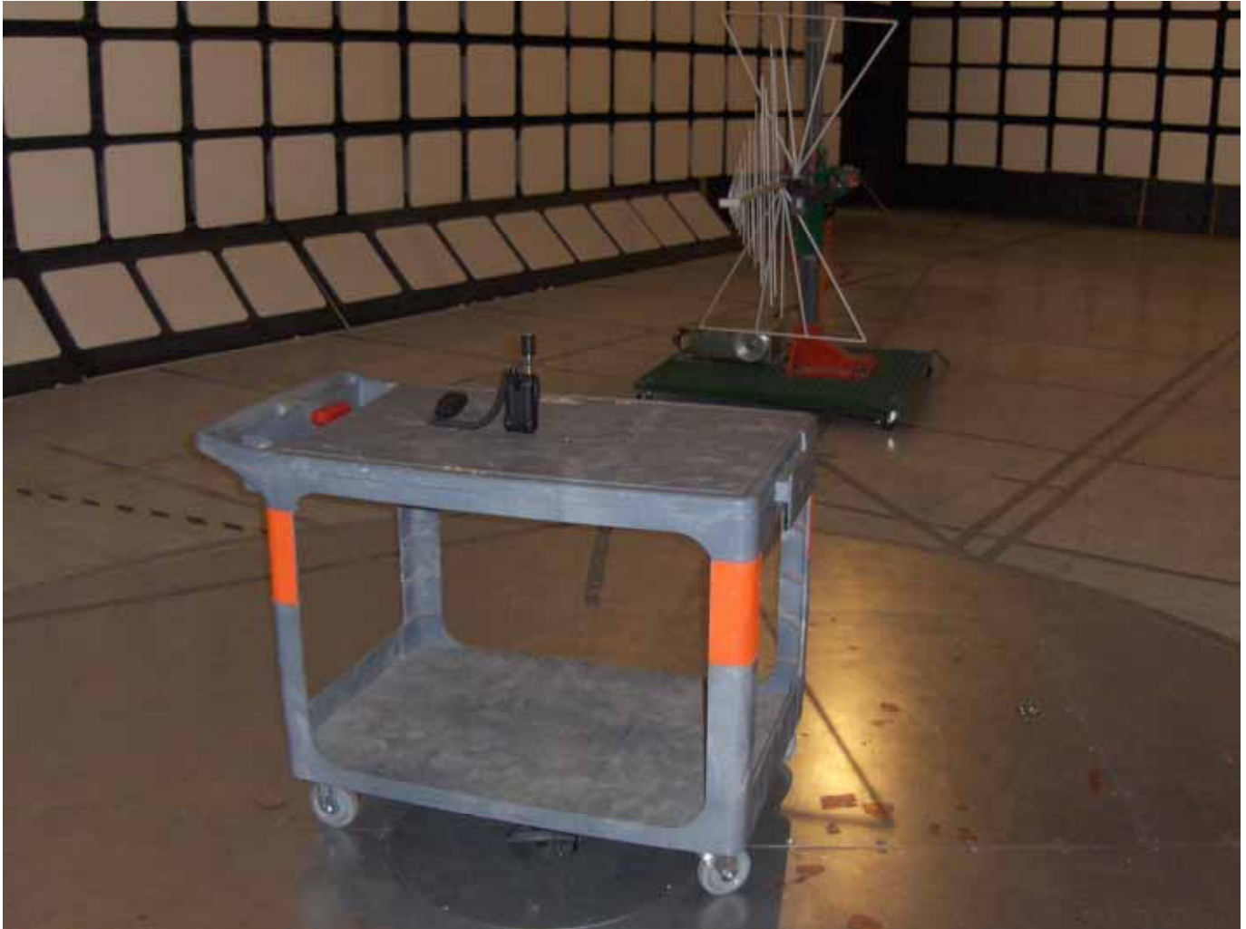
< Radiated emission, Unintentional >