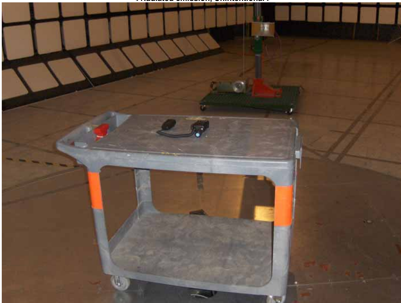
< Radiated emission, Unintentional >