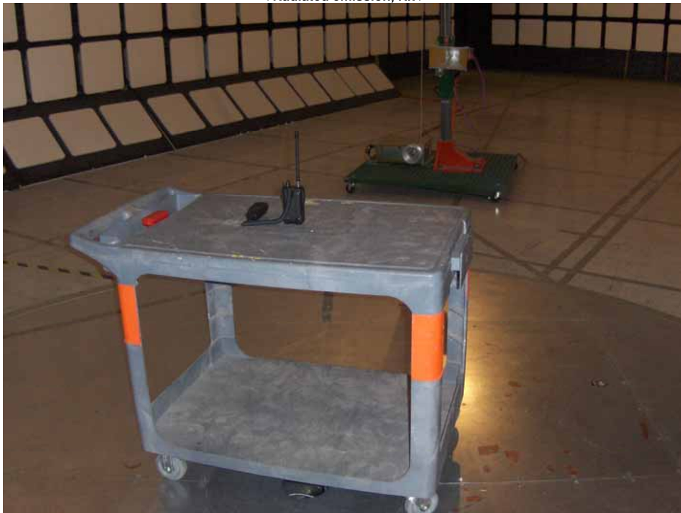
< Radiated emission, Rx >

ICOM Incorporated VHF Transceiver, M/N: IC-V80 FCC ID: AFJ325400 IC: 202D-325400