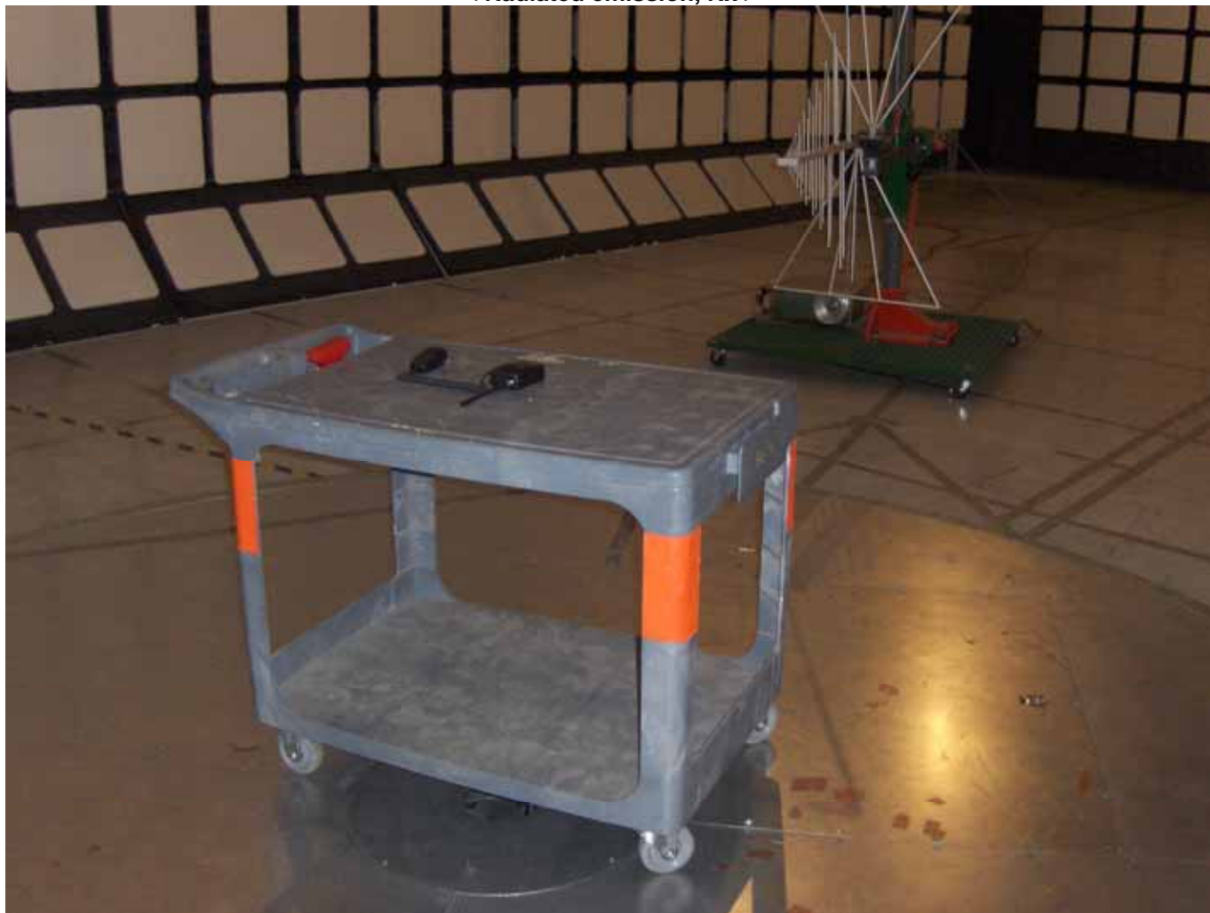
< Radiated emission, Rx >