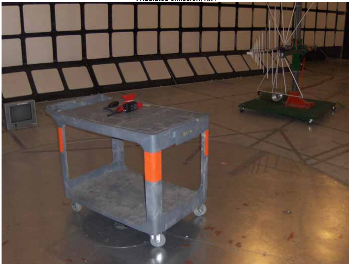
< Radiated emission, Rx >

ICOM Incorporated VHF Transceiver, M/N: IC-V80 FCC ID: AFJ325400 IC: 202D-325400