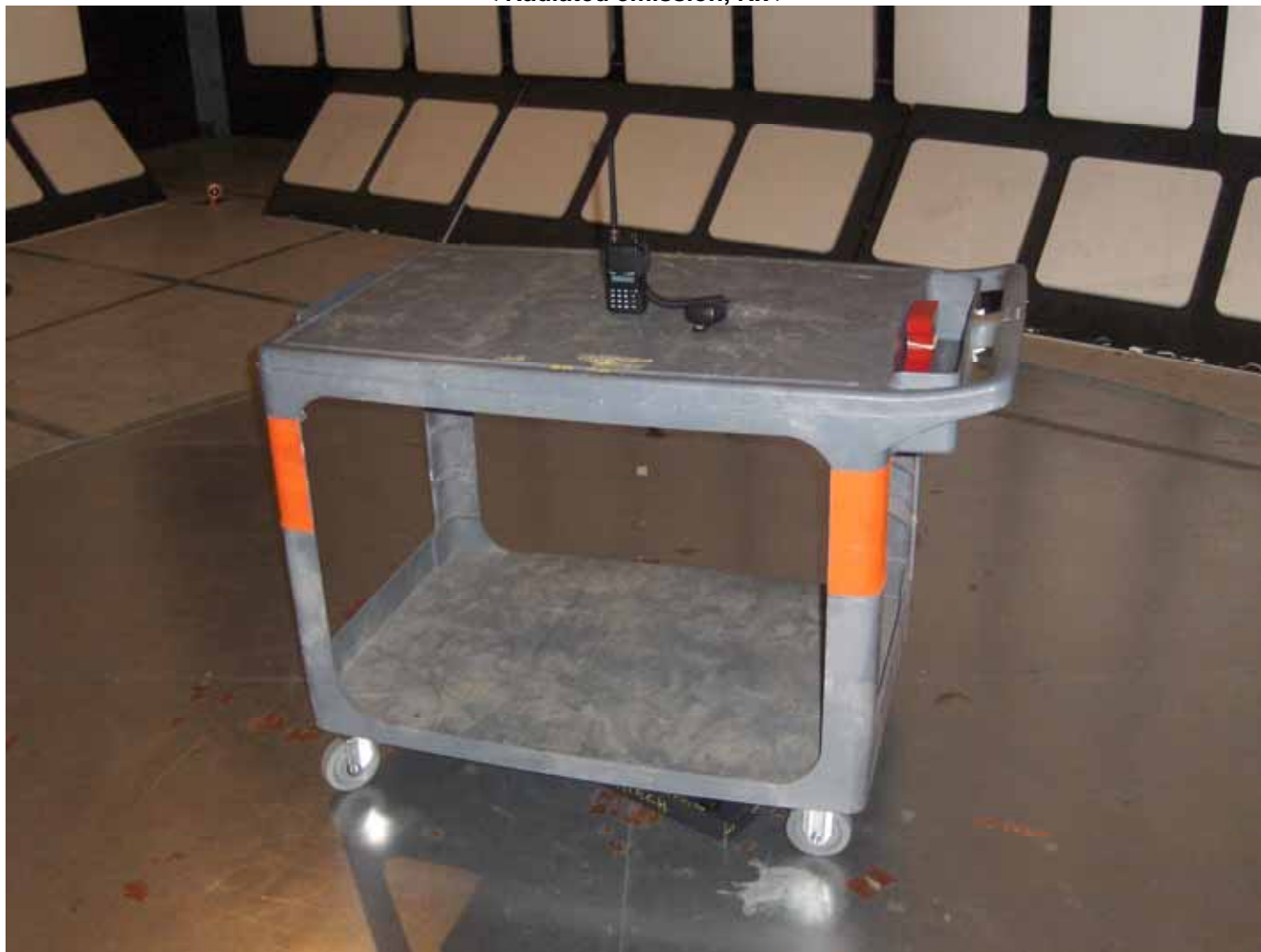
< Radiated emission, Rx >

ICOM Incorporated VHF Transceiver, M/N: IC-V80 FCC ID: AFJ325400 IC: 202D-325400