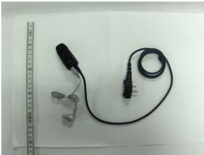
< HM-153LA Speaker-Microphone >

3000 Bristol Circle, Oakville, Ontario, Canada L6H 6G4