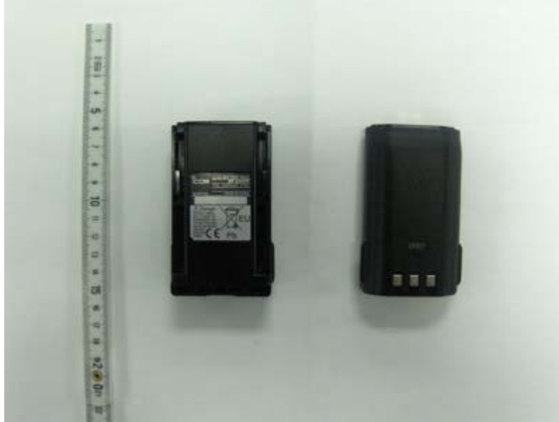
< BP-232WP Li-ion Battery >