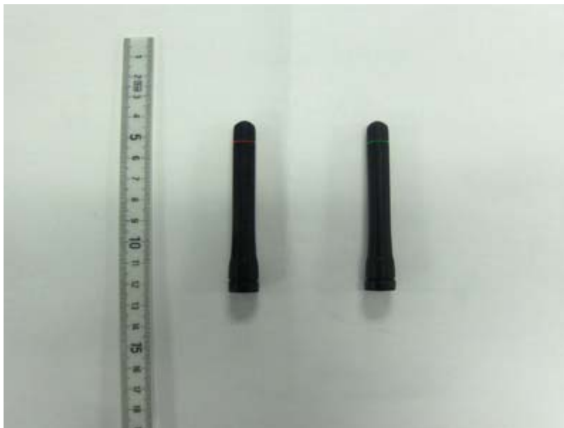
< FA-SC56VS (Red Ring) & FA-SC57VS (Green Ring)>

3000 Bristol Circle, Oakville, Ontario, Canada L6H 6G4