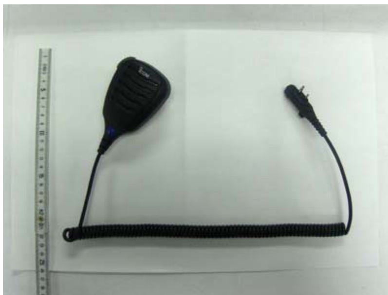
&lt; HM-168LWP Speaker-Microphone &gt;

3000 Bristol Circle, Oakville, Ontario, Canada L6H 6G4