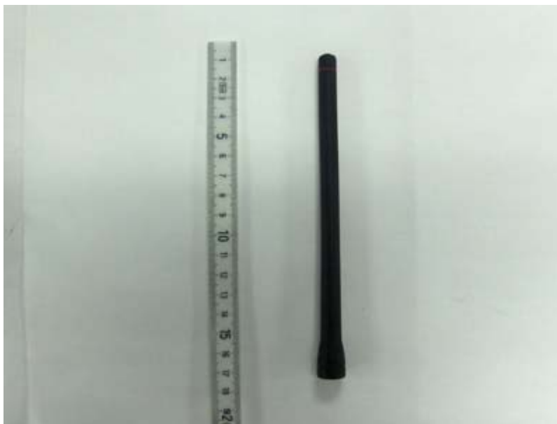
< FA-SC55V (Red Ring) >