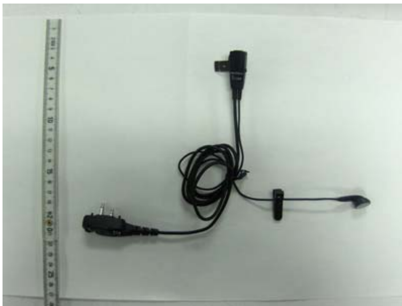
< HM-166LA Speaker-Microphone >