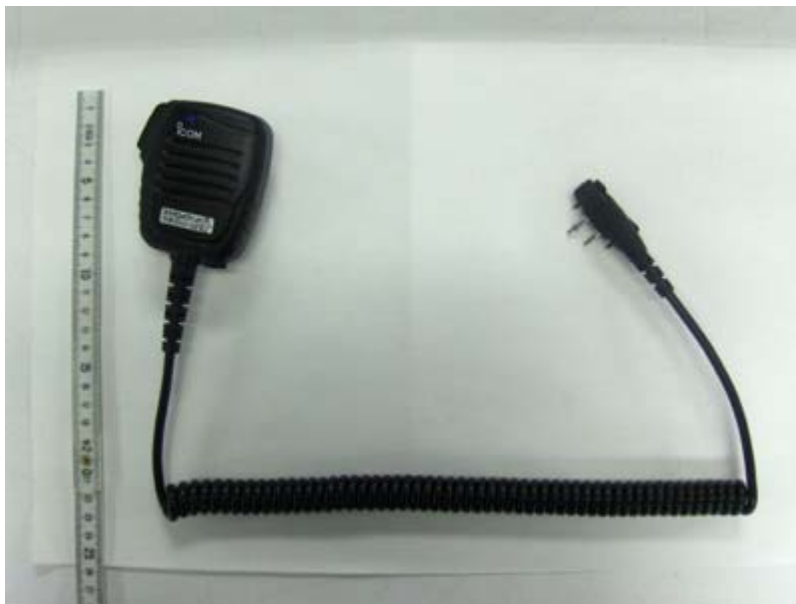
< HM-159LA Speaker-Microphone >

3000 Bristol Circle, Oakville, Ontario, Canada L6H 6G4