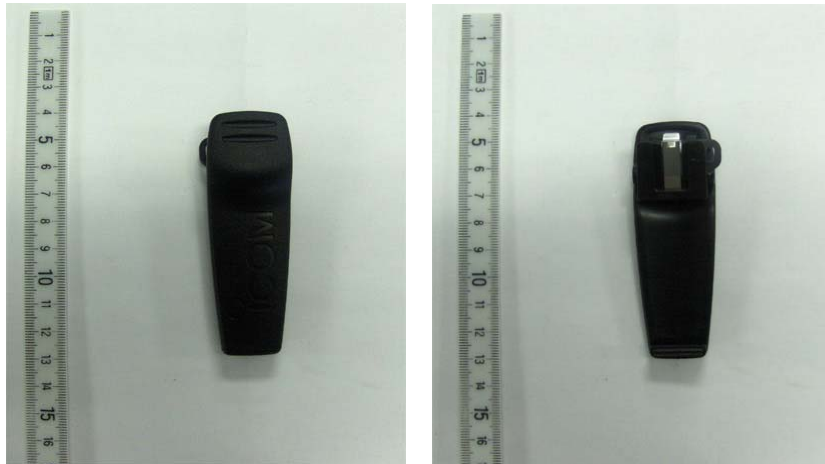
< MB-94 Belt-clip >