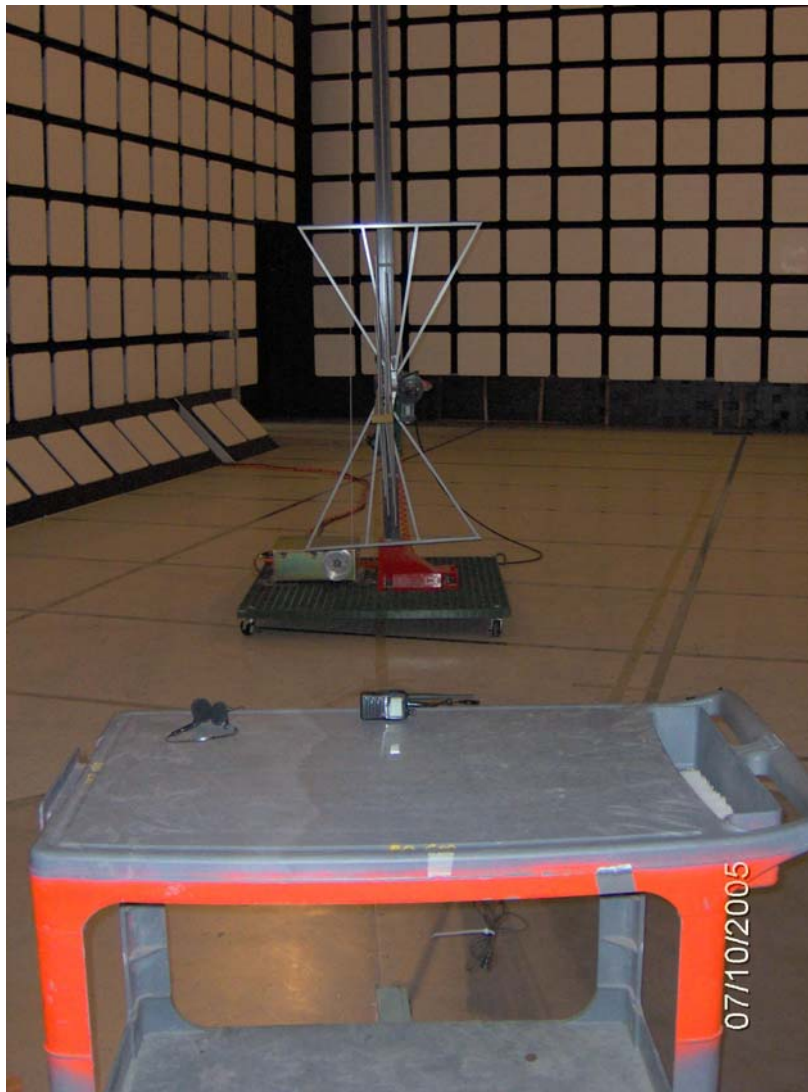
Photo #5: Radiated Emissions at 3 meters OFTS – EUT's Orthogonal Position #3