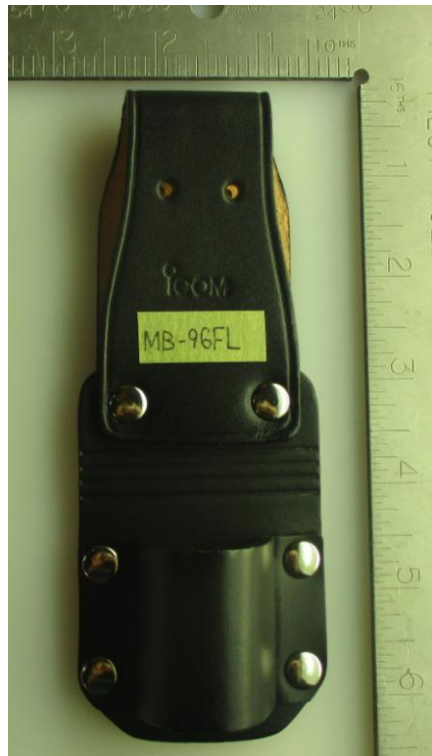
< MB-96FL Belt Hanger >