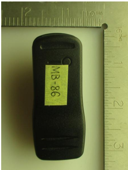
< MB-86 Belt-clip >