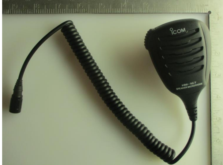
< HM-167 Hand Microphone >