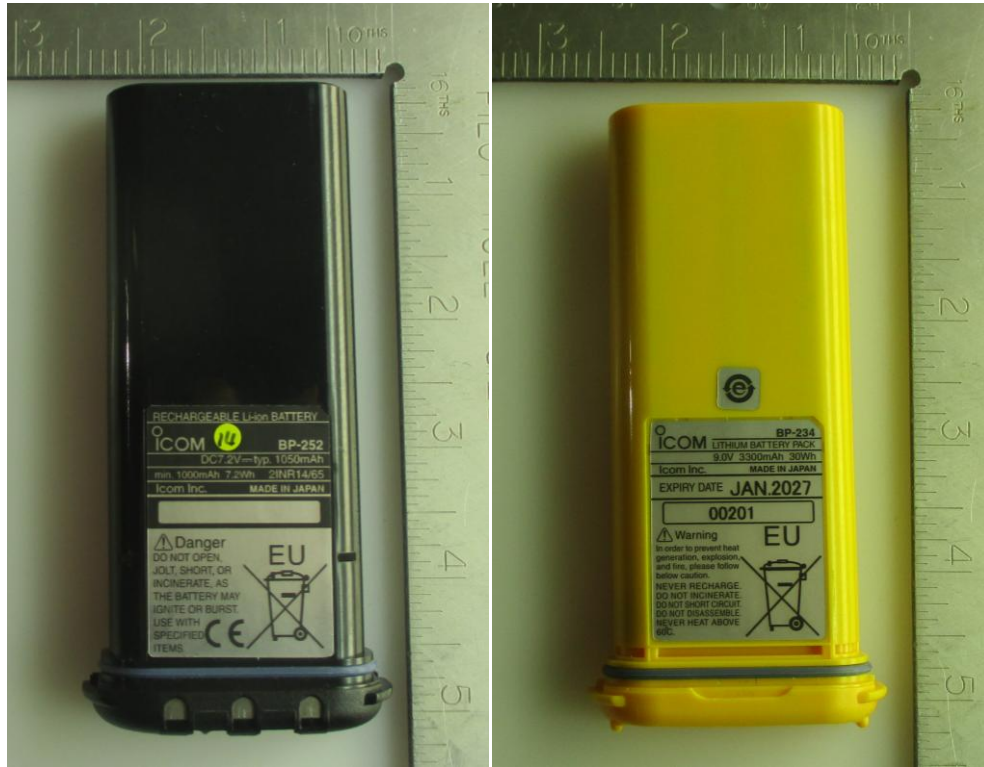
< BP-252 (left) and BP-234 (right) Batteries >