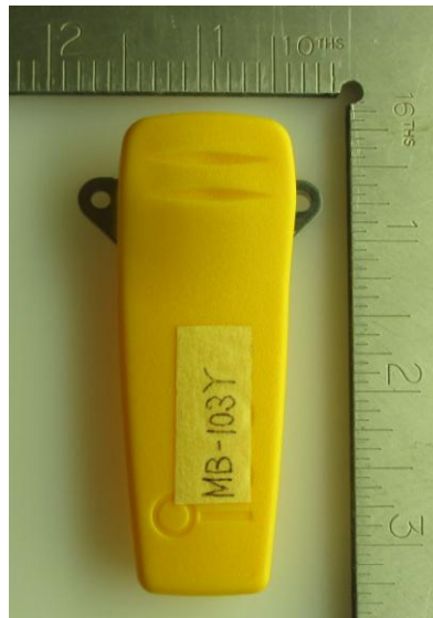
< MB-103Y Belt-clip >