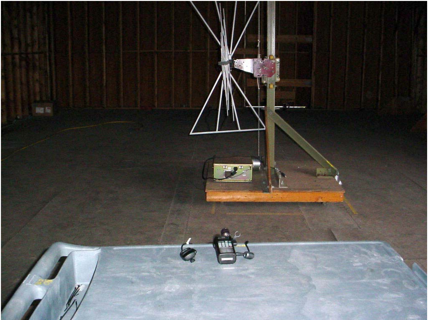
Radiated Emissions Orthogonal Position #3

Icom Incorporated VHF Transceiver, Model(s) IC-A24 / IC-A6 FCC ID: AFJ279100 IC: 202D-279100