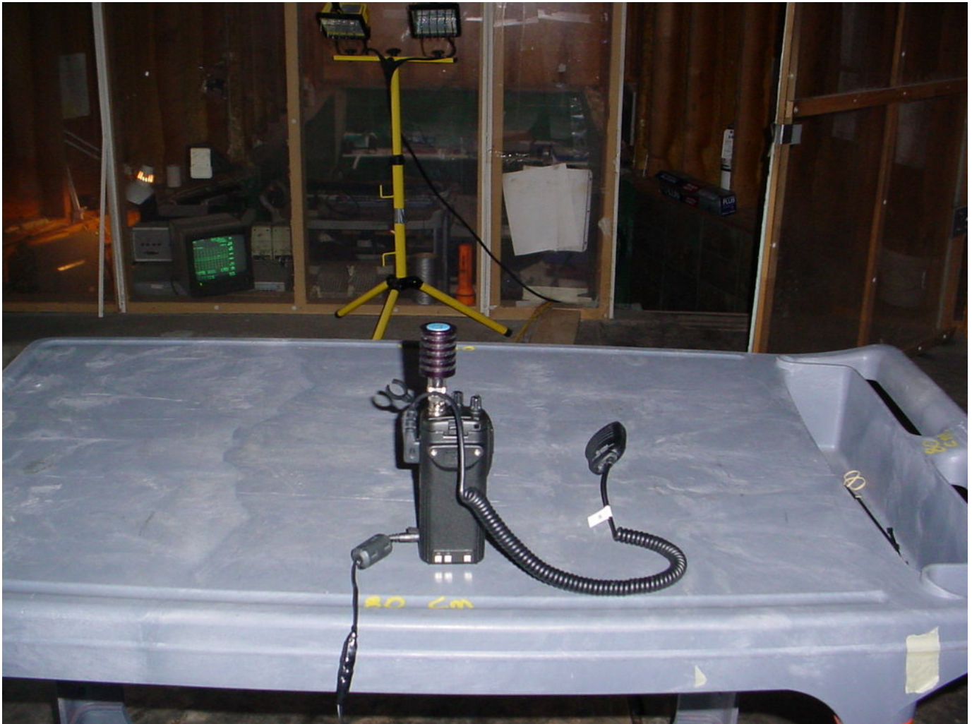
Radiated Emissions Orthogonal Position #1

Icom Incorporated VHF Transceiver, Model(s) IC-A24 / IC-A6 FCC ID: AFJ279100 IC: 202D-279100