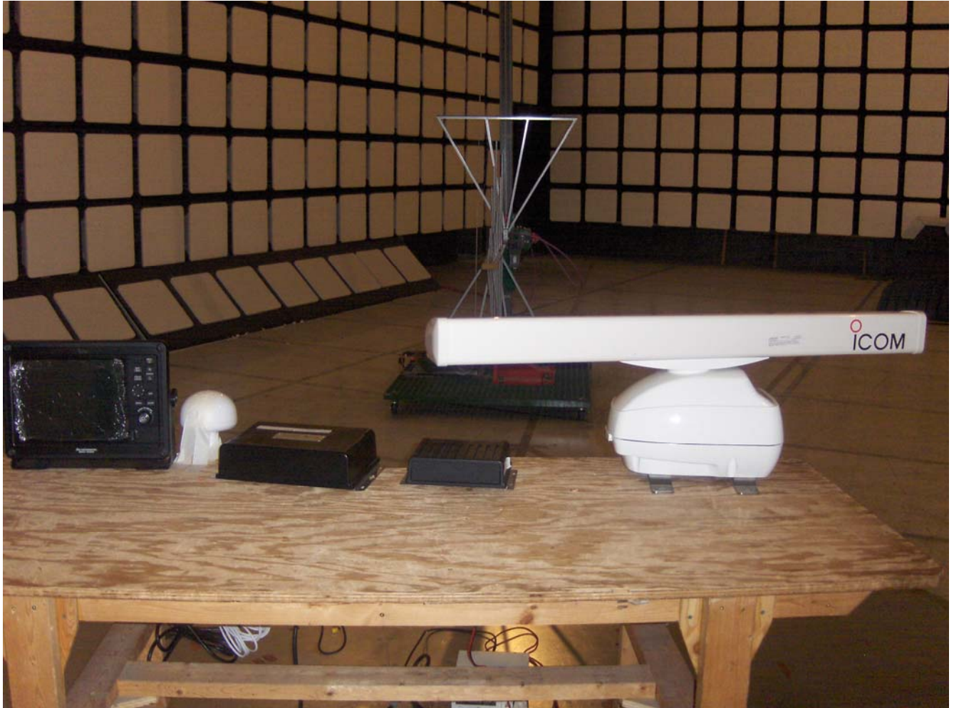
Radiated Emissions at 3m Distance