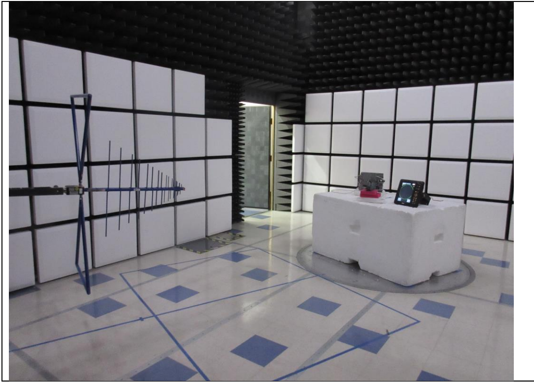
RF Radiated – Above 1 GHz